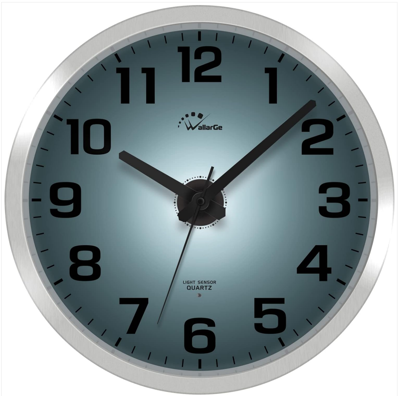
Front view of the WallarGe Night Light Wall Clock, showcasing its clear white dial and bold black numbers.