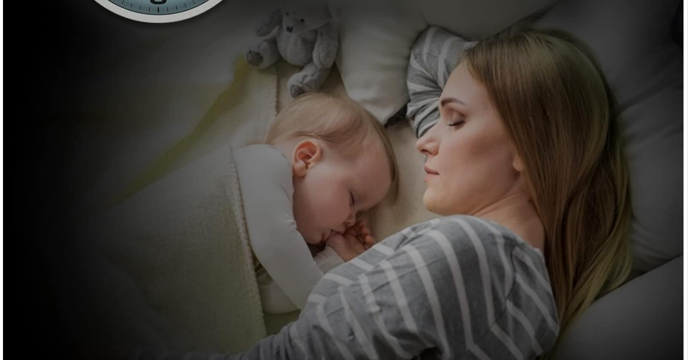
The WallarGe clock displayed in a bedroom, highlighting its silent operation for an undisturbed environment.