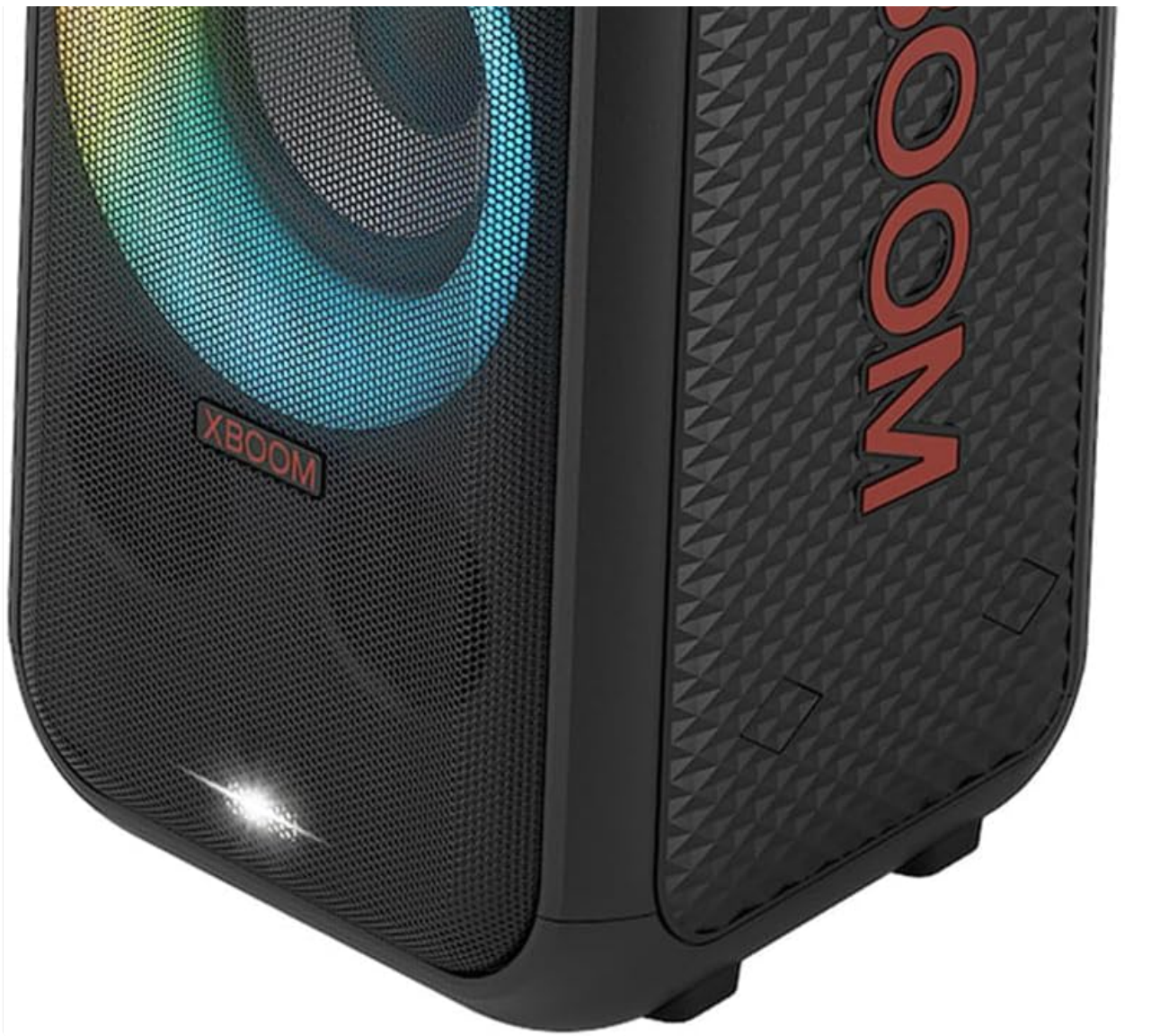
Figure 1: Front view of the LG XBOOM XL5 Portable Audio System, showcasing its multi-color ring lighting.