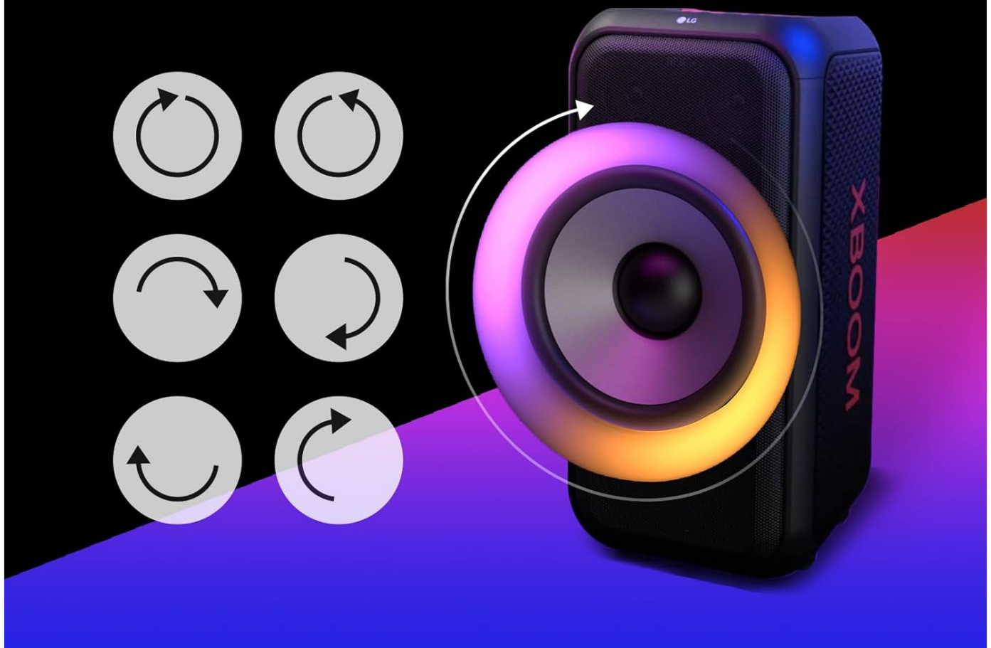
Figure 6: The LG XBOOM App allows users to customize lighting effects, including continuous color changes and various visual rhythms.

Various colors of lightings work to the beat