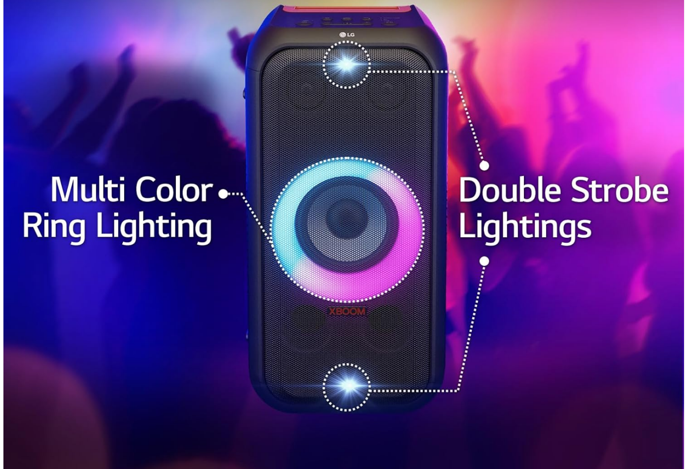
Figure 3: The LG XBOOM XL5 features a convenient pocket handle for easy portability and is IPX4 water resistant, making it suitable for various environments.

Light up the party with 2 special lighting