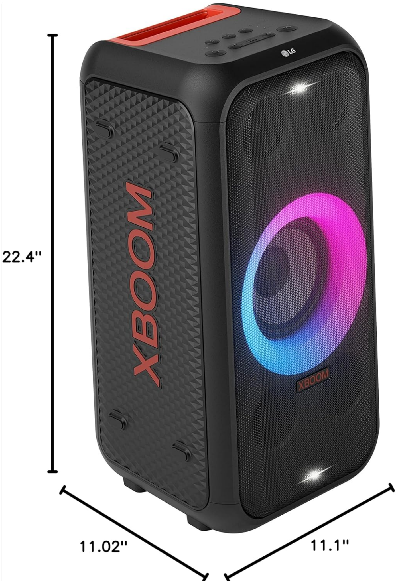
Figure 8: Dimensional overview of the LG XBOOM XL5 Portable Audio System.