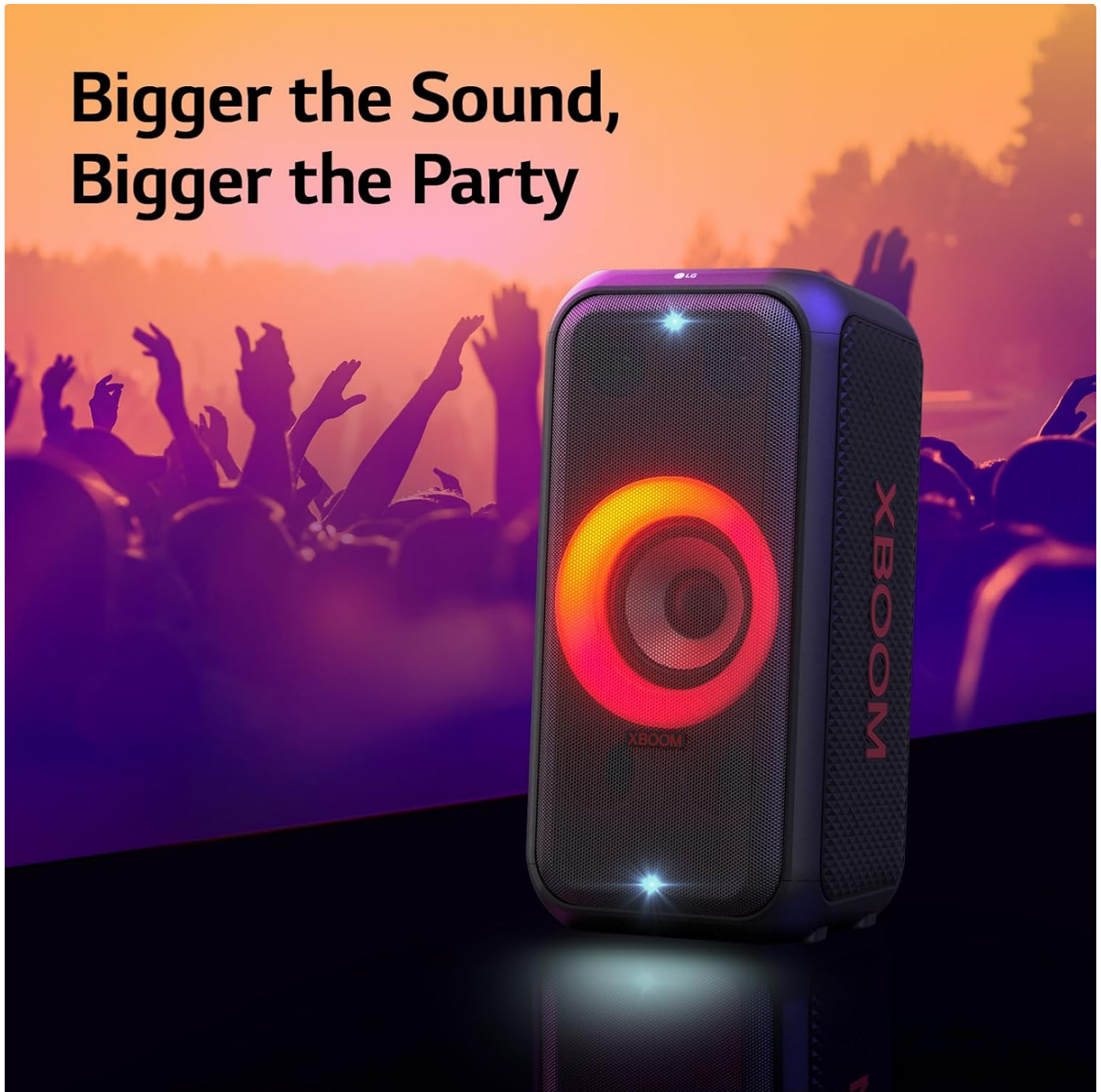
Figure 4: The two 2.5-inch dome tweeters contribute to the crisp and clear audio output of the LG XBOOM XL5.