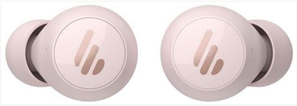
Image: Top view of the Edifier TO-U6+ earbuds, highlighting the touch control area.