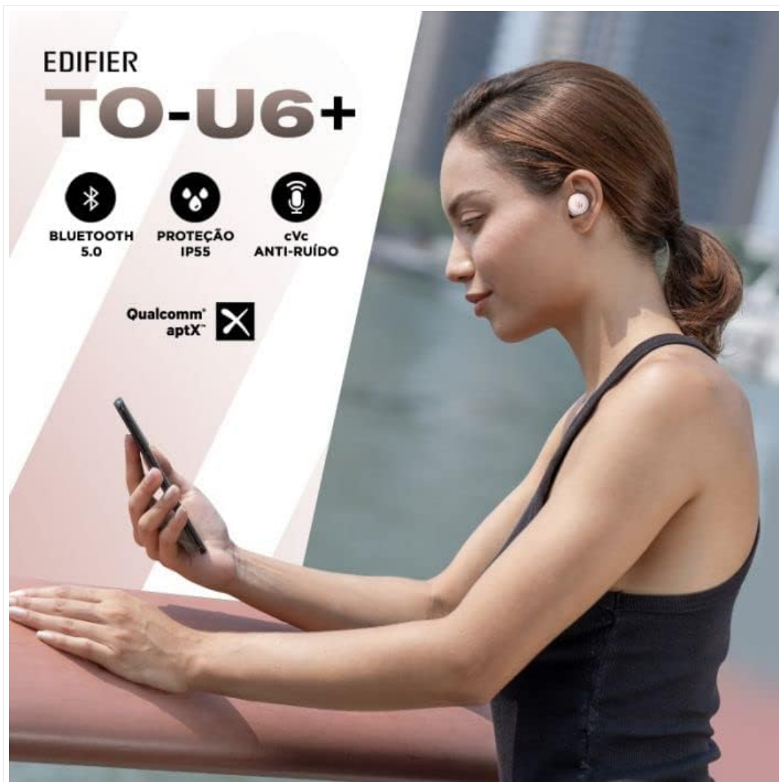
Image: A person wearing Edifier TO-U6+ earbuds, demonstrating their ergonomic fit during use.

The charging case protects the earbuds and provides additional battery life for extended listening.