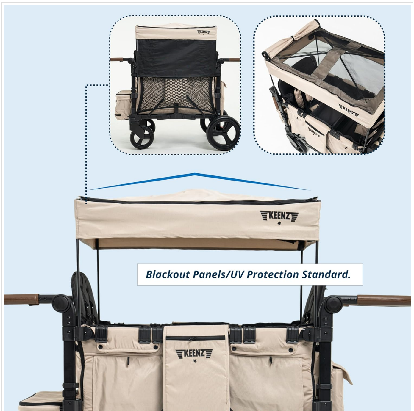
Image 4.4: The canopy system with blackout panels, providing UV protection and shade for occupants.