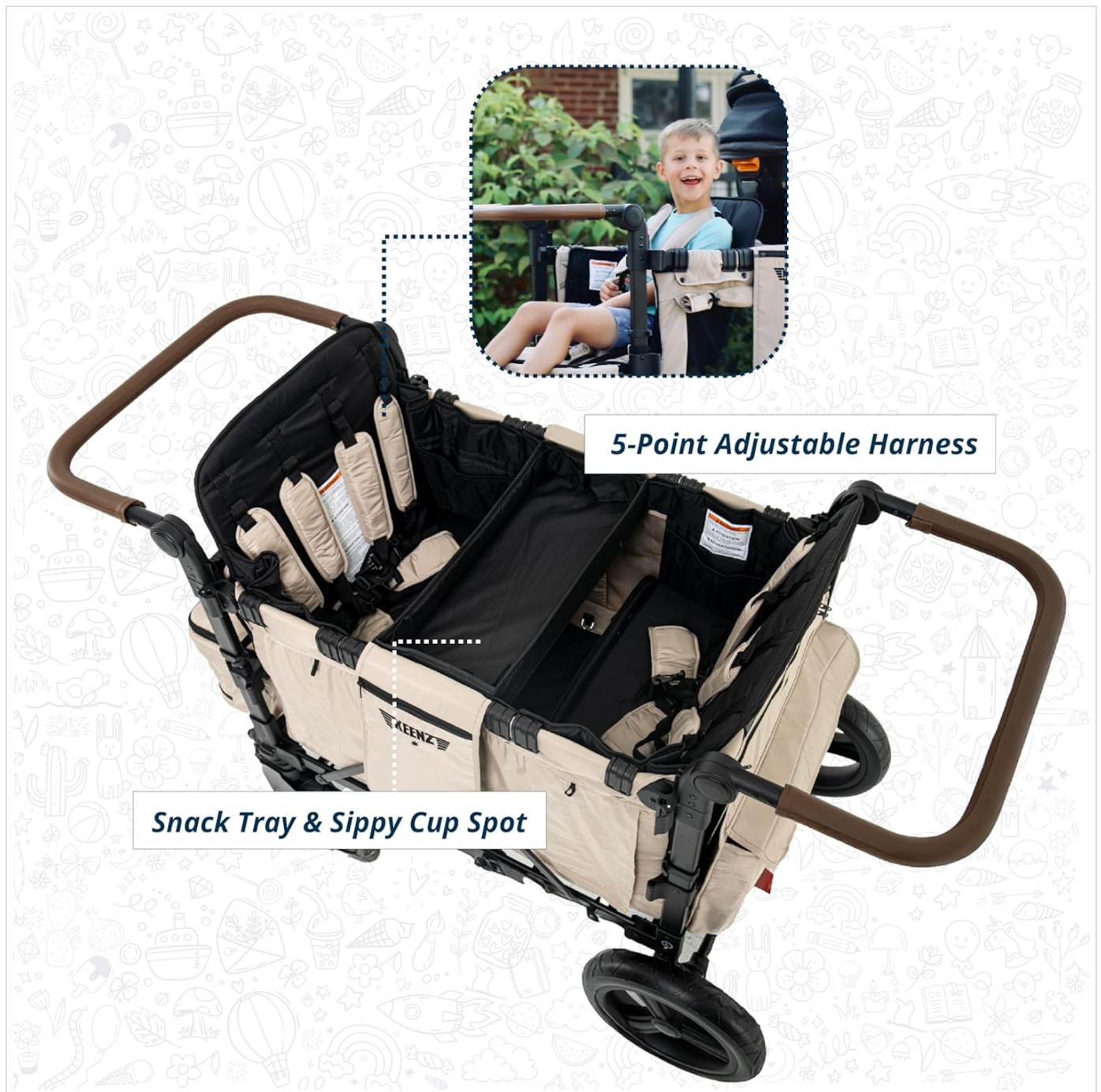
Image 4.3: Detail of the 5-point adjustable harness system and the integrated snack tray with sippy cup spot.