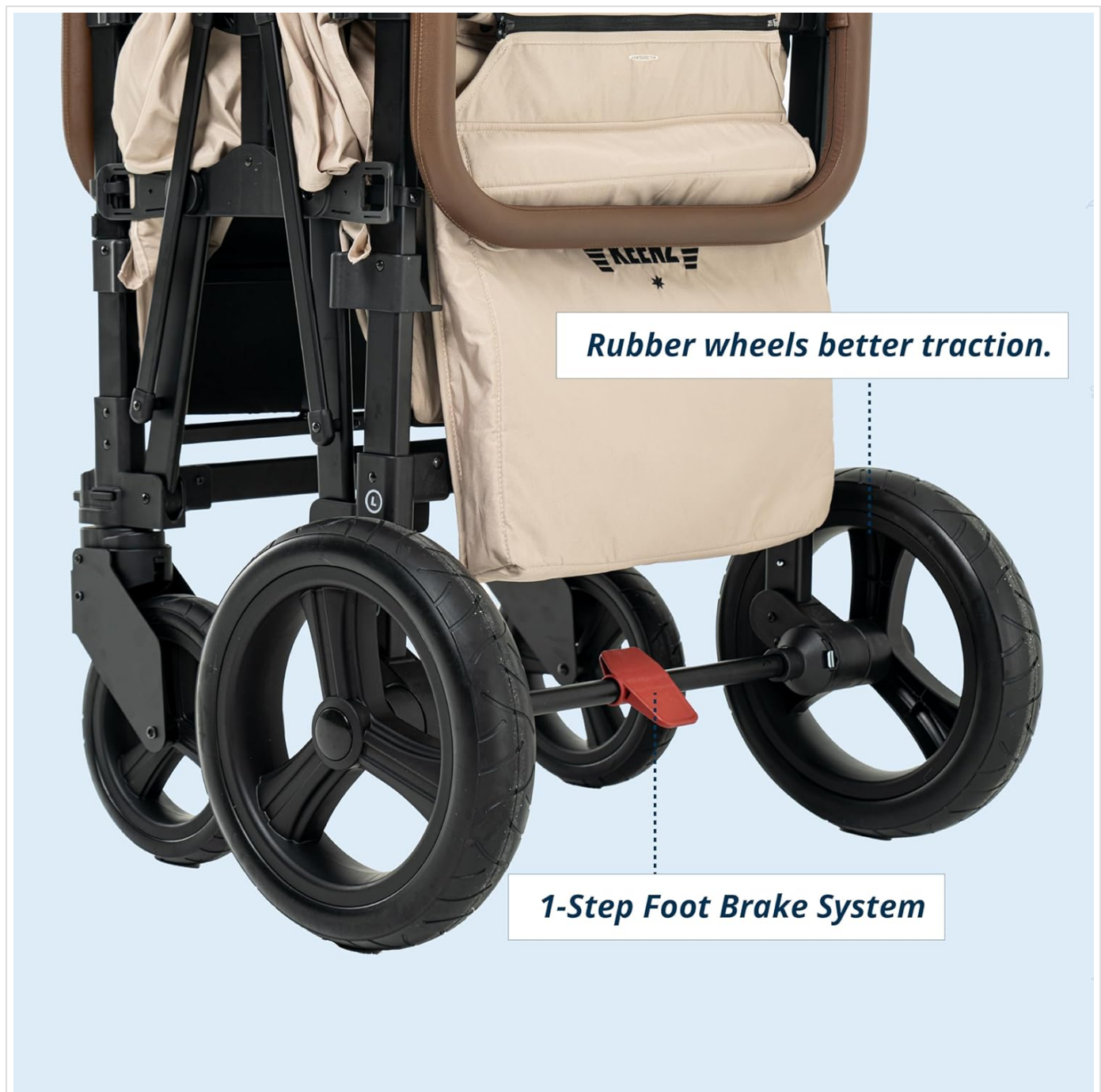
Image 4.6: View of the durable rubber wheels and the easily accessible 1-step foot brake system.