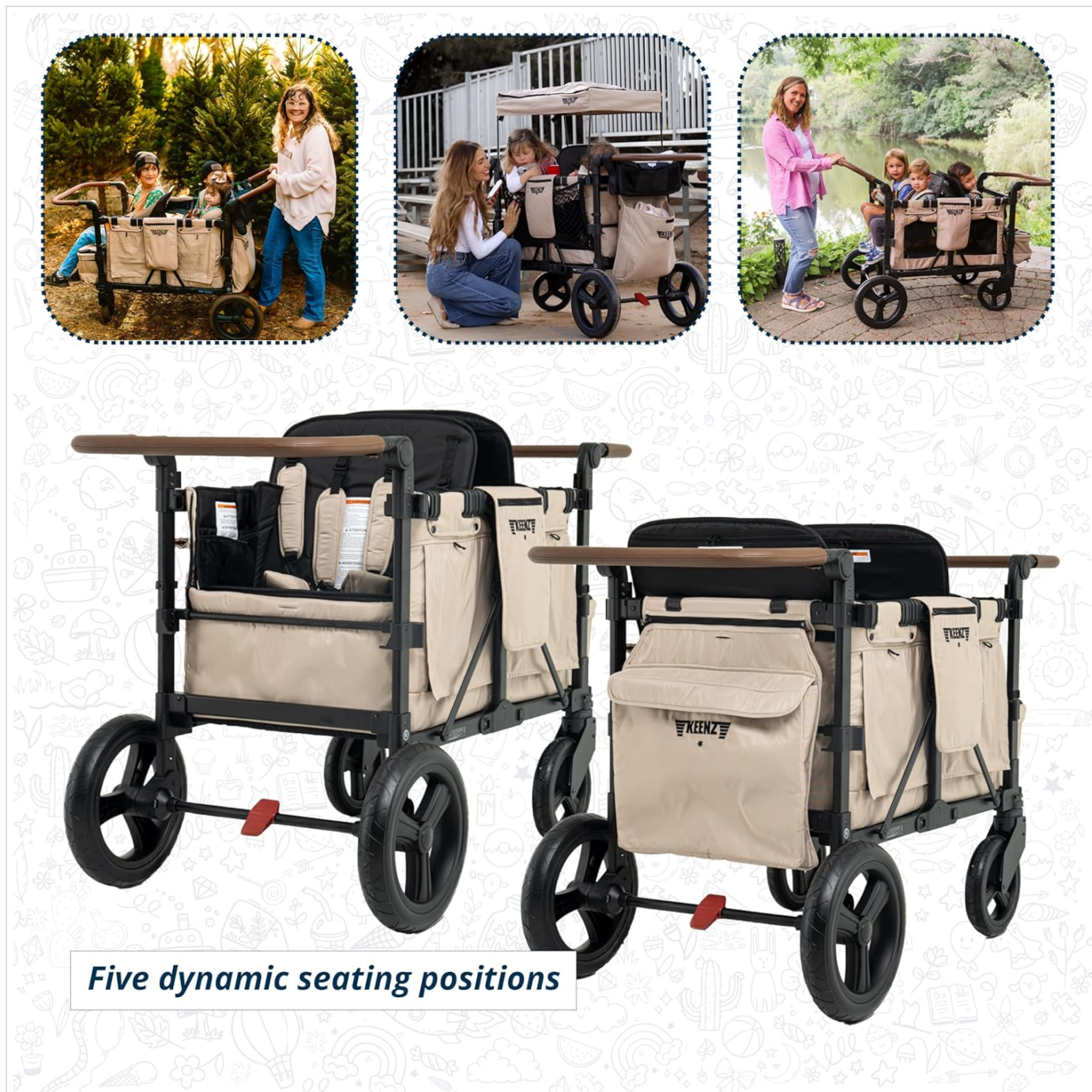
Image 4.1: Illustration of the five dynamic seating positions available in the Keenz XC+ EVO, demonstrating versatility for different passenger needs.