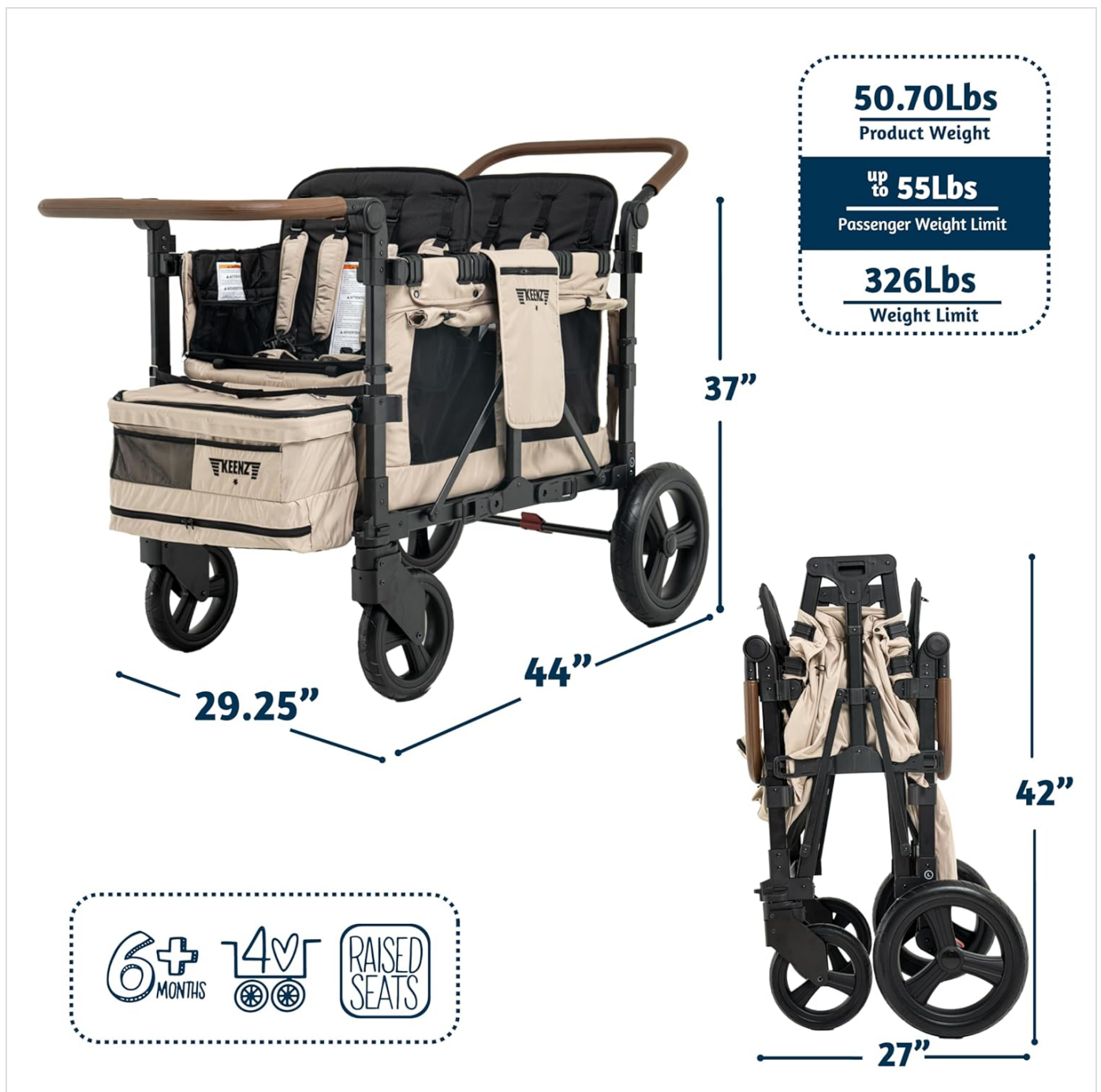
Image 7.1: Visual representation of the Keenz XC+ EVO's dimensions and weight specifications.