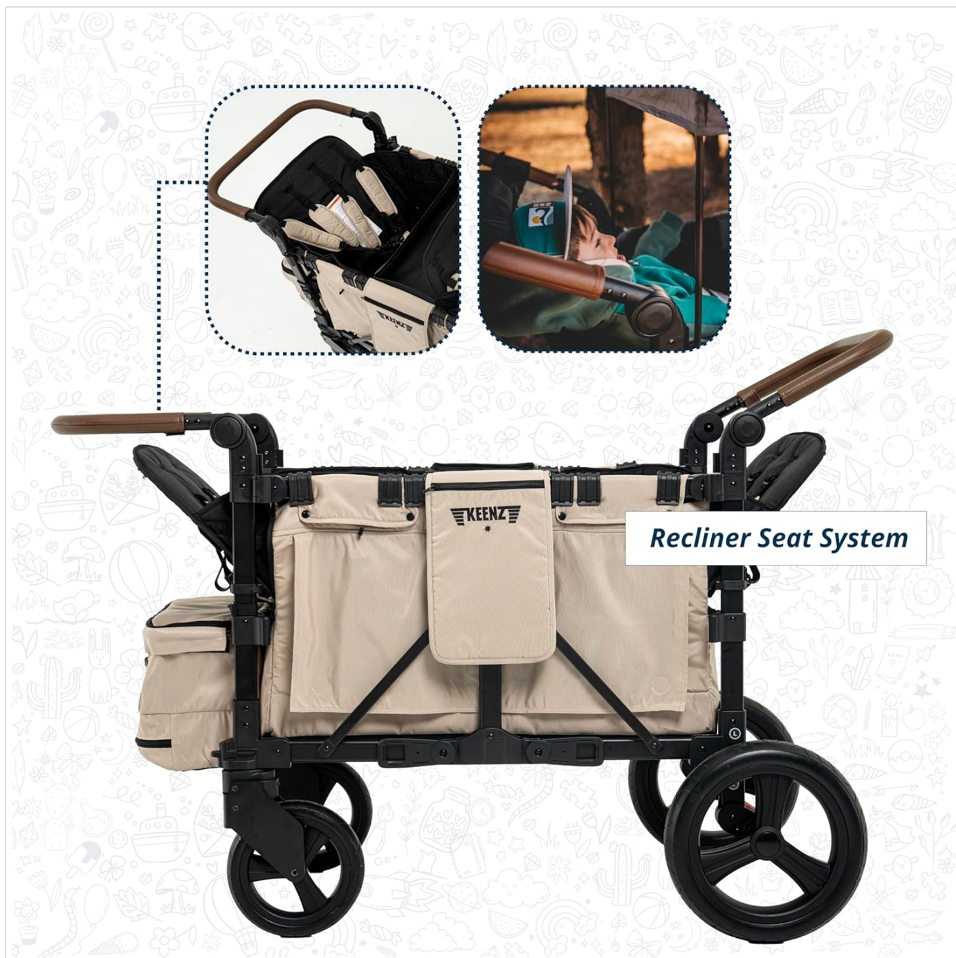
Image 4.2: Close-up view of the recliner seat system, highlighting its adjustability for passenger comfort.