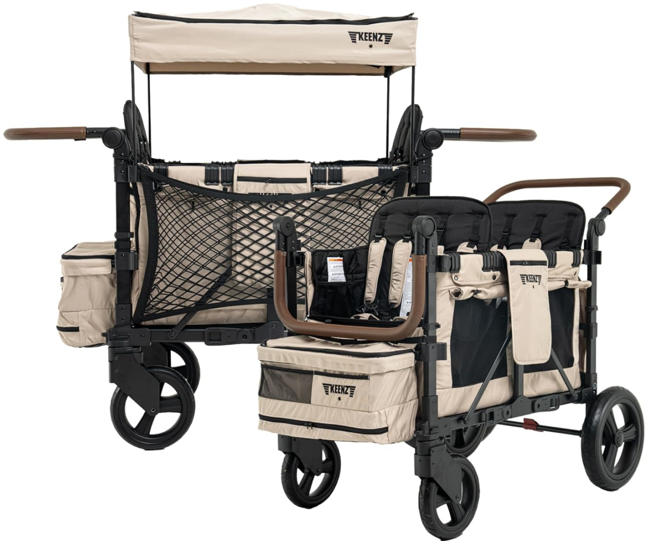
Image 2.1: The Keenz XC+ EVO 4 Passenger Stroller Wagon, showcasing its full assembly with canopy and various storage compartments.