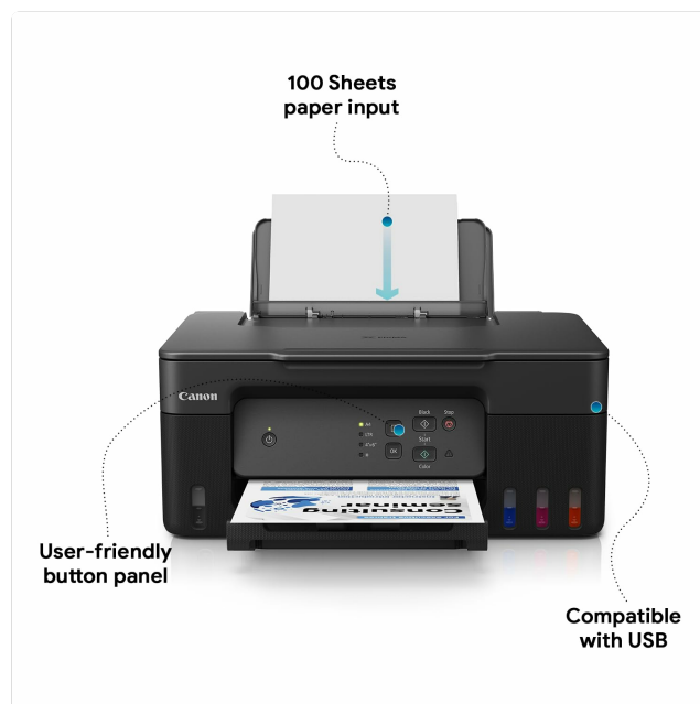
Figure 5: Paper input tray with a capacity of 100 sheets.