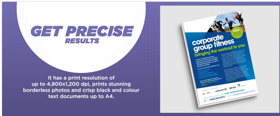
Figure 6: The printer delivers precise results with high resolution and borderless printing.