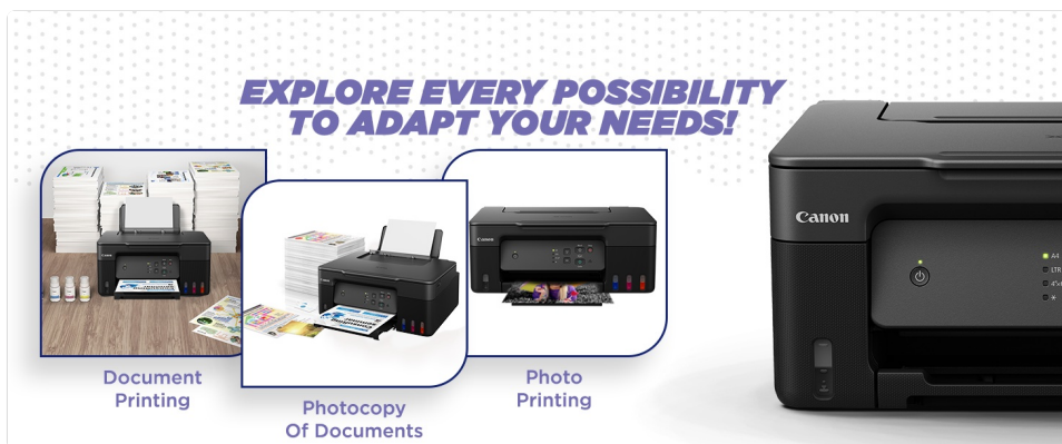
Figure 7: The printer supports various printing needs including documents and photos.