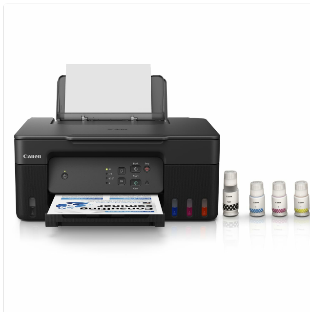
Figure 2: Printer with included ink bottles, ready for filling.