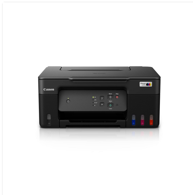
Figure 1: Front view of the Canon PIXMA MegaTank G2730 printer.

Welcome to the user manual for your Canon PIXMA MegaTank G2730 All-in-One Ink tank Colour Printer. This document provides essential information for setting up, operating, maintaining, and troubleshooting your printer. The PIXMA G2730 is designed for efficient printing, scanning, and copying, featuring a high-capacity ink tank system for cost-effective and high-volume output.