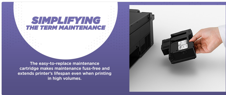
Figure 10: The easy-to-replace maintenance cartridge simplifies upkeep.