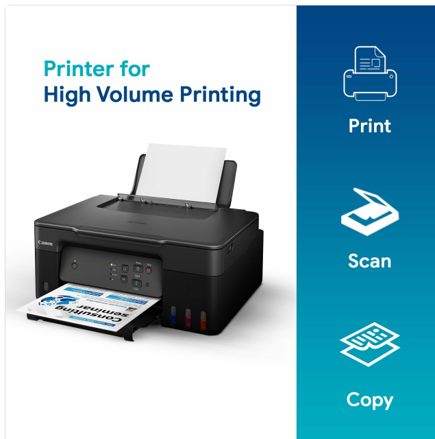
Figure 8: The printer's multi-function capabilities: Print, Scan, and Copy.