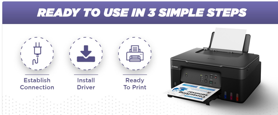
Figure 4: The three simple steps to get your printer ready for use.

on-screen instructions on the printer's control panel to complete the initial setup, including language selection and print head alignment.