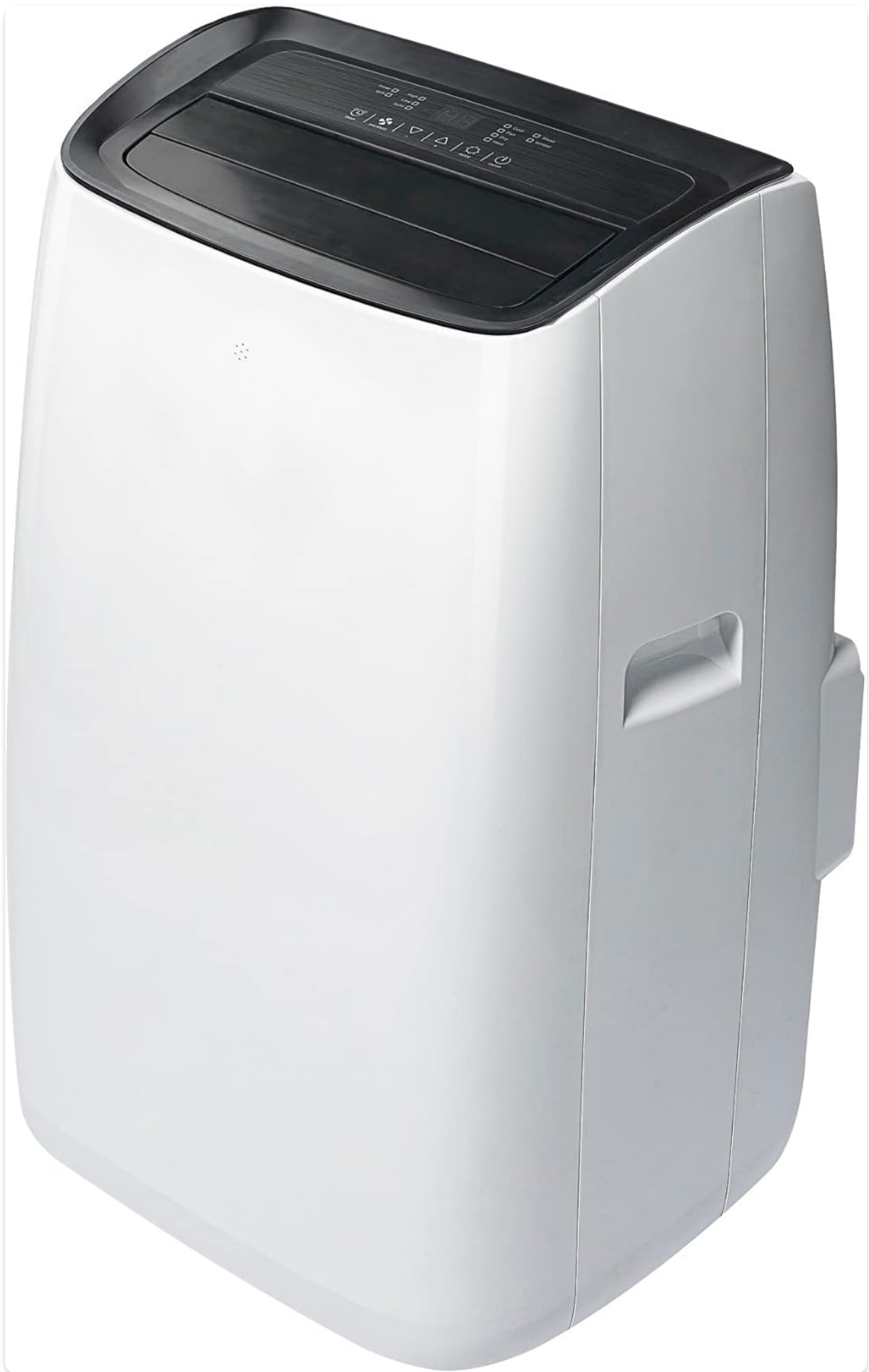
Figure 2: Side view of the HAVERLAND Portable Air Conditioner TAC-1223WC, highlighting the integrated handle for easy movement.