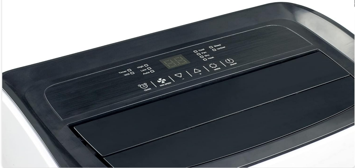
Figure 5: The remote control for the air conditioner, featuring simple and easy-to-understand buttons for various functions.