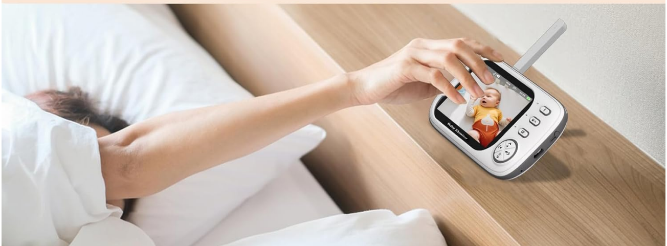
Image: Illustration of the VOX sound activation feature, where the monitor screen automatically turns on when the baby cries, saving power.

IN VOICE MODE, WHEN THE BABY CRIES, THE SCREEN WILL AUTOMATICALLY ACTIVATE AND LIGHT UP.