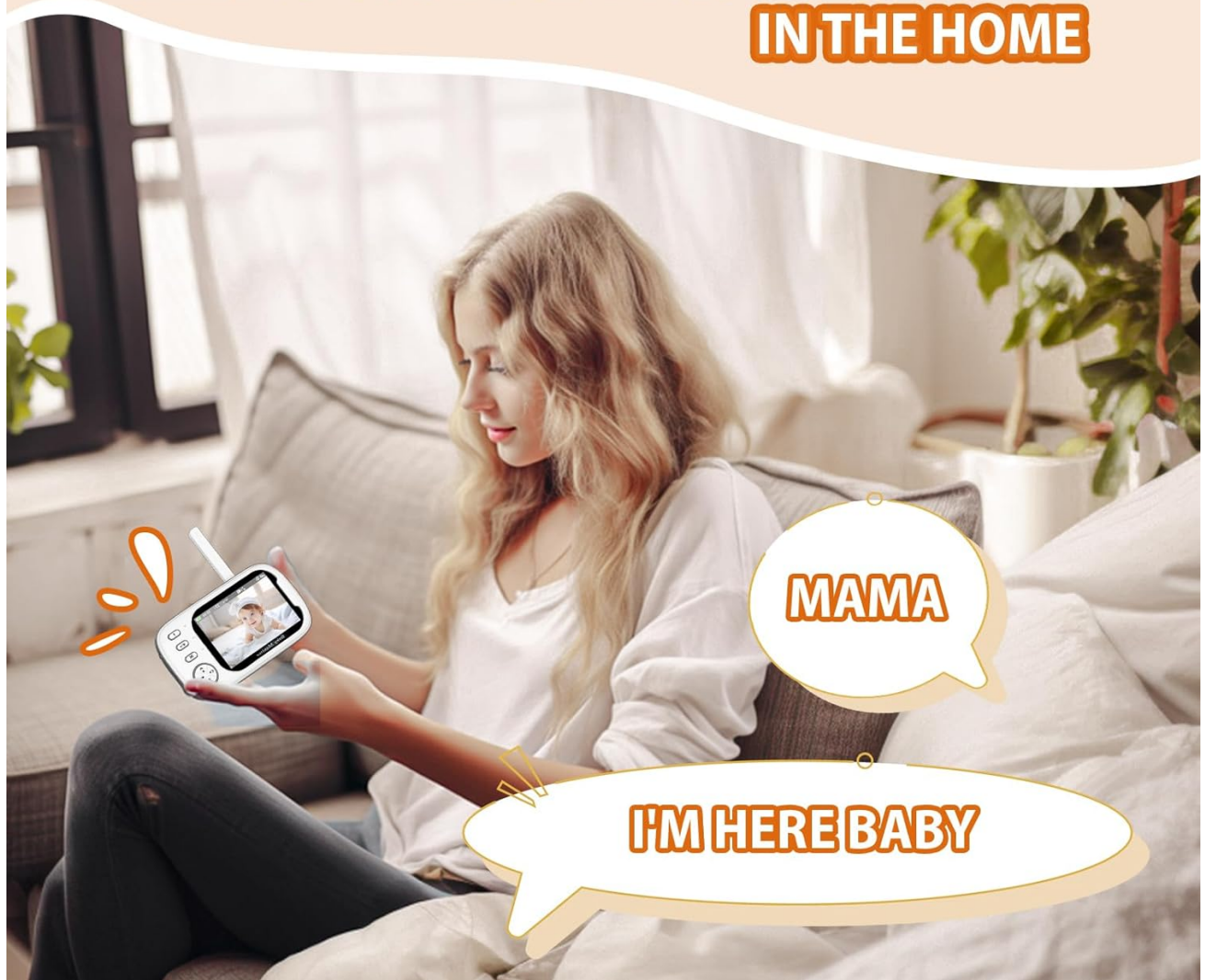
Image: A woman using the baby monitor for two-way communication, illustrating how she can talk to her baby from anywhere in the home.