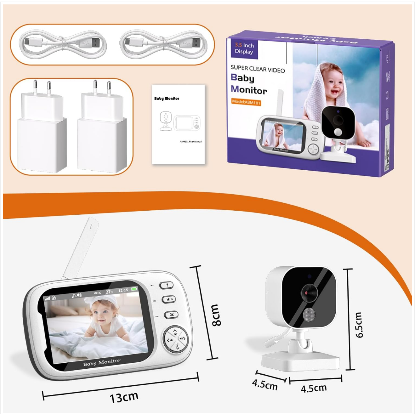
Image: Package contents of the NWOUIIAY ABM101 Baby Monitor, showing the camera unit, parent unit (monitor), two USB cables, two power adapters, and the user manual.