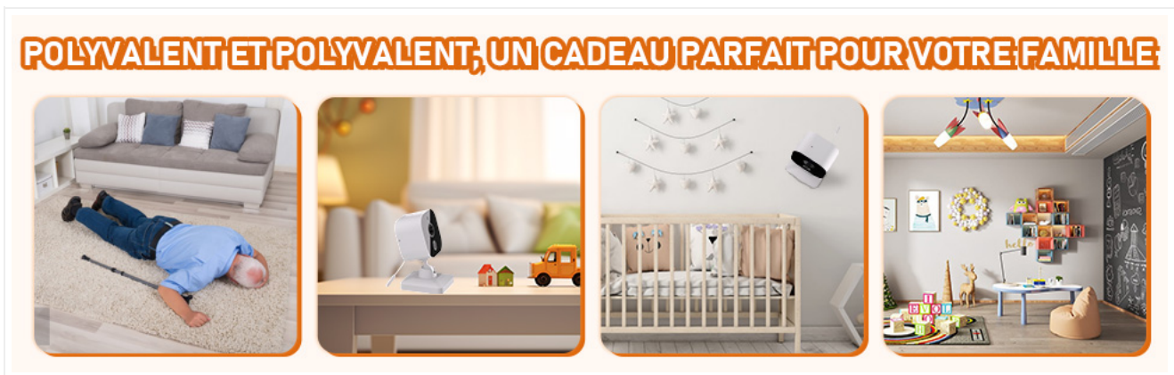
Image: Examples of suitable placements for the baby monitor camera and parent unit in different rooms, highlighting its versatility for monitoring babies or elderly individuals.