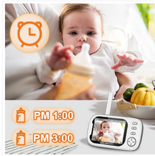
Image: The baby monitor screen displaying set alarm times, indicating the feeding reminder feature.

Set alarms on the parent unit to remind you of feeding times or other important schedules for your baby.