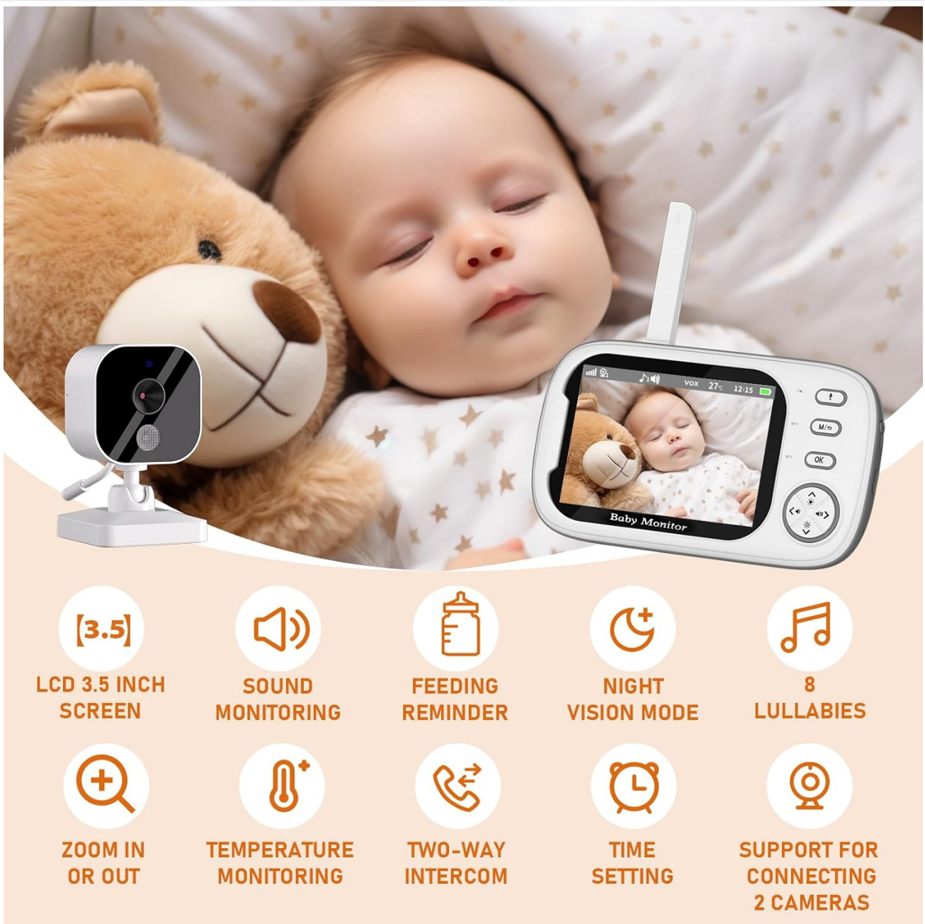
Image: An overview of the NWOUIIAY ABM101 Baby Monitor's main features, including the 3.5-inch LCD screen, sound monitoring, feeding reminder, night vision, lullabies, zoom, temperature monitoring, two-way intercom, time setting, and multi-camera support.