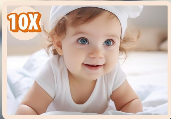
Image: Comparison of 1x and 10x zoom on the baby monitor screen, demonstrating the ability to see the baby up close.