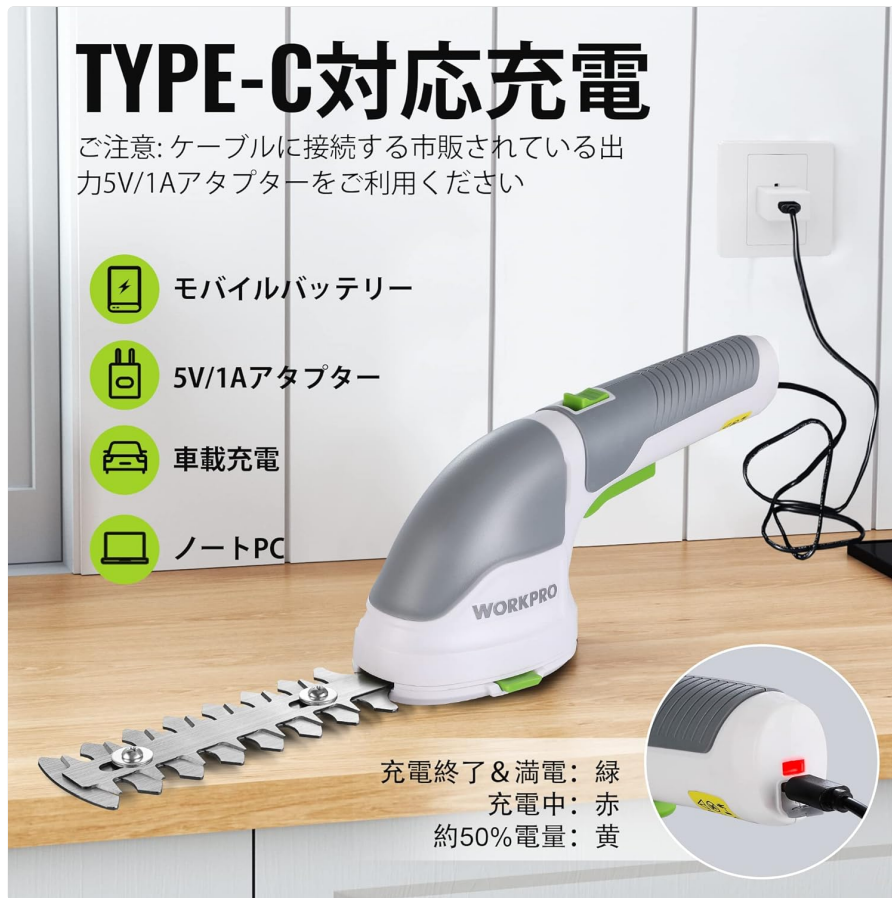
Figure 2: Type-C Charging