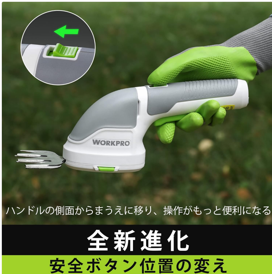
Figure 4: Safety Lock and Operating Switch