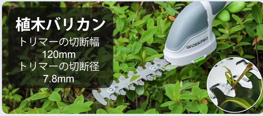
Figure 5: Grass Shearing Operation