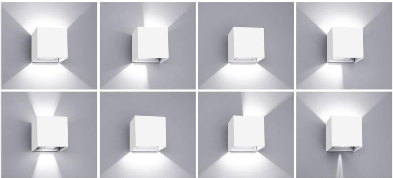
Image 6.1: A diagram illustrating the adjustable beam angle feature, showing how internal paddles can be manipulated to change the light distribution.