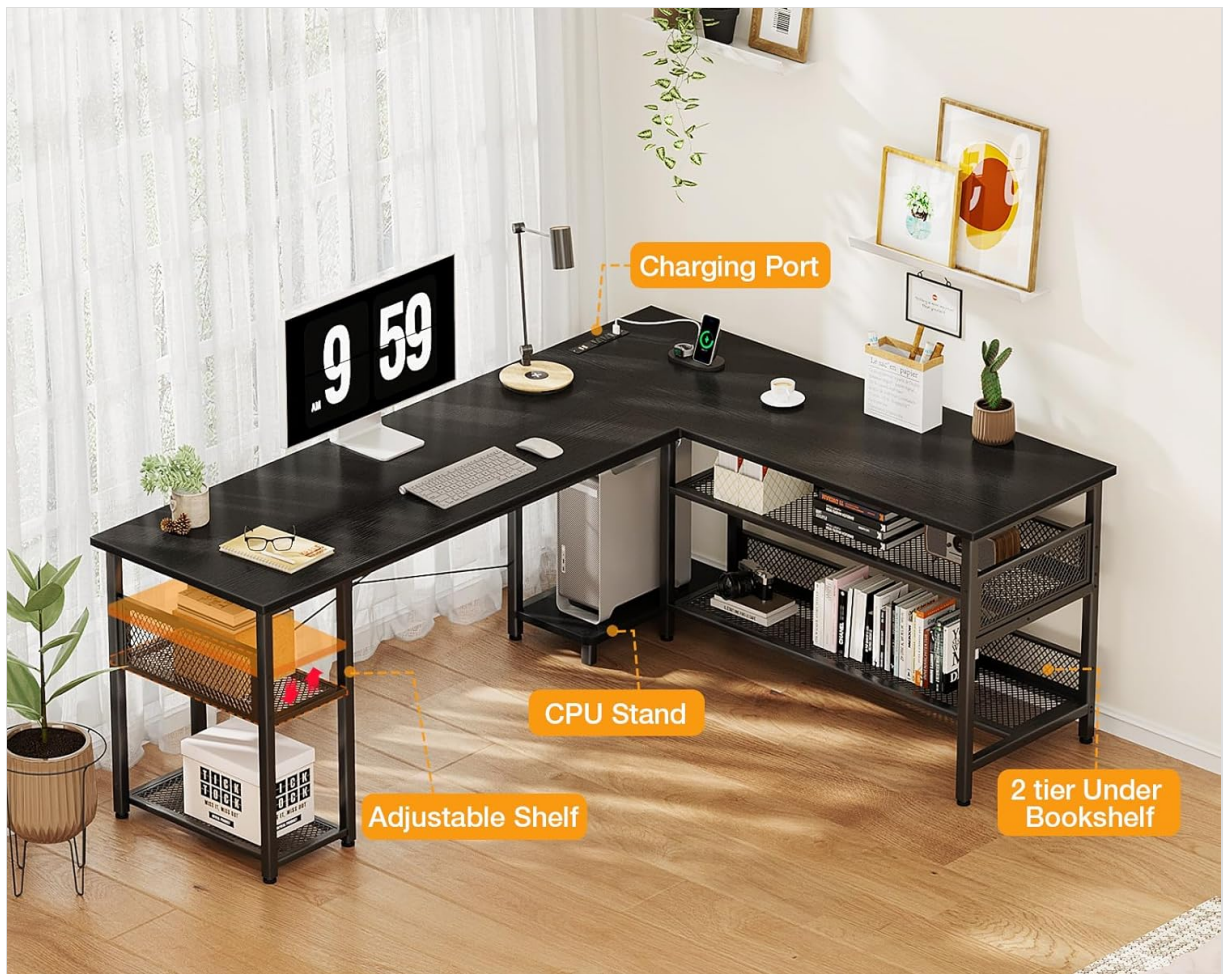
Image 4: ODK L-Shaped Desk showcasing its storage features, including the 2-tier under-bookshelf and the CPU stand.