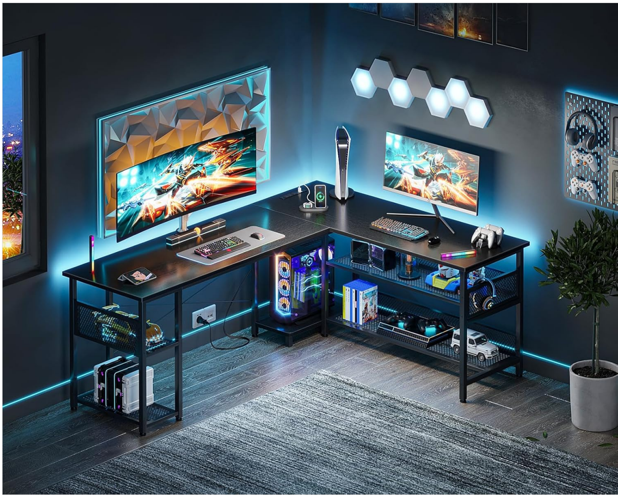
Image 1: ODK L-Shaped Desk configured for an office environment. This image shows the desk's L-shape, ample surface area for multiple monitors, and integrated shelving units.