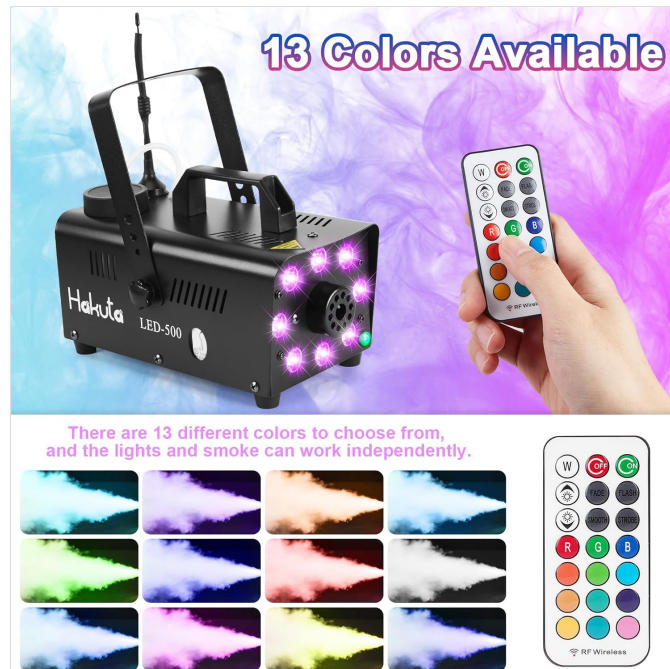
Image: The Hakuta LED-500 Fog Machine demonstrating various colored fog outputs, alongside the RF wireless remote control for LED light adjustments.

The RF wireless remote control manages the integrated LED lights, offering 13 different color options and various effects.