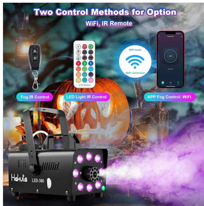
Image: Illustration of the two control methods for the Hakuta LED-500: a physical IR remote for fog and LED lights, and a smartphone app for Wi-Fi control of fog.