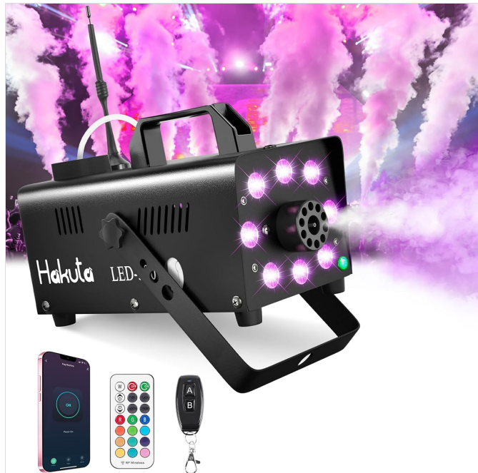
Image: Front view of the Hakuta LED-500 Fog Machine, showing the fog output nozzle, 8 LED lights, and the included remote controls and smartphone app interface.

Familiarize yourself with the components of your Hakuta LED-500 fog machine.