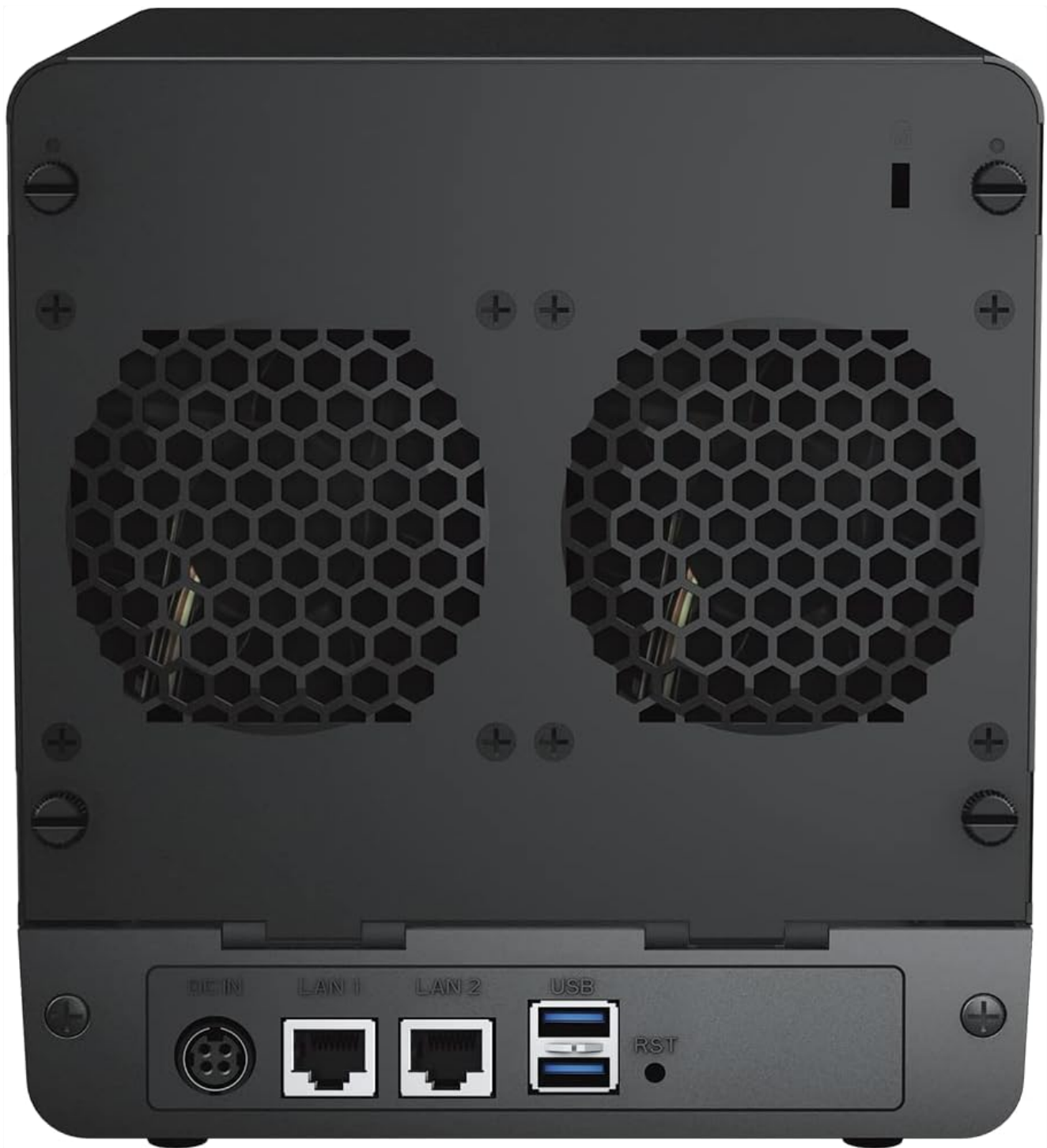
Image: Rear view of the Synology DS423, highlighting the dual fans, LAN ports, USB ports, and power input.