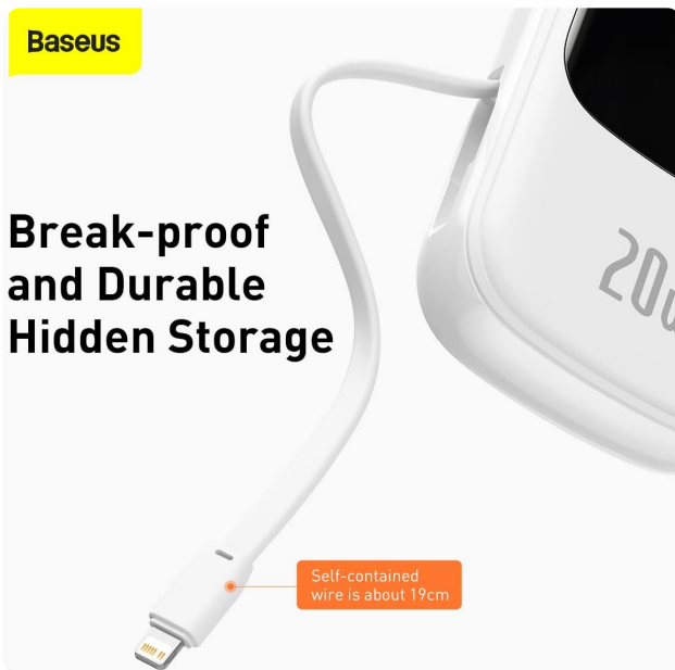
Figure 3.4: Detail of the power bank showing the integrated cable neatly stored within a hidden compartment, emphasizing its break-proof and durable design. The cable length is approximately 19cm.