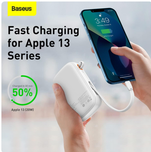
Figure 5.1: The power bank connected to an Apple iPhone 13, demonstrating fast charging capabilities. The image indicates a 50% charge in 30 minutes for Apple 13 (20W).