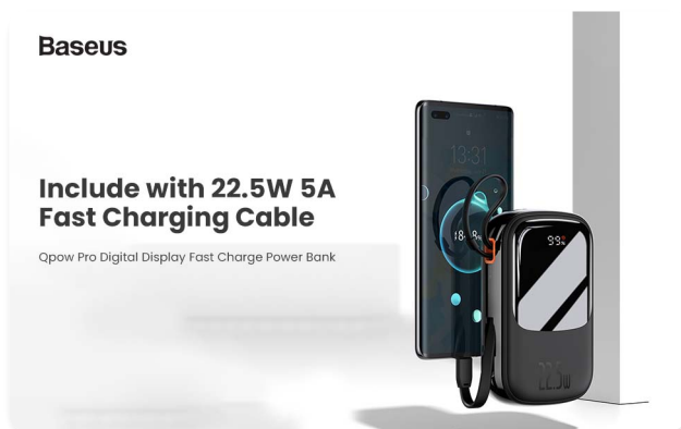
Figure 5.3: The power bank shown alongside a smartphone, highlighting the inclusion of a 22.5W 5A fast charging cable for efficient power delivery.

The digital display will show the charging status and remaining battery. Once your device is fully charged, disconnect it from the power bank.