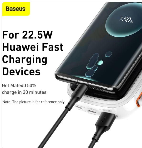
Figure 5.2: The power bank connected to a Huawei device, illustrating its compatibility with 22.5W Huawei Fast Charging. A Mate40 can achieve 50% charge in 30 minutes.