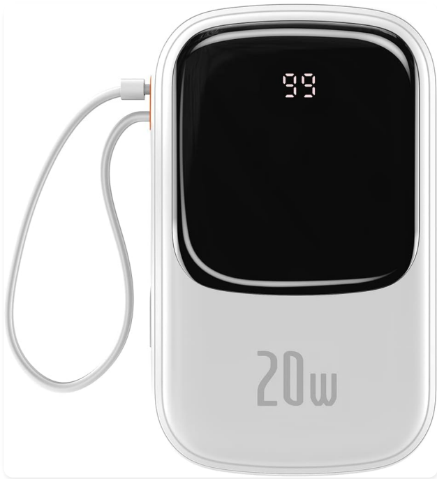
Figure 3.1: Front view of the Baseus Qpow Pro Power Bank, displaying the digital battery percentage and 20W output indicator. It features a sleek white casing with a built-in cable.