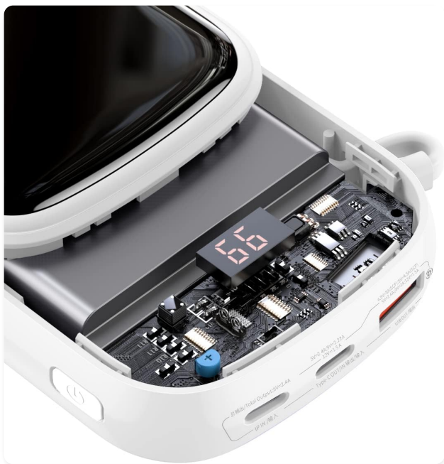
Figure 3.2: An internal view of the power bank, highlighting the advanced circuitry and the digital display module. This illustrates the quality components used for efficient power management and safety.