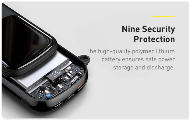
Figure 3.3: This image emphasizes the "Nine Security Protection" features, showcasing the high-quality polymer lithium battery and internal components designed for safe power storage and discharge.