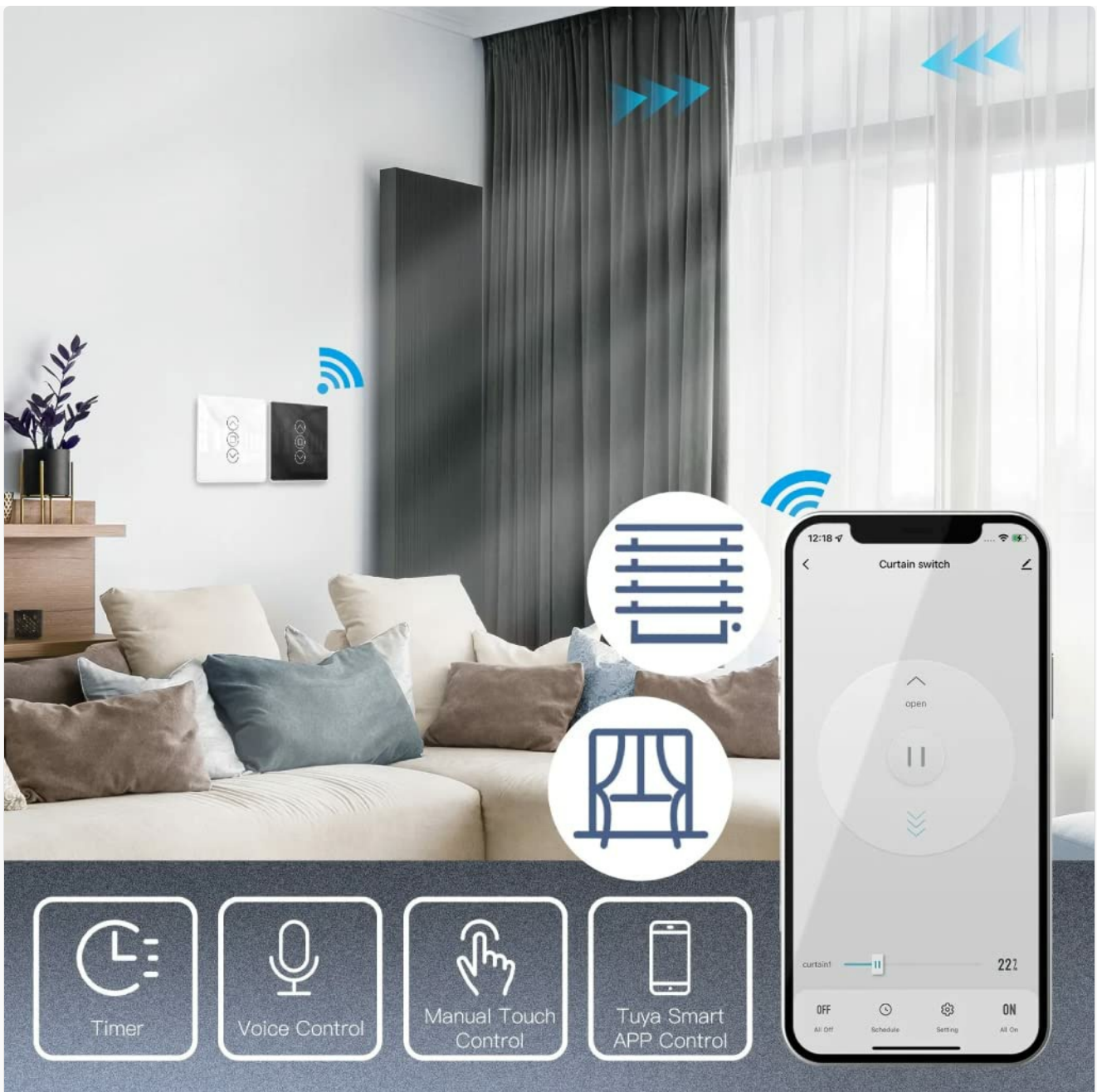
Image 5.1: Overview of control methods for the MOES Smart WiFi Curtain Switch, including timer, voice control, manual touch control, and Tuya Smart APP control.