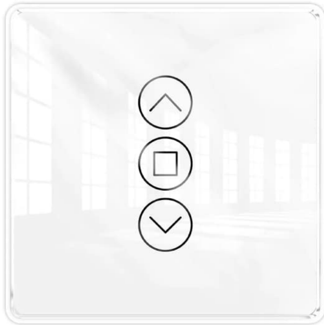
Image 1.1: Front view of the MOES Smart WiFi Curtain Switch, showcasing its sleek 2.5D arc glass touch panel with clearly marked 'open', 'stop', and 'close' icons.