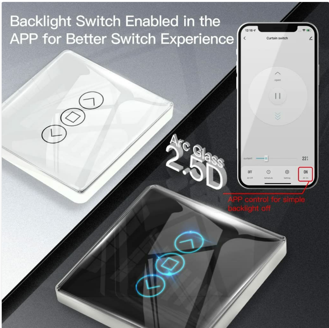
Image 5.3: The MOES Smart WiFi Curtain Switch with its backlight illuminated, demonstrating the "Backlight Switch Enabled in the APP for Better Switch Experience" feature, with a smartphone showing the app interface for controlling the backlight.