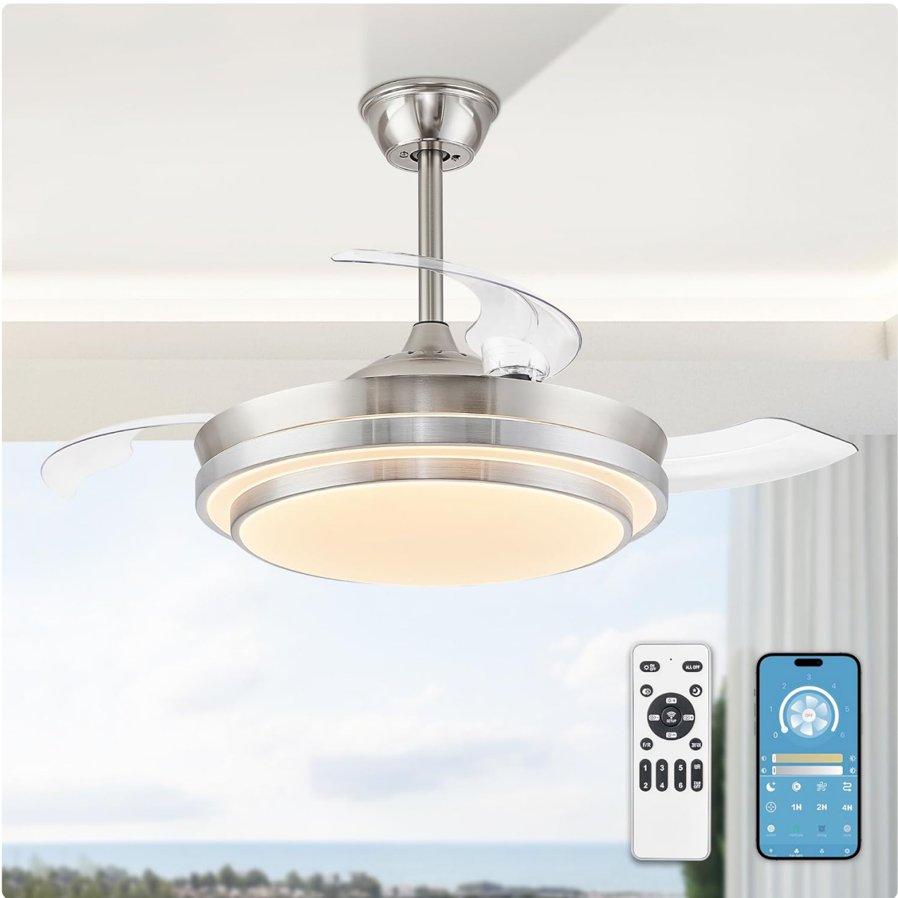
Figure 1: LEDIARY 42 Inch Retractable Ceiling Fan in Brush Nickel finish, showcasing its integrated LED lighting and remote control.