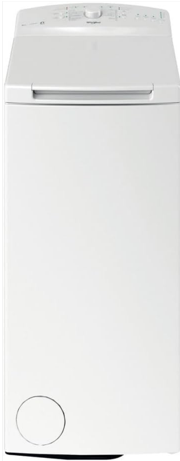
Image: Front view of the Whirlpool TDLR6240LFR/N washing machine, showing its compact, white design.

Place the washing machine on a flat, stable floor. Use a spirit level to ensure the machine is perfectly level. Adjust the adjustable feet as necessary to prevent vibrations during operation.