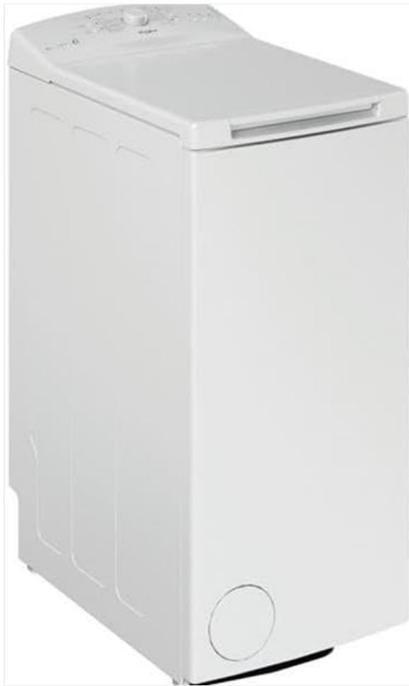
Image: Angled view of the washing machine with the lid closed, highlighting the control panel with its mechanical dial.