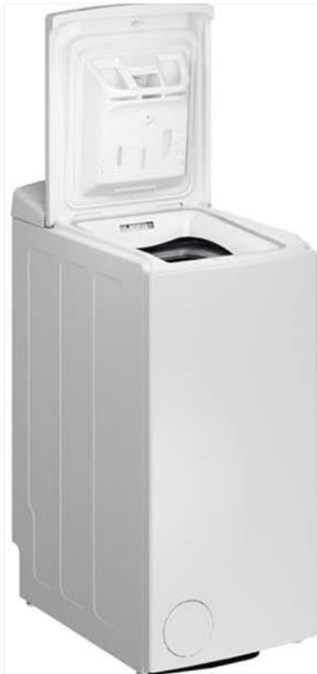
Image: Top view of the washing machine with the lid open, revealing the drum ready for loading.

Open the top lid of the washing machine. Ensure the drum flaps are open. Load laundry loosely into the drum, making sure not to overload it. The maximum capacity is 6 kg. Close the drum flaps and then the top lid securely.