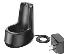
Charging Dock + Cord