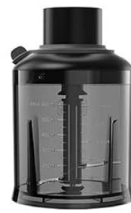
Food Chopper Attachment