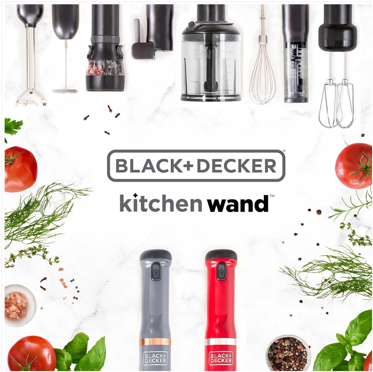
Figure 5: Chopping ingredients with the Kitchen Wand.