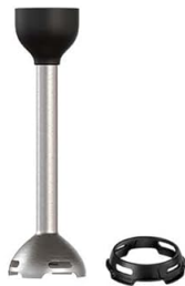
Immersion Blender Attachment + Guard