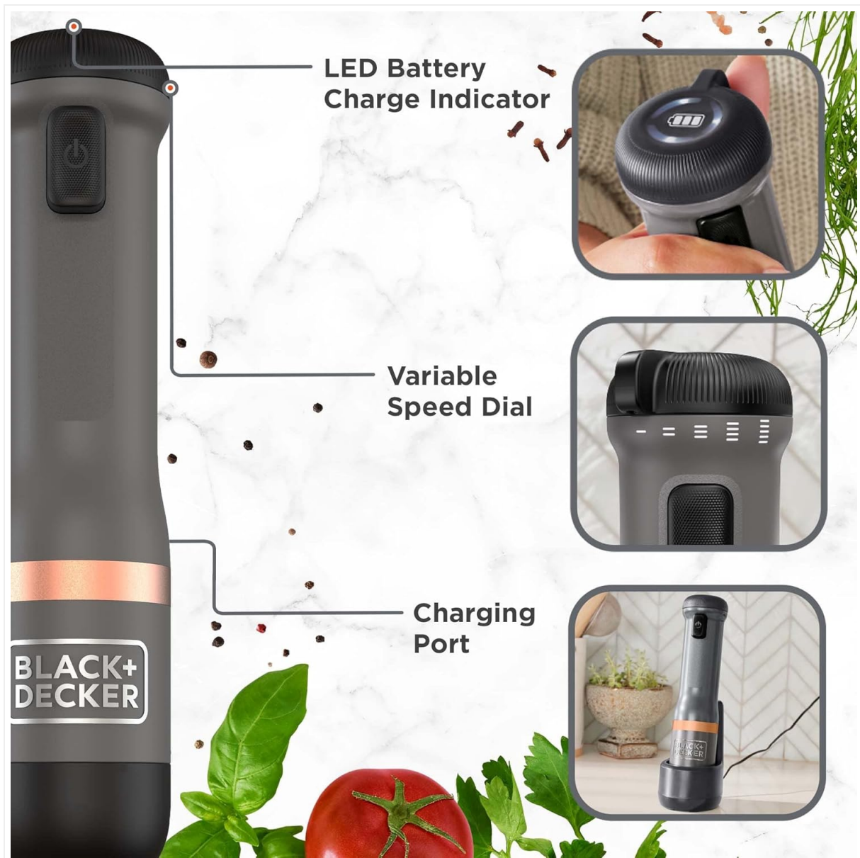
Figure 1: All components included in the BLACK+DECKER Kitchen Wand set.