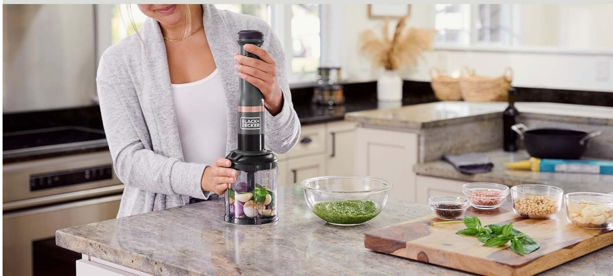
Figure 4: Whisking ingredients with the Kitchen Wand.