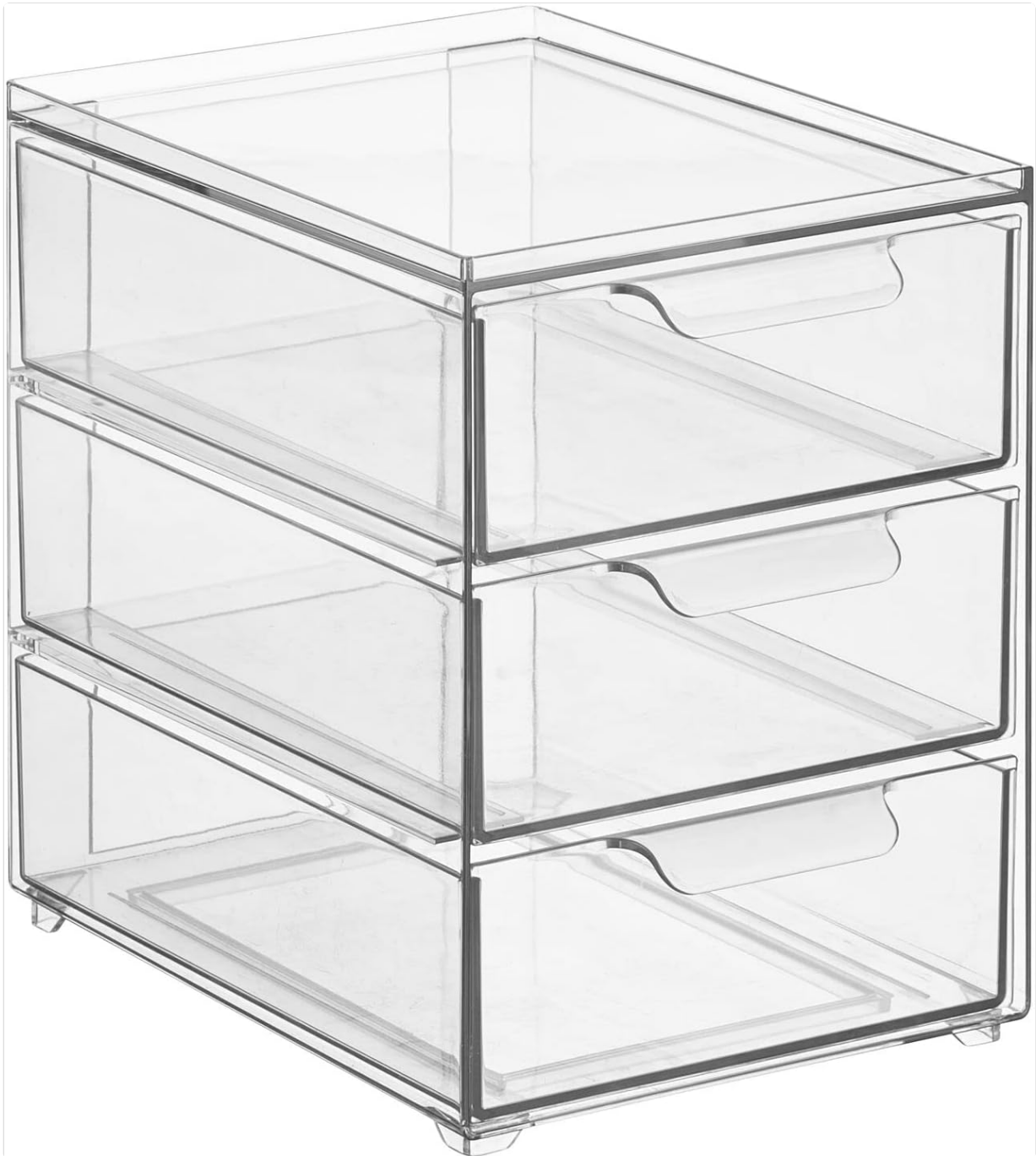
Image 2.1: An empty mDesign 3-drawer organizer, illustrating its clear structure before items are placed inside.