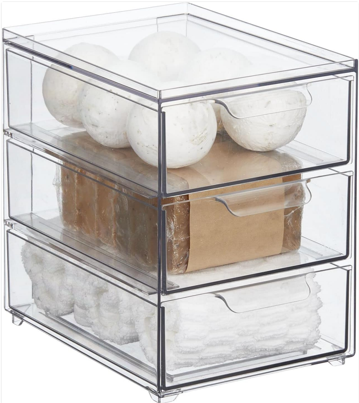
Image 1.1: The mDesign 3-drawer organizer, showcasing its clear design and capacity for various items like bath bombs and towels.