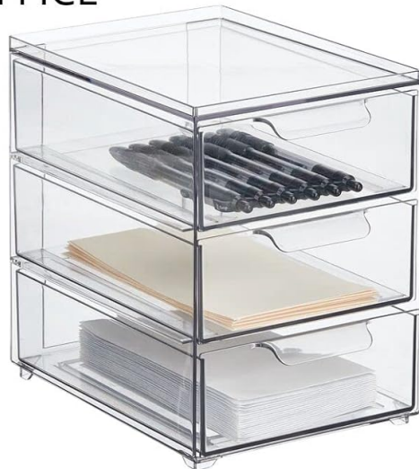
Image 3.2: Various application examples for the organizer, including kitchen, cosmetics, craft, and office settings.