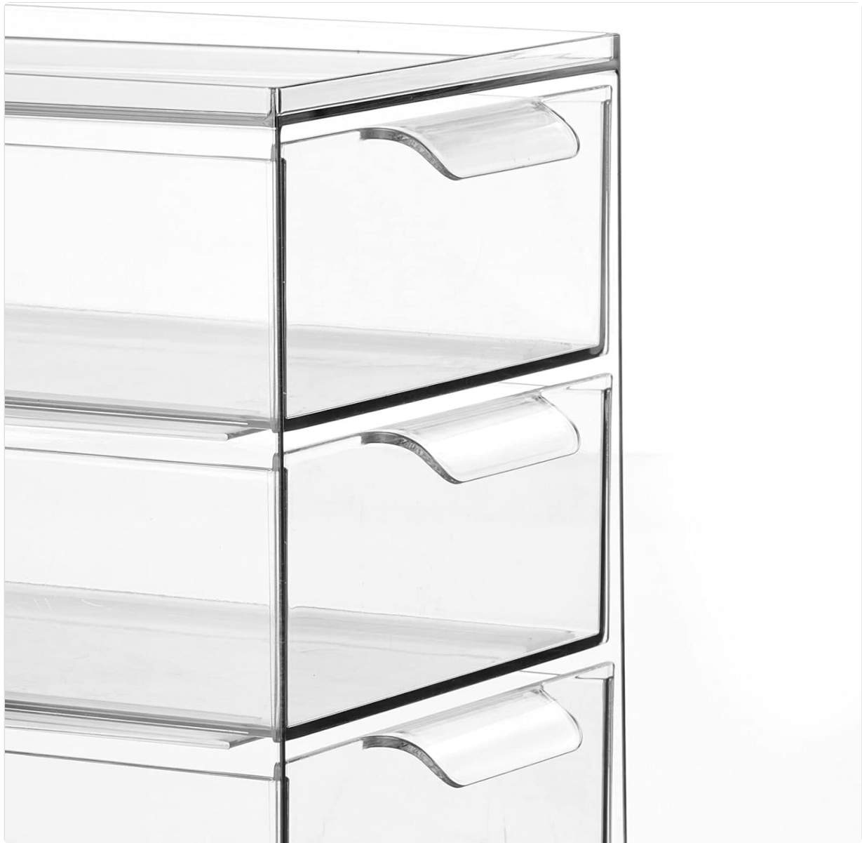
Image 3.1: A close-up view of the ergonomic pull handle on one of the organizer's drawers.