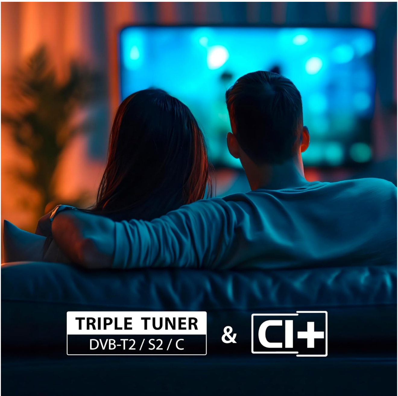
Figure 7: The DYON Movie Smart 32 VX features an integrated Triple Tuner and CI+ slot for versatile reception options.