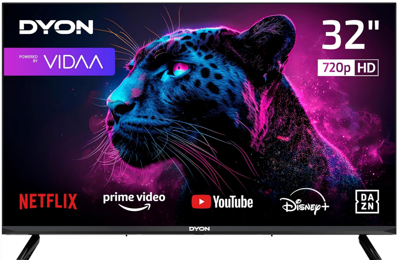
Figure 1: Front view of the DYON Movie Smart 32 VX Smart TV.

This manual provides detailed instructions for the setup, operation, and maintenance of your DYON Movie Smart 32 VX Smart TV. Please read this manual thoroughly before using the television to ensure proper functionality and to maximize your viewing experience. Keep this manual for future reference.