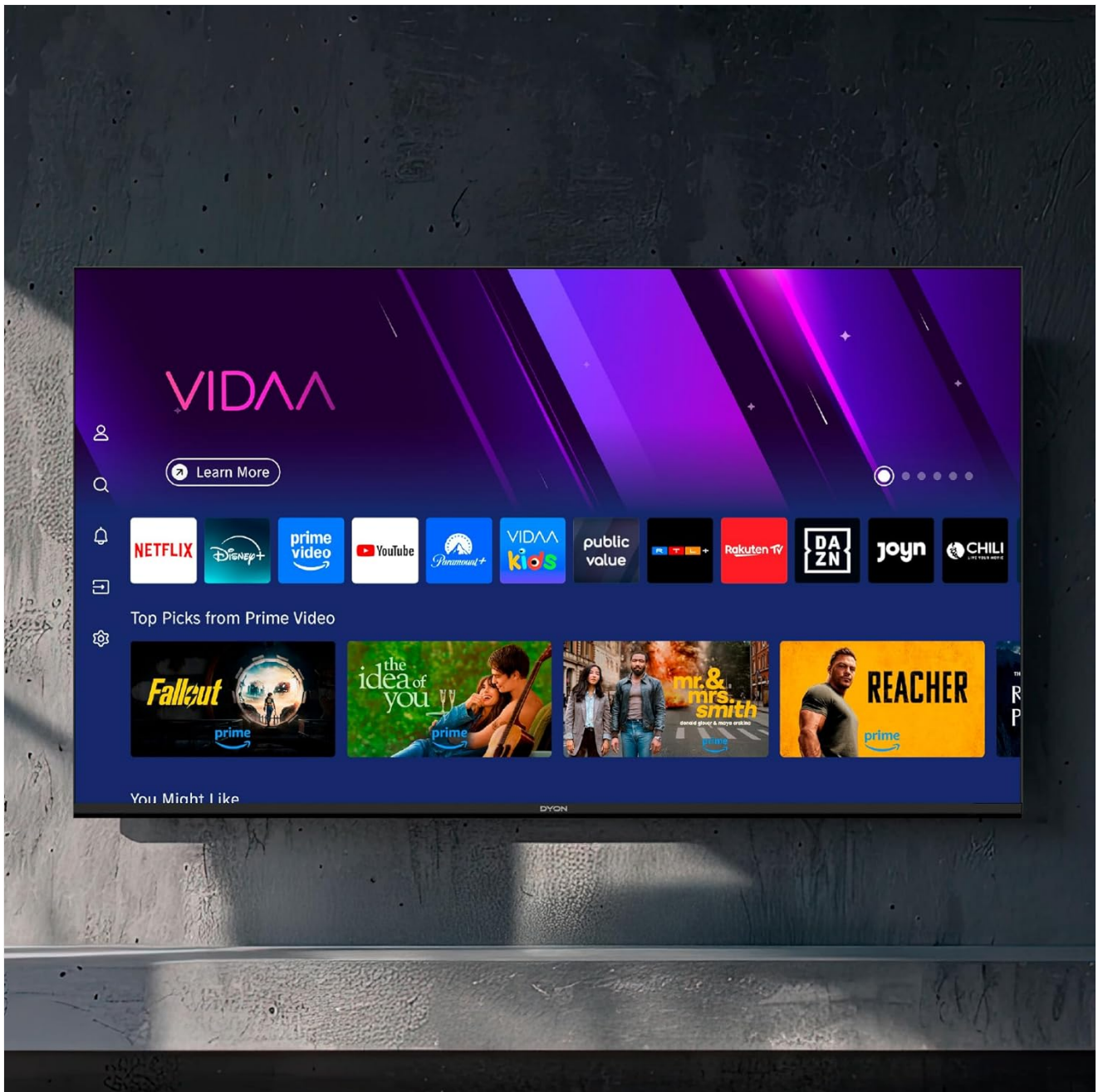
Figure 4: The intuitive VIDAA U Smart TV interface, displaying various applications and content suggestions.