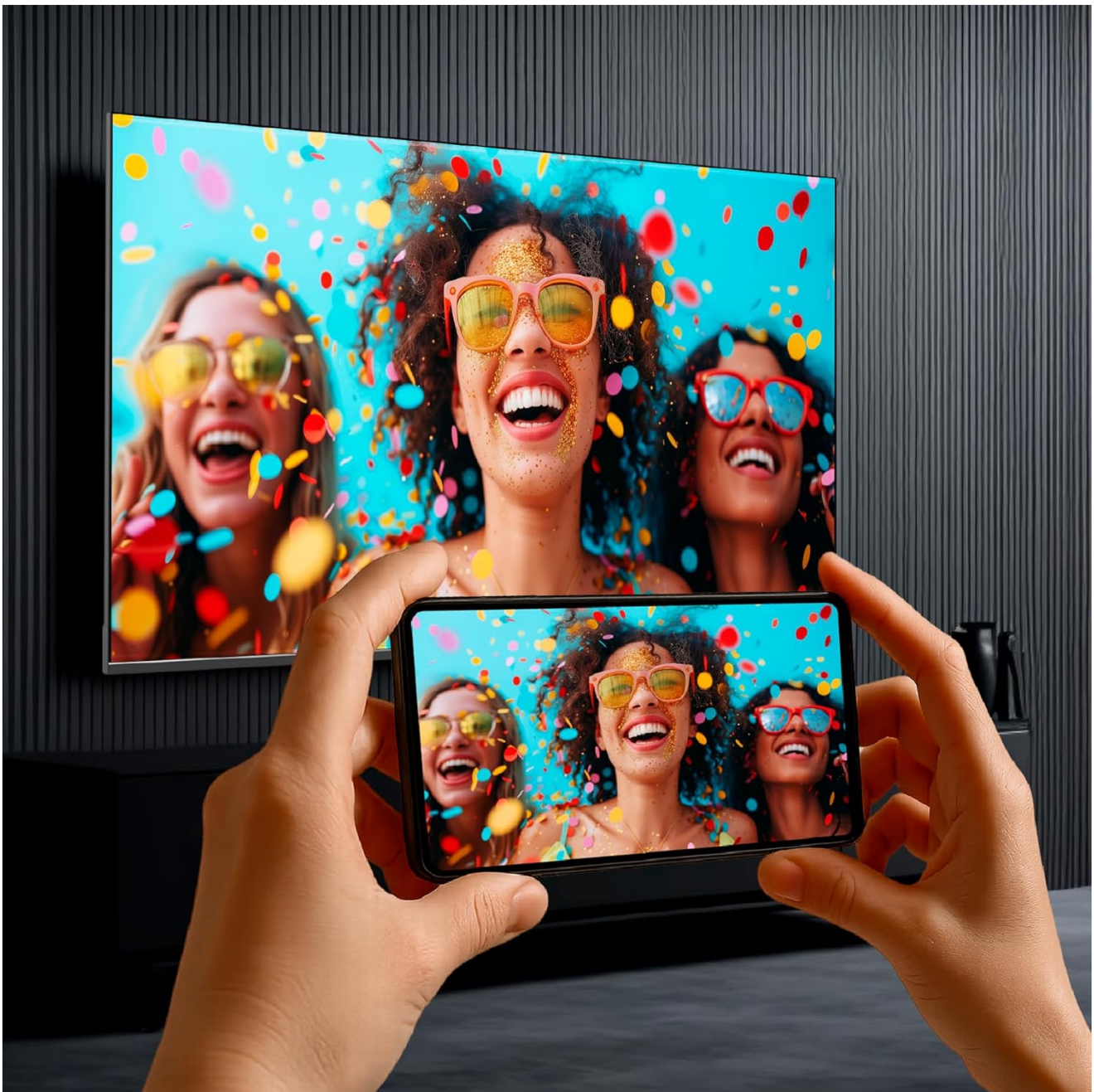
Figure 6: Example of screen mirroring from a smartphone to the television.