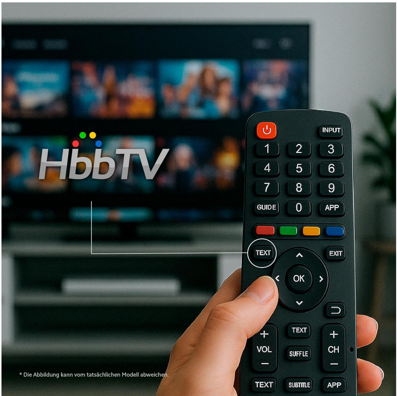
Figure 3: Using the remote control to interact with HbbTV content.