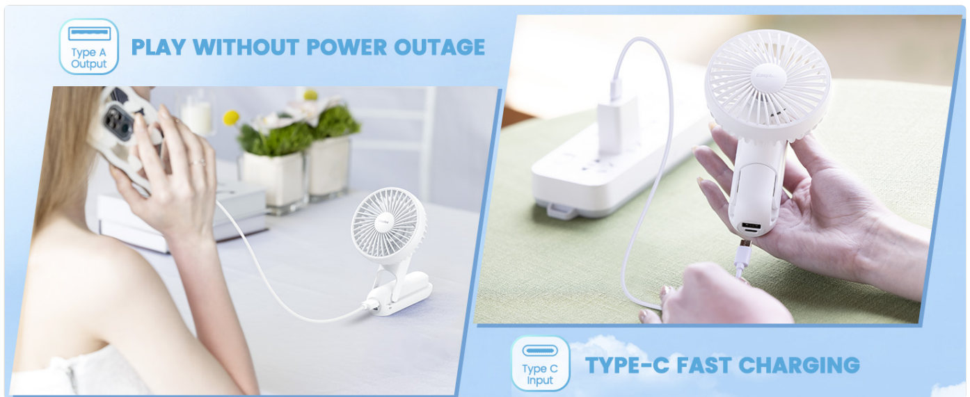
Figure 4.1: The fan's control panel, illustrating the LED display for speed and battery, along with the USB-C input and USB-A output ports.