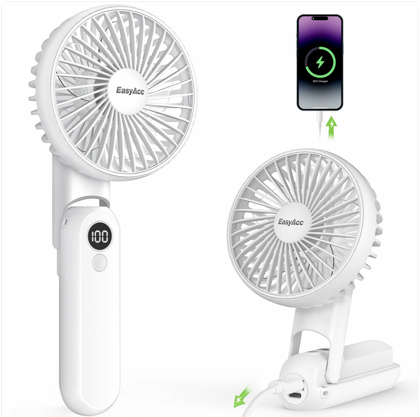
Figure 3.1: The EasyAcc F18 fan, highlighting its USB-C charging capability.