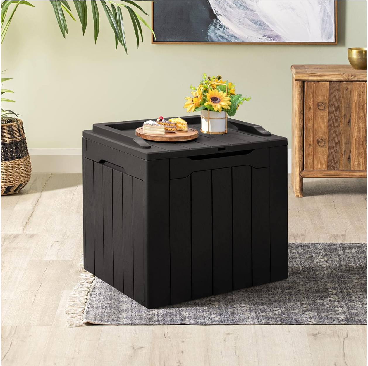
Figure 3: The deck box serving as a functional table in an indoor setting.

The sturdy construction of the Homall 31 Gallon Resin Deck Box allows it to be used as a temporary seating option or a small outdoor table. When using as seating, ensure the lid is fully closed and locked if desired. The maximum weight capacity for seating is 210 pounds. Avoid placing excessively heavy or sharp objects on the lid when using it as a table.