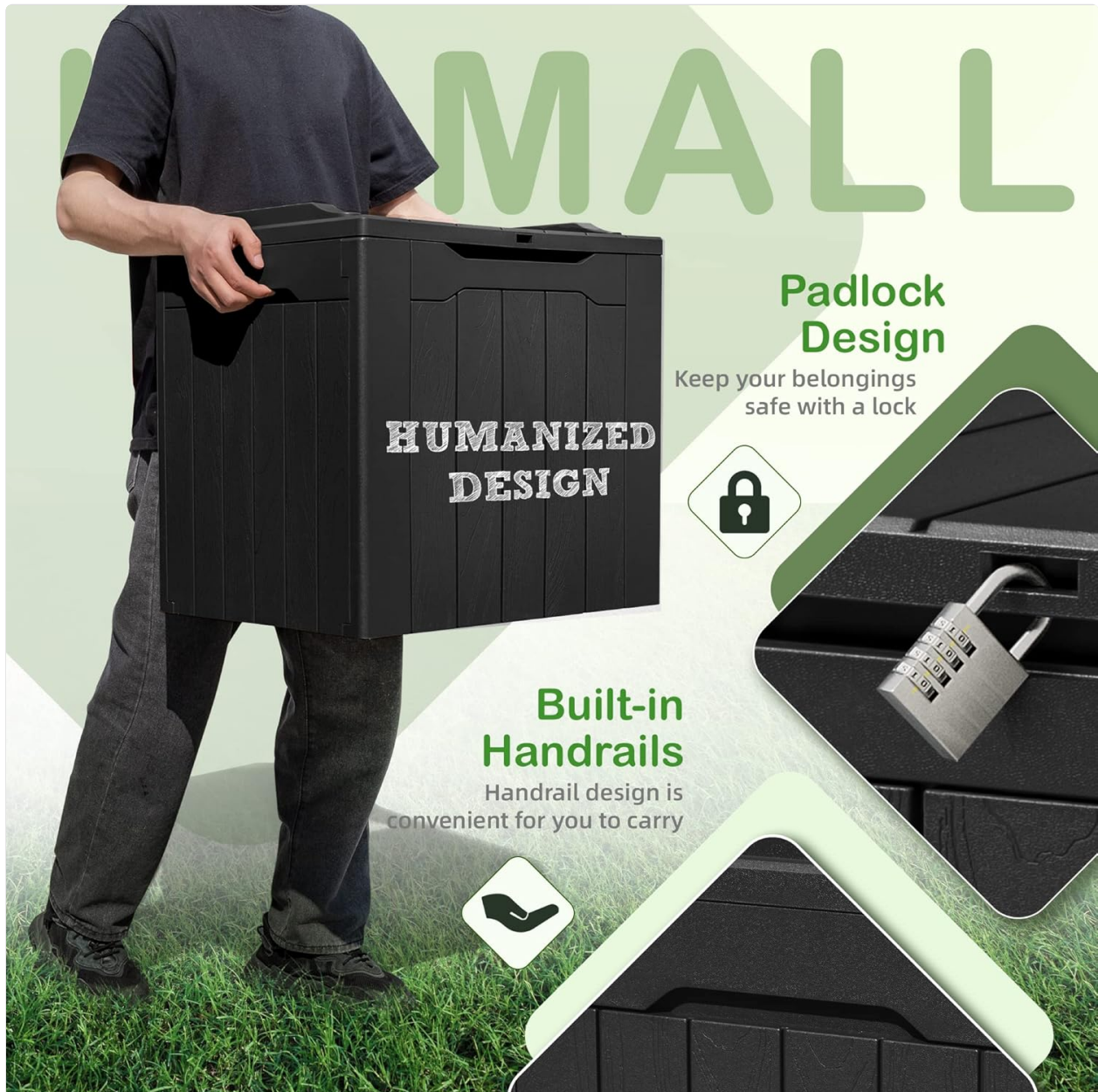
Figure 2: The deck box highlighting its humanized design with built-in handrails and a padlock feature for security.

Assembly typically takes approximately 10 minutes for one person. For detailed visual instructions, please refer to the official installation manual available as a PDF document.