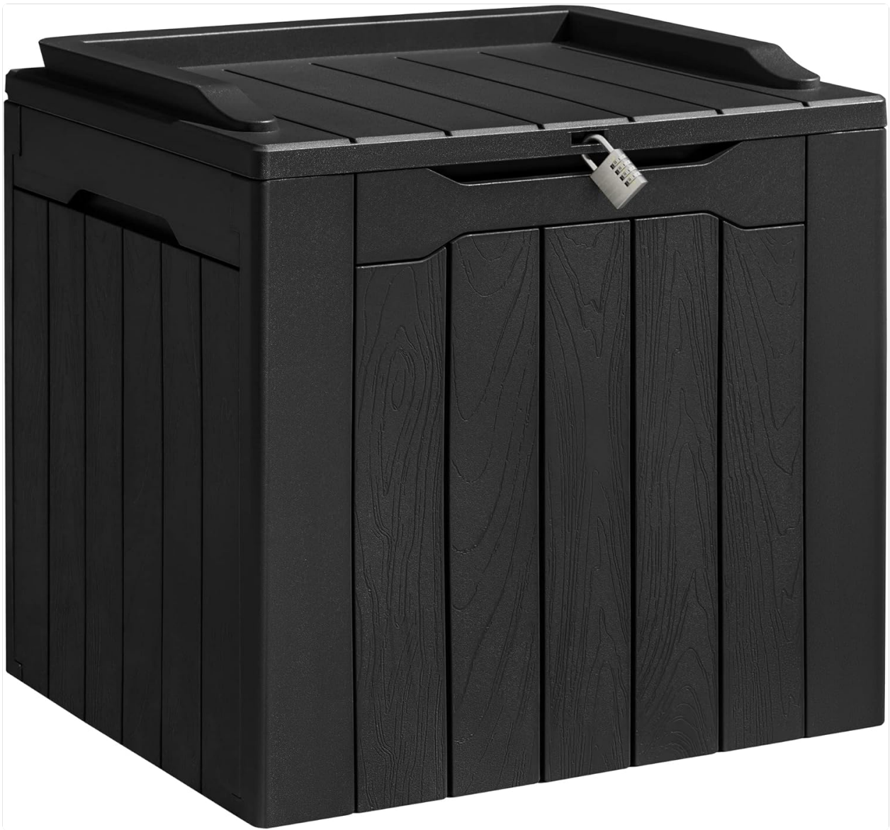
Figure 1: The Homall 31 Gallon Resin Deck Box, showcasing its compact and functional design.