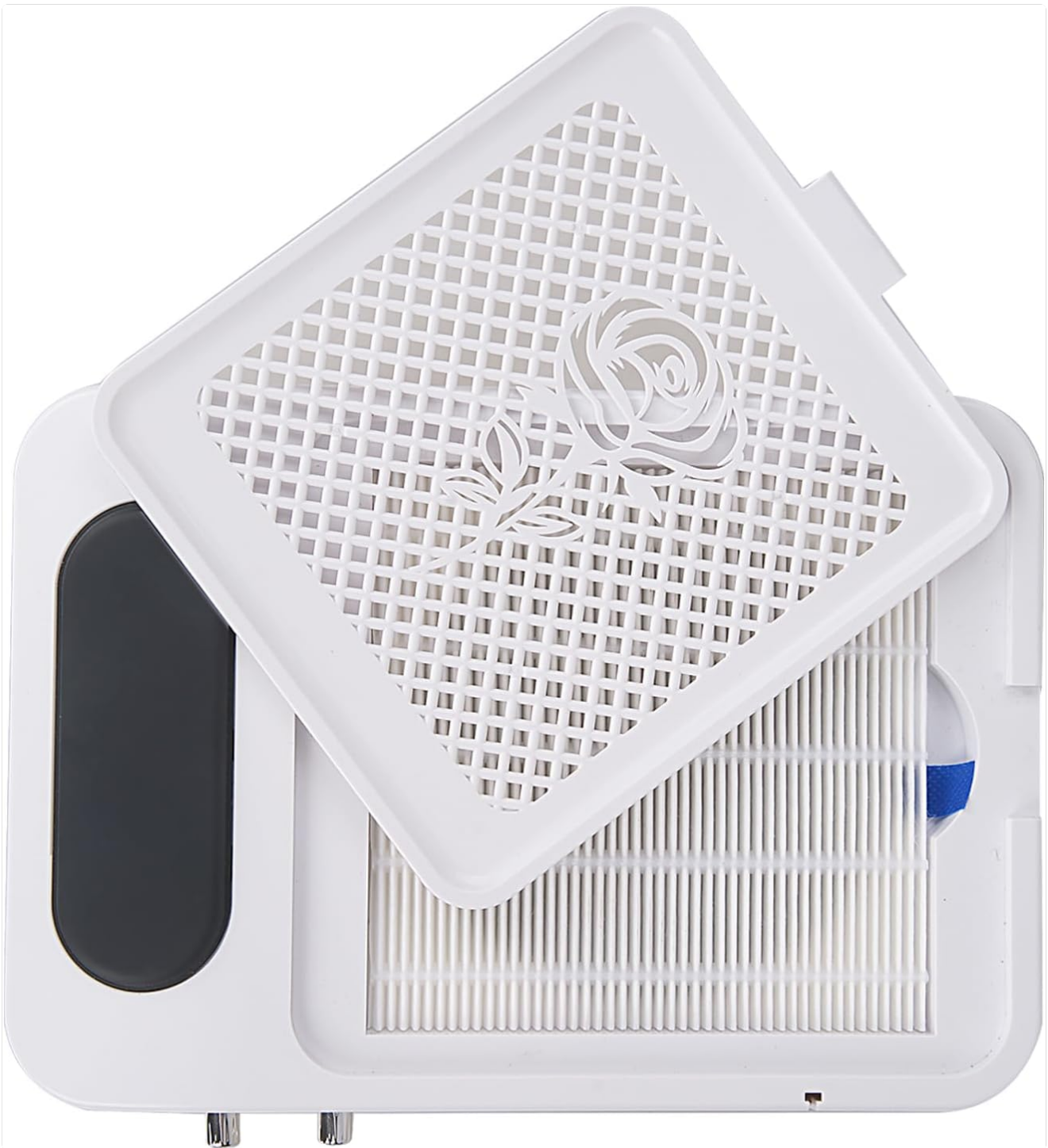
Figure 6: The dust filter being removed from the main unit for cleaning, showing the separate design for easy maintenance.