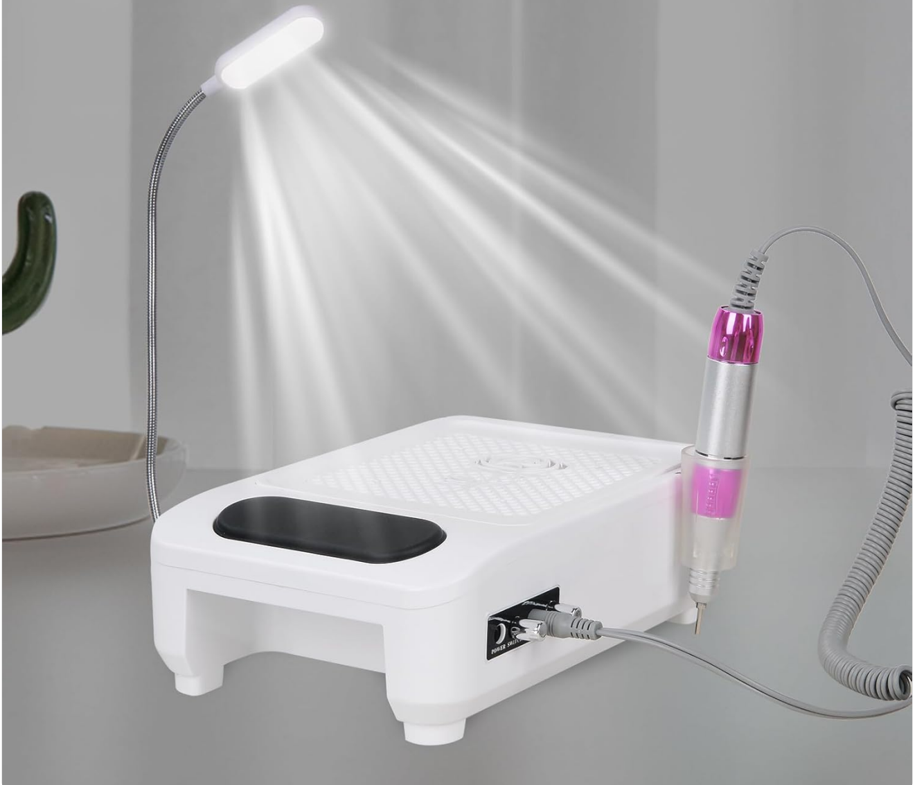
Figure 4: The device with its flexible illuminating lamp providing bright light for detailed nail work.

Pour vous aider à voir clairement vos ongles et accélérer le processus