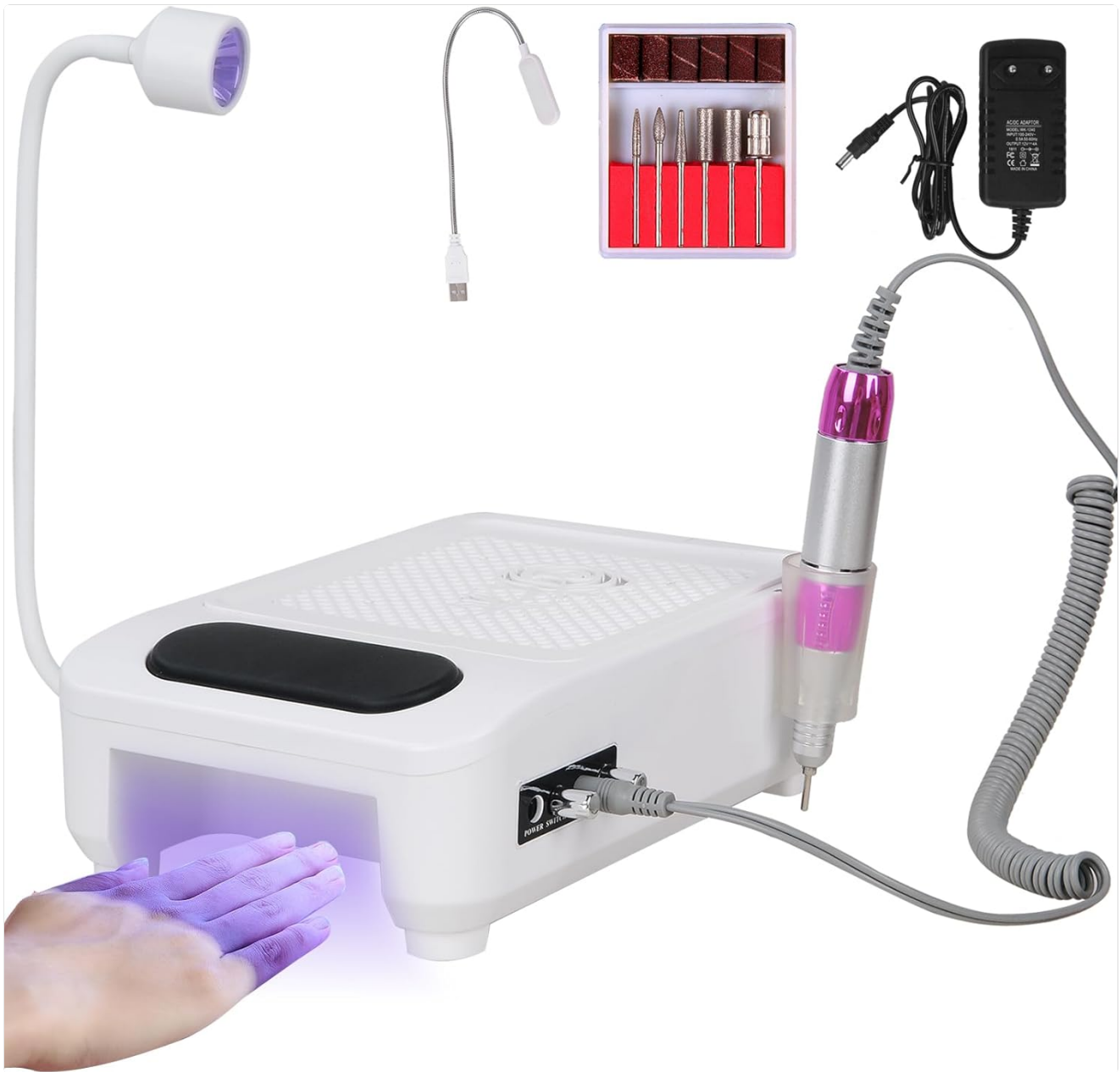
Figure 1: The Tafoyu 5-in-1 Professional Nail Vacuum Cleaner, showcasing the main unit, nail drill, USB lamp, power adapter, and various grinding heads.