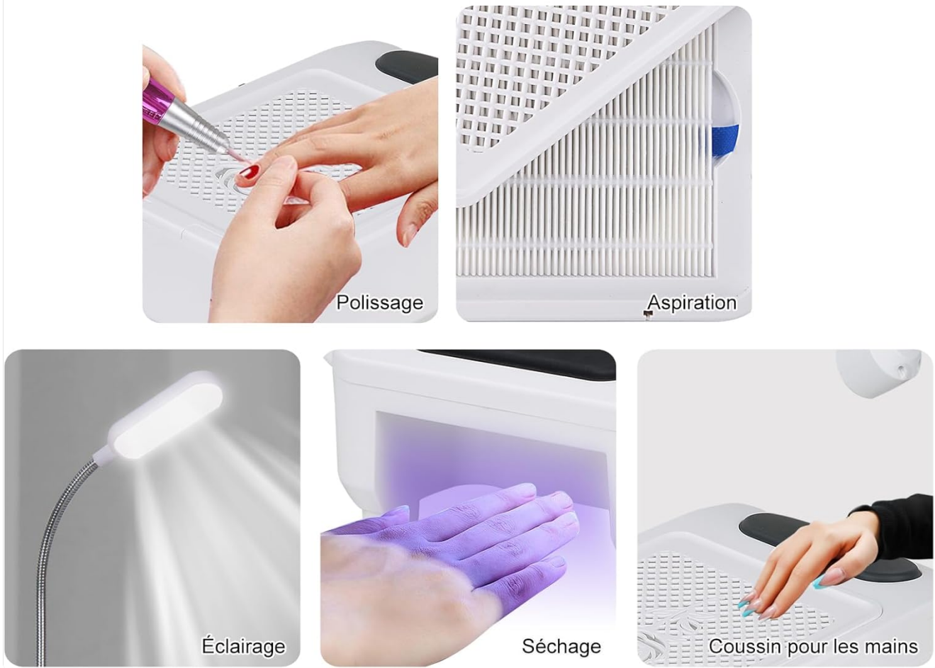
Figure 5: Visual representation of the five integrated functions: polishing with the drill, dust suction, adjustable lighting, UV drying, and a comfortable hand rest.