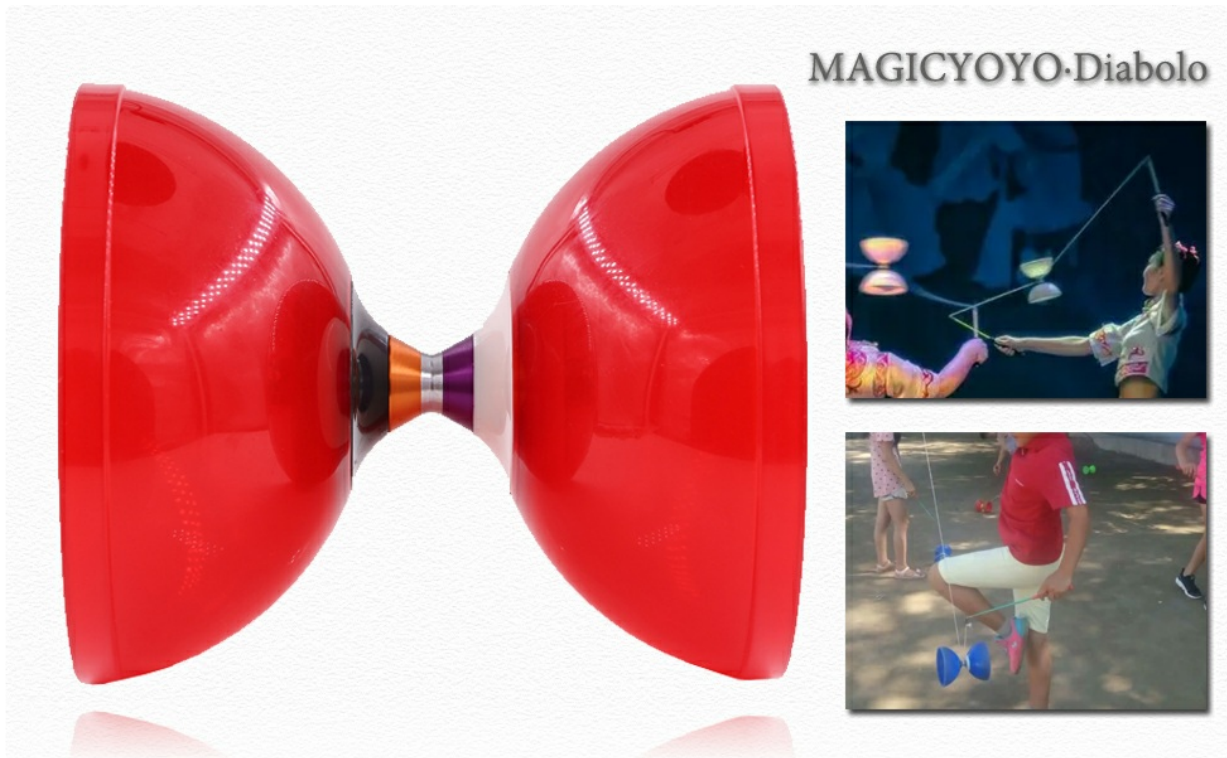
Image: Examples of diabolo use in different settings, from casual play to performance.