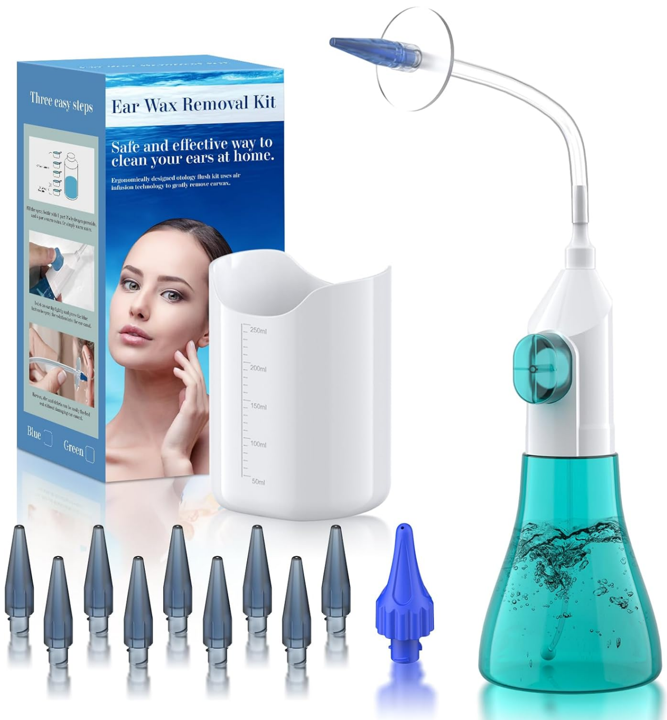
Figure 1: All components included in the WEUANY Ear Wax Removal Kit.