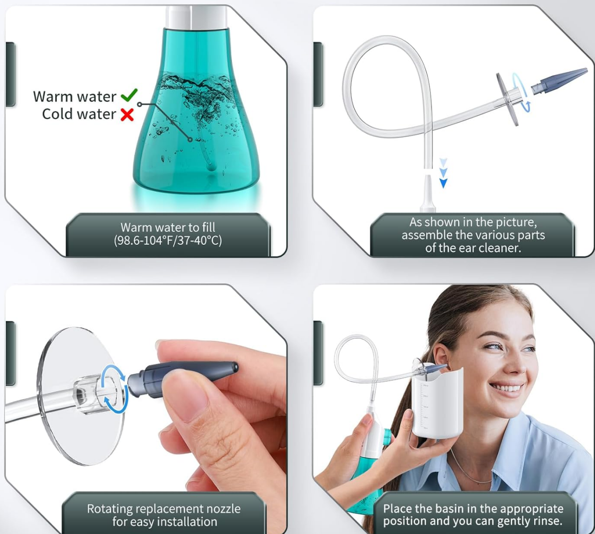
Figure 2: Assembly steps for the ear cleaning system.