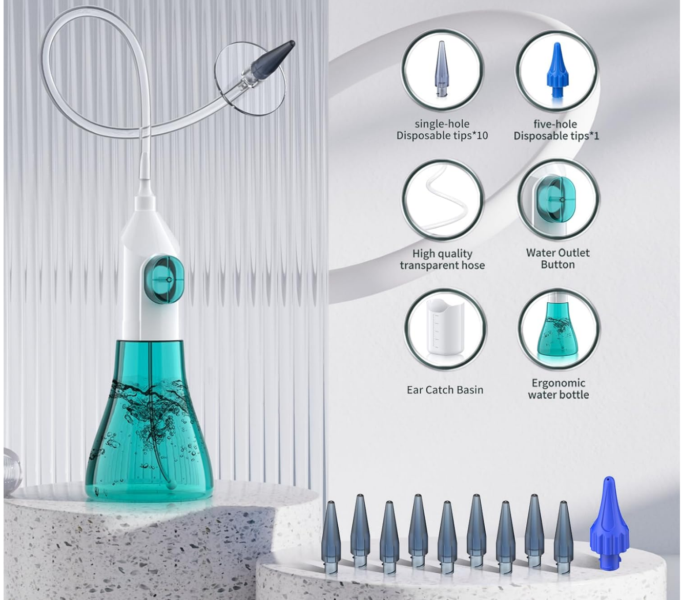
Figure 5: The complete ear wax removal kit, ready for use or storage.