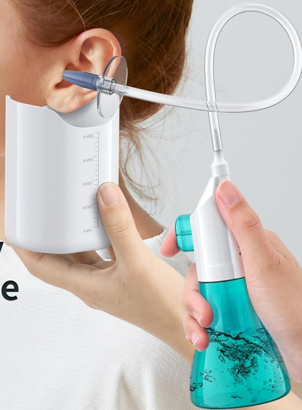
Figure 3: Proper positioning for ear irrigation using the catch basin.

This Ear Irrigation Kit removes earwax quickly, effectively and safely at home.