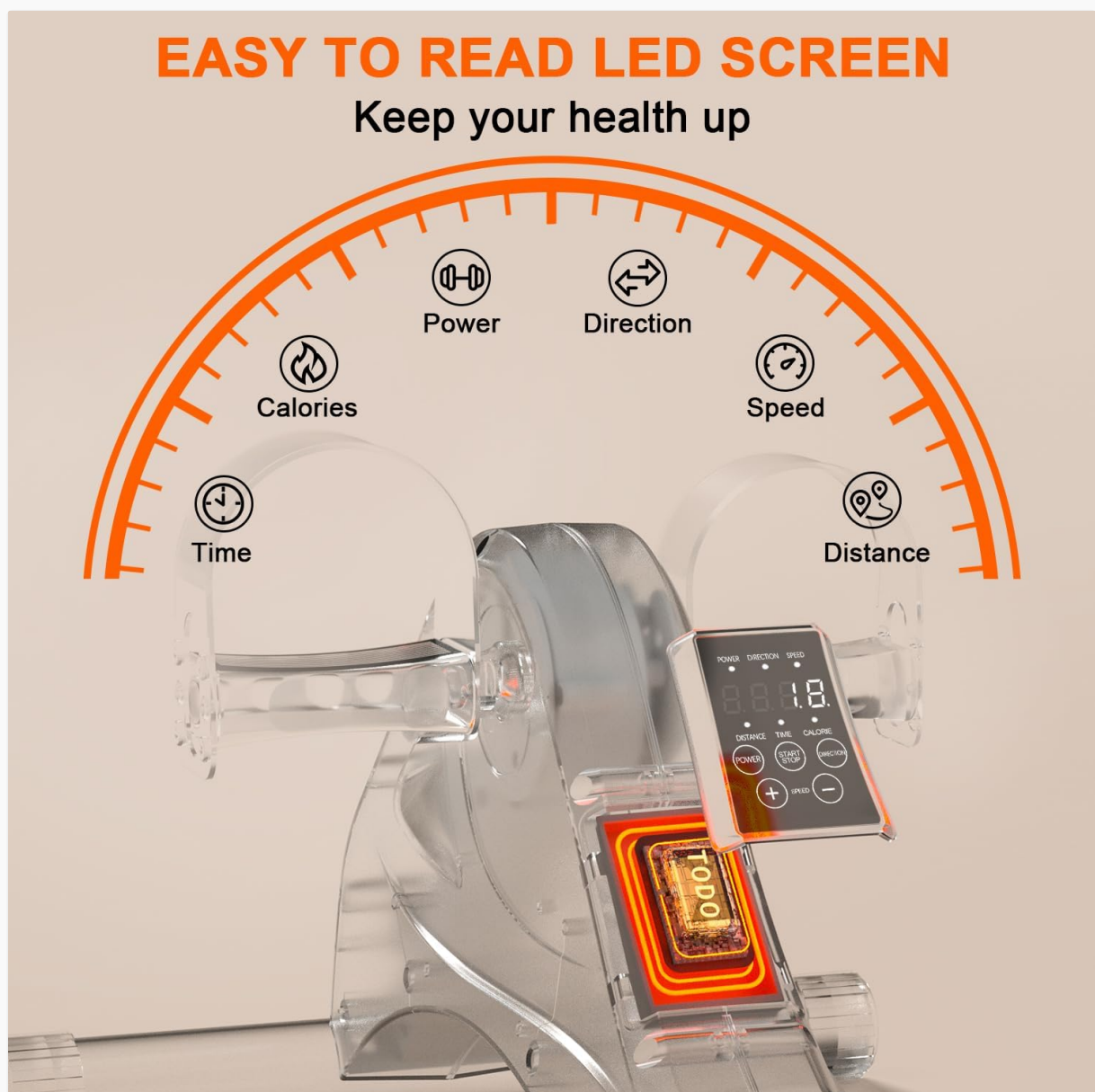
The easy-to-read LCD screen provides real-time workout data.