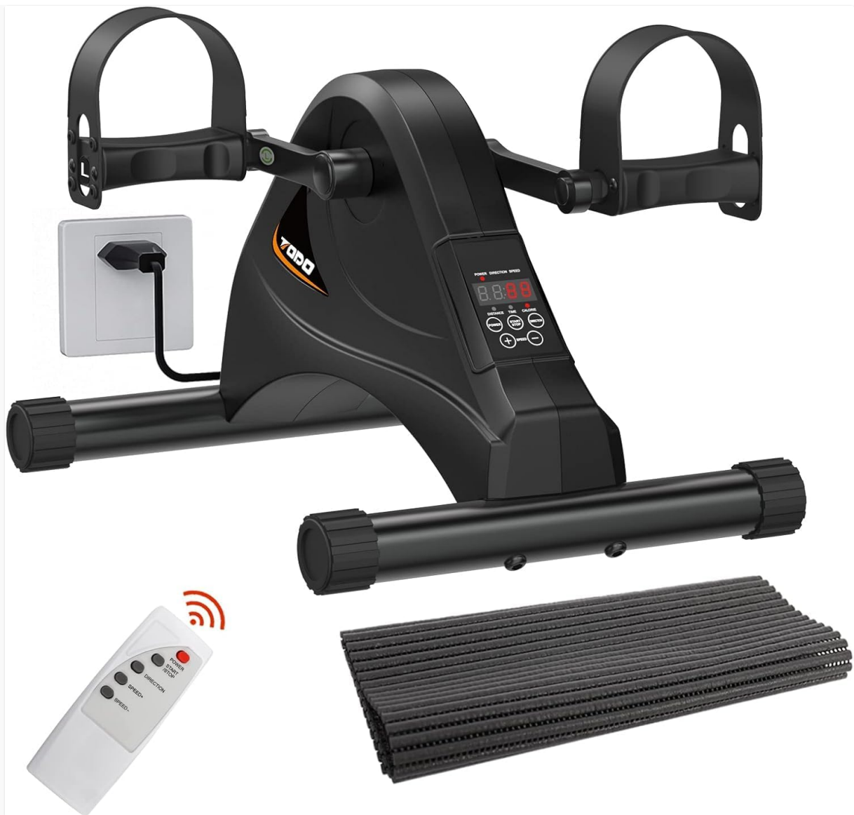
All components included in the package.