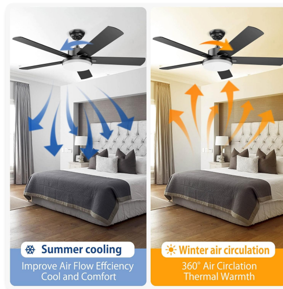
Figure 7: Visual representation of summer cooling and winter air circulation.