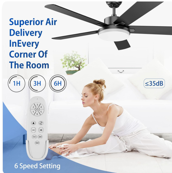
Figure 5: Fan operating with remote, highlighting 6 speed and 3 timer settings.