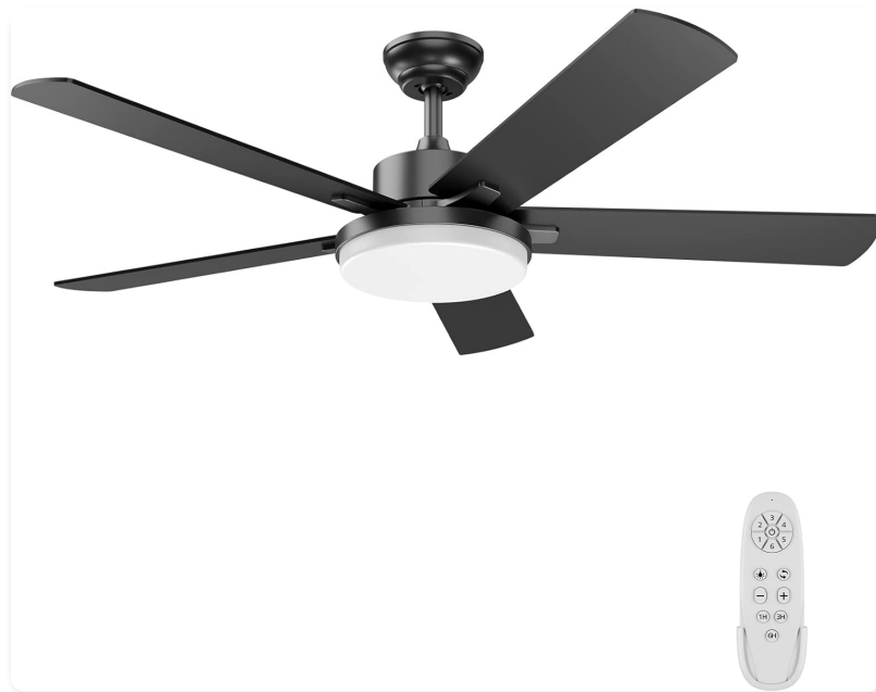
Figure 1: Regair 52-Inch Ceiling Fan with included remote control.

Thank you for choosing the Regair 52-Inch Ceiling Fan. This modern black ceiling fan is designed to provide optimal air circulation and versatile lighting for various indoor spaces, including living rooms, bedrooms, kitchens, dining rooms, and home offices. Featuring a quiet DC motor, dimmable LED light with adjustable color temperatures, and convenient remote control, this fan combines practicality with a sleek, decorative design.