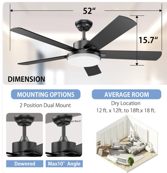
Figure 2: Fan dimensions and dual mounting options (Downrod, Max 10° Angle).