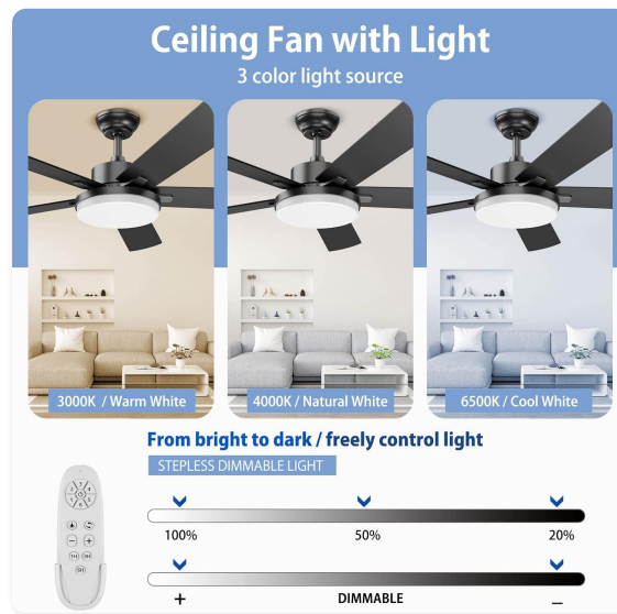
Figure 6: Dimmable light with 3 color temperature options (3000K, 4000K, 6500K).