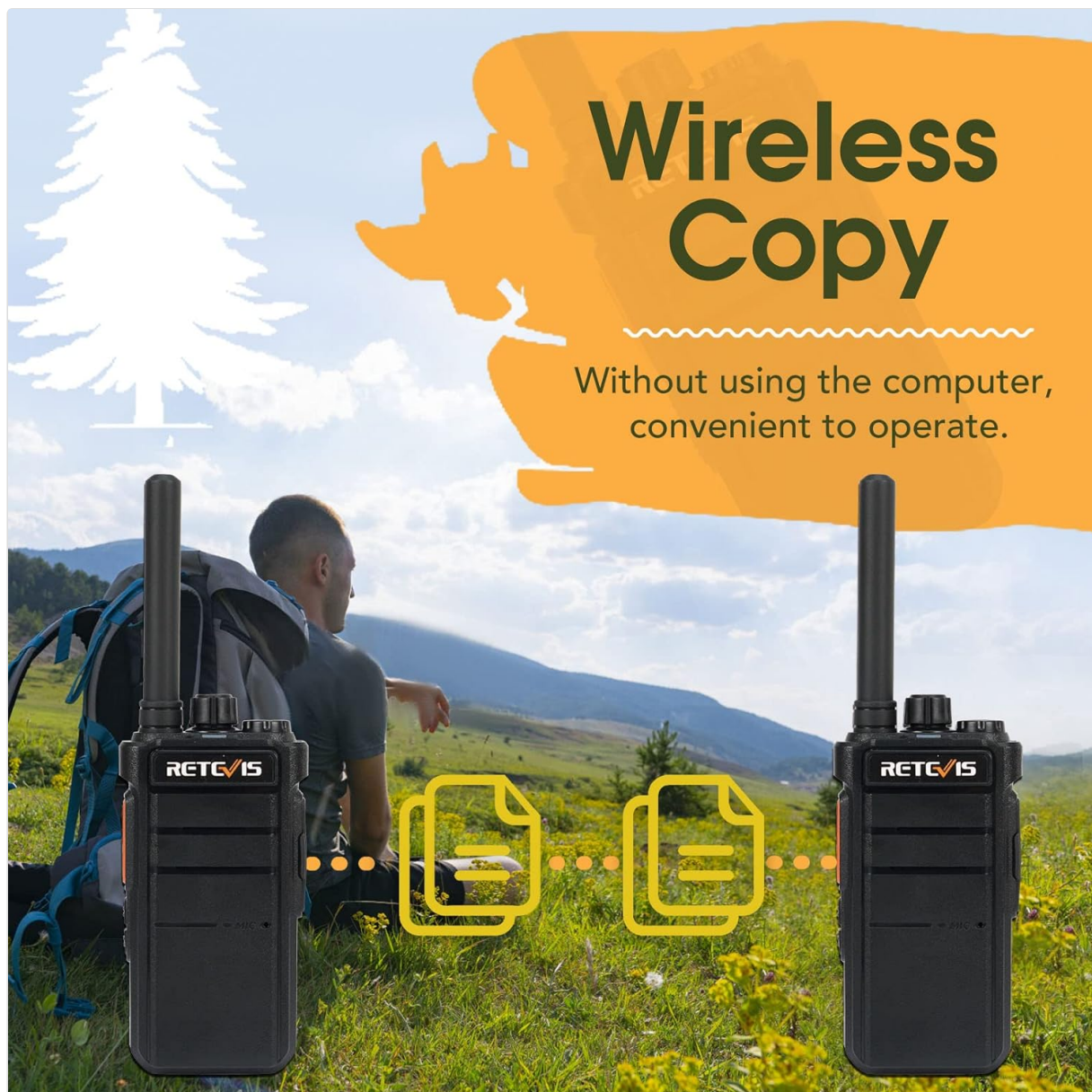
Figure 6.1: Long-distance communication with Retevis RB626 radios.