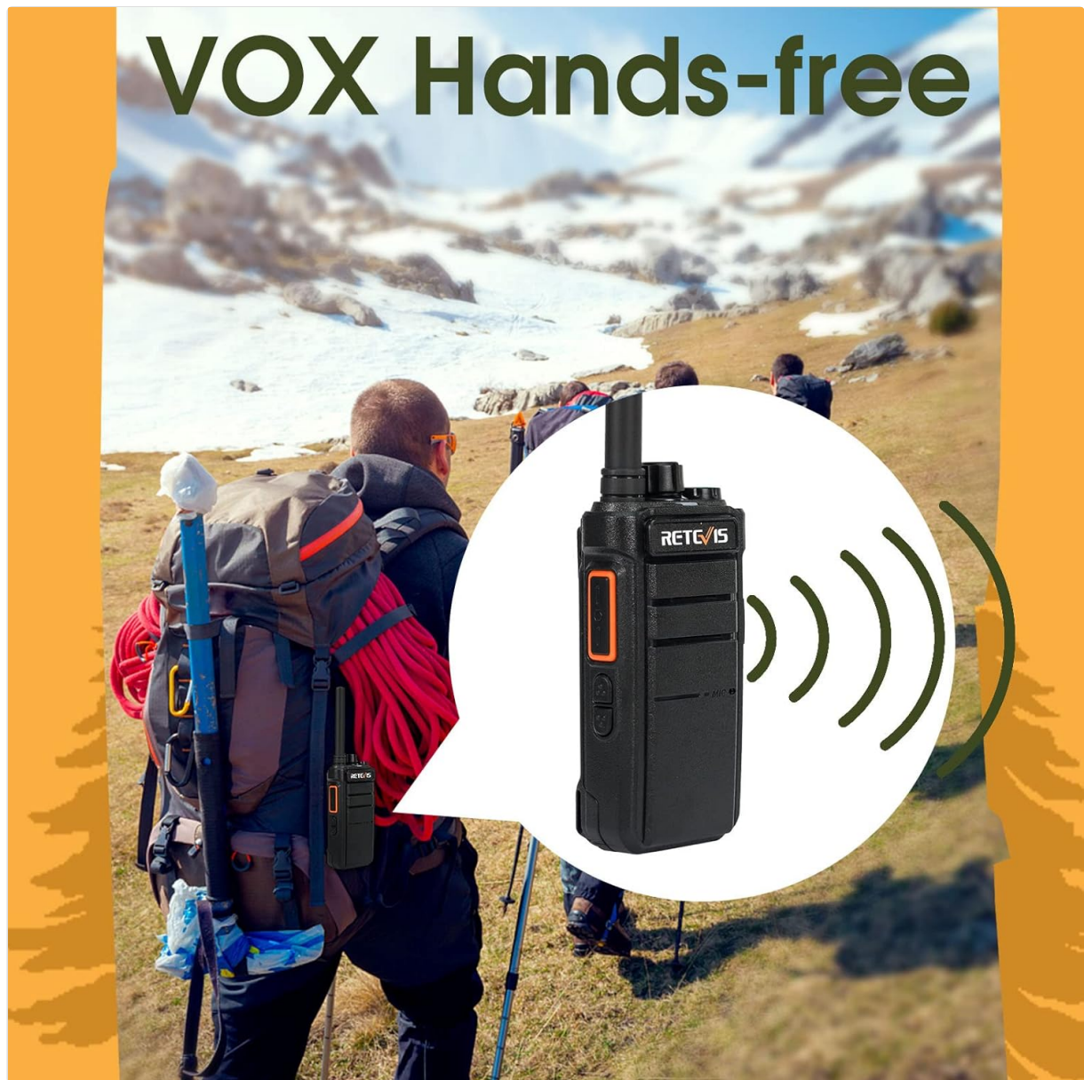
Figure 6.2: Using the VOX hands-free function during outdoor activities.