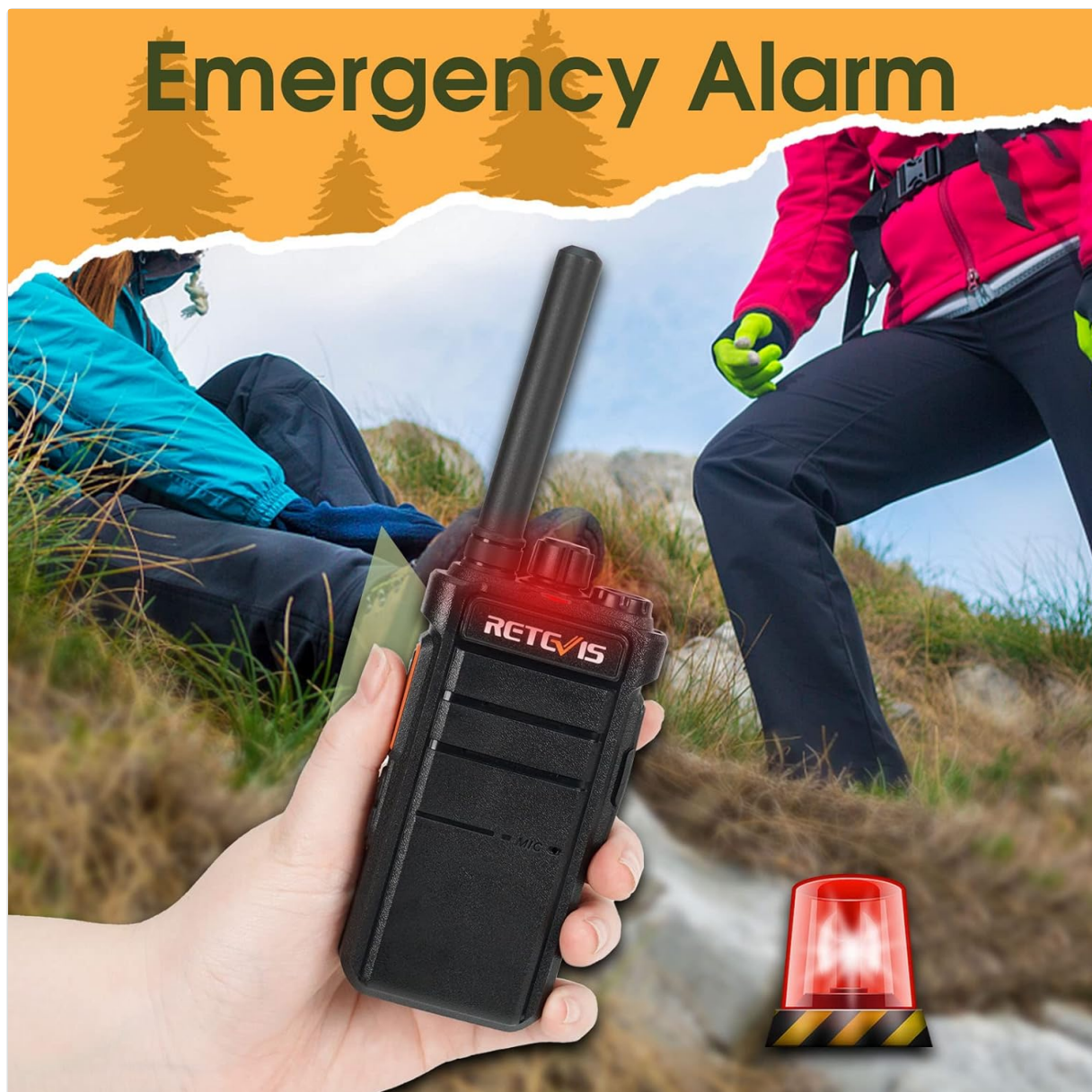
Figure 6.3: Activating the emergency alarm on the Retevis RB626.