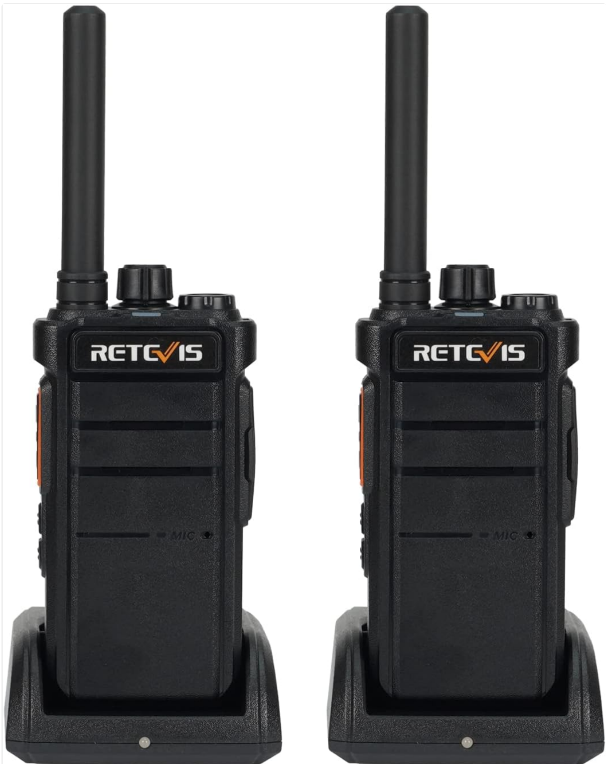
Figure 4.1: Front view of the Retevis RB626 radios in charging bases.