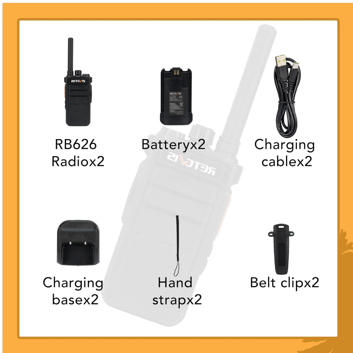
Figure 3.1: Included accessories with the Retevis RB626 Two-Way Radio.