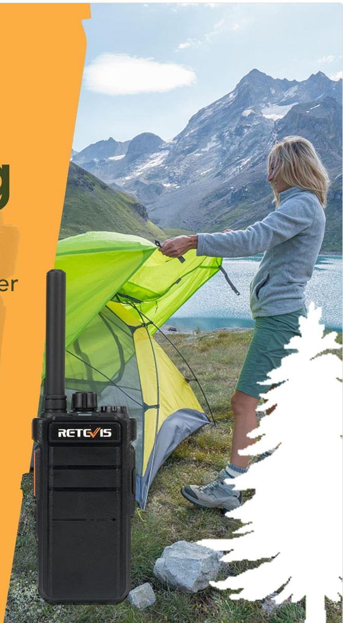
Figure 5.2: USB-C charging options for the Retevis RB626.