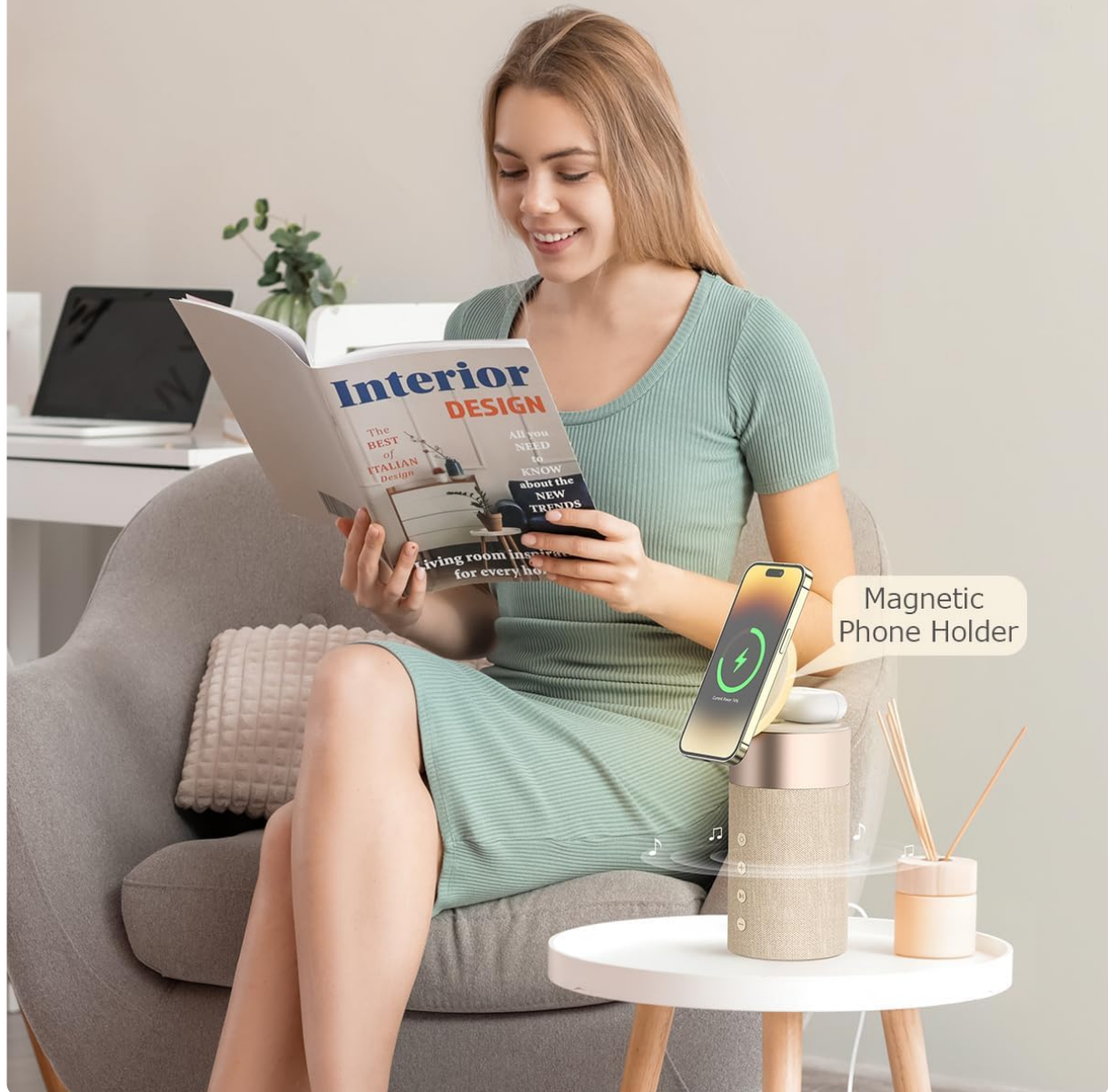
Figure 2: The COLSUR S02 in use, demonstrating magnetic phone charging and speaker functionality.