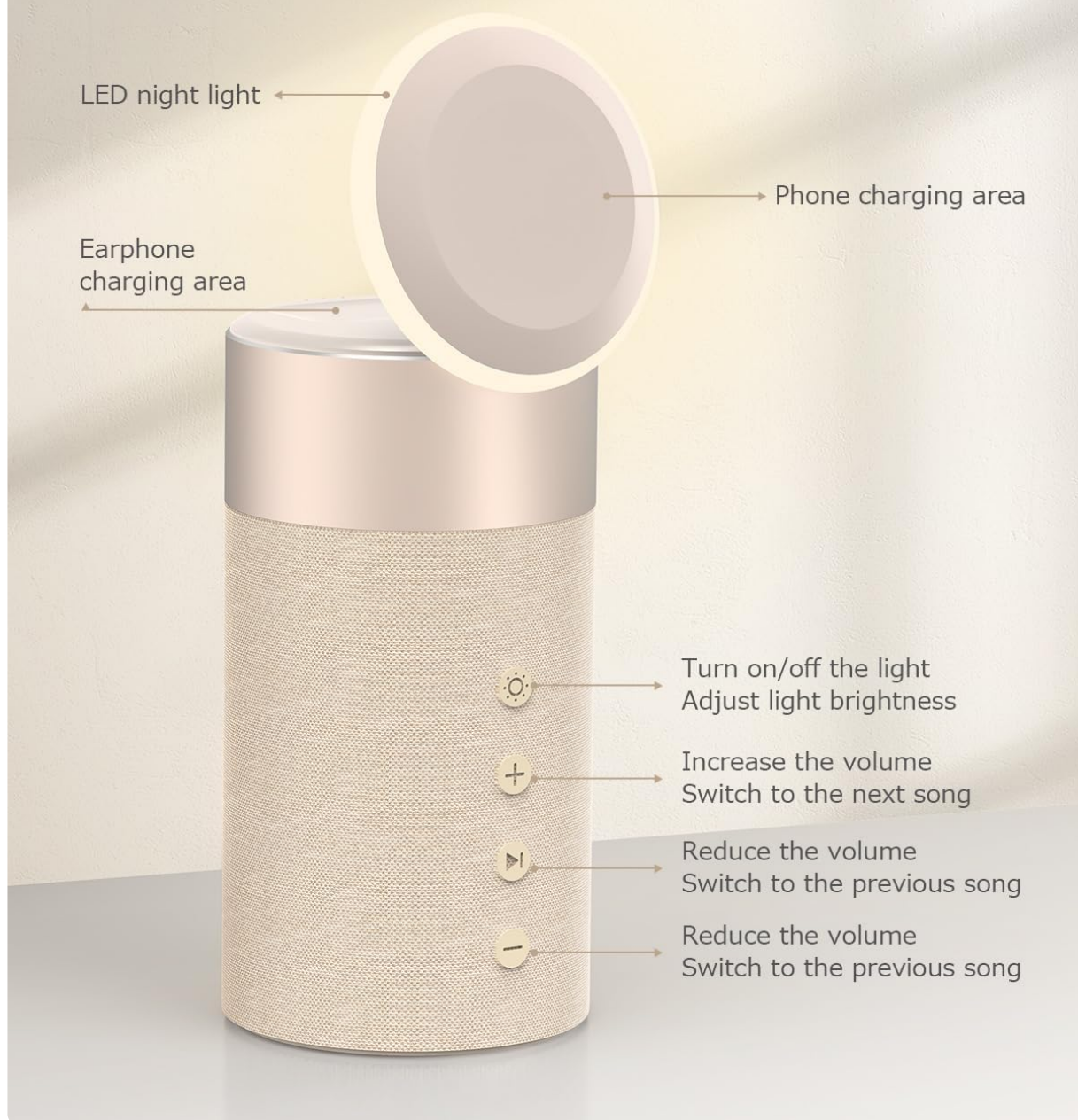
Figure 5: The charging pad is 360° adjustable for flexible viewing angles.