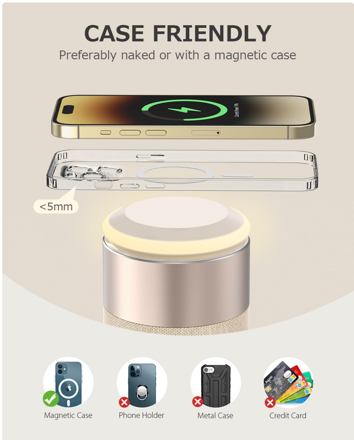
Figure 6: Illustration of case compatibility for magnetic charging.

Note: For magnetic wireless charging, a caseless iPhone or a MagSafe compatible case is required for a secure magnetic lock. Cases thicker than 5mm or non-magnetic cases may hinder charging efficiency.