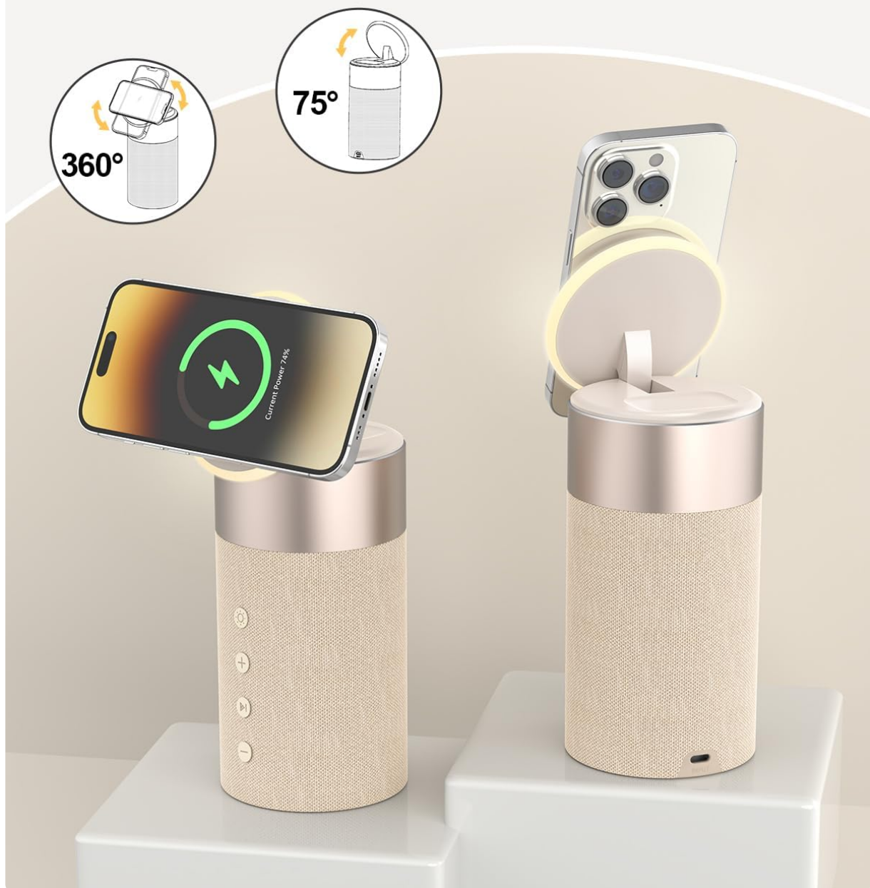
Figure 3: Overview of the COLSUR S02 speaker with button functions labeled.