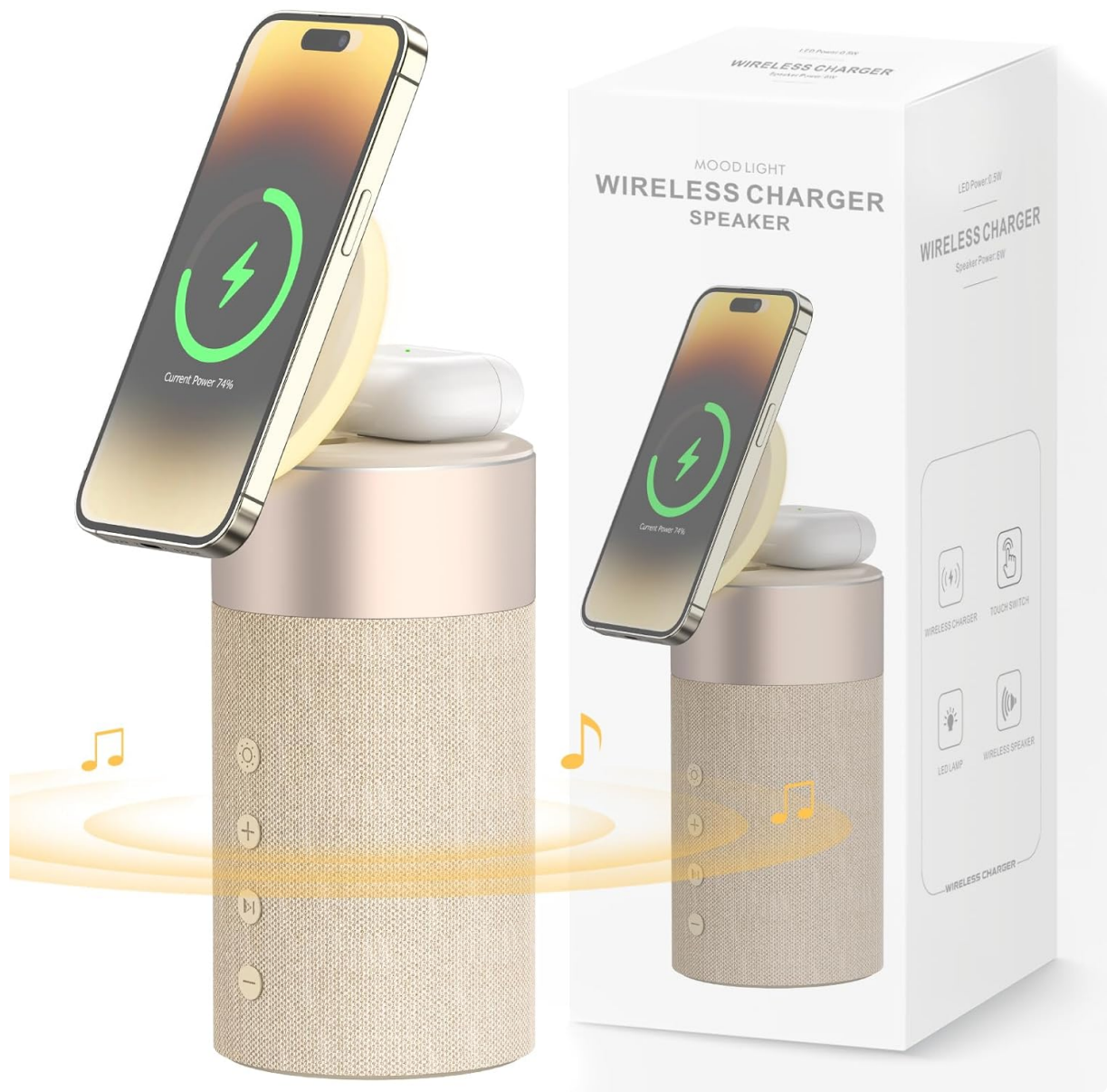
Figure 1: COLSUR S02 Bluetooth Speaker and Magnetic Wireless Charger.