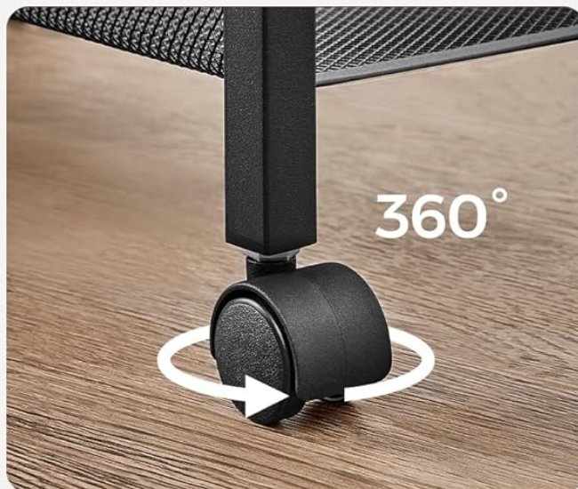
Roulette pivotante à 360°