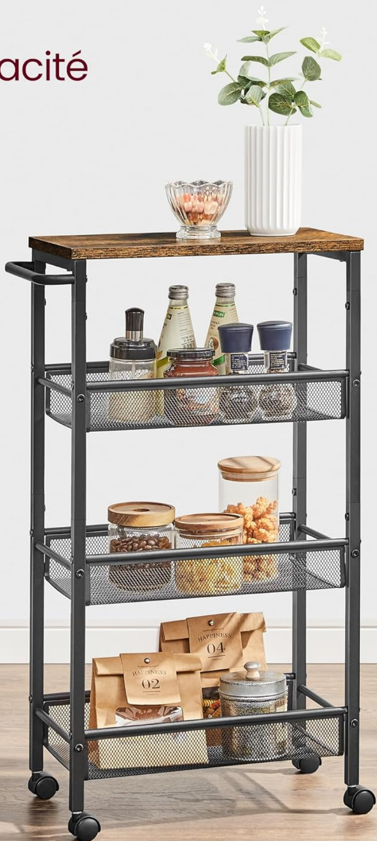
Figure 5: Visual representation of the cart's large capacity across its four levels, suitable for various items.