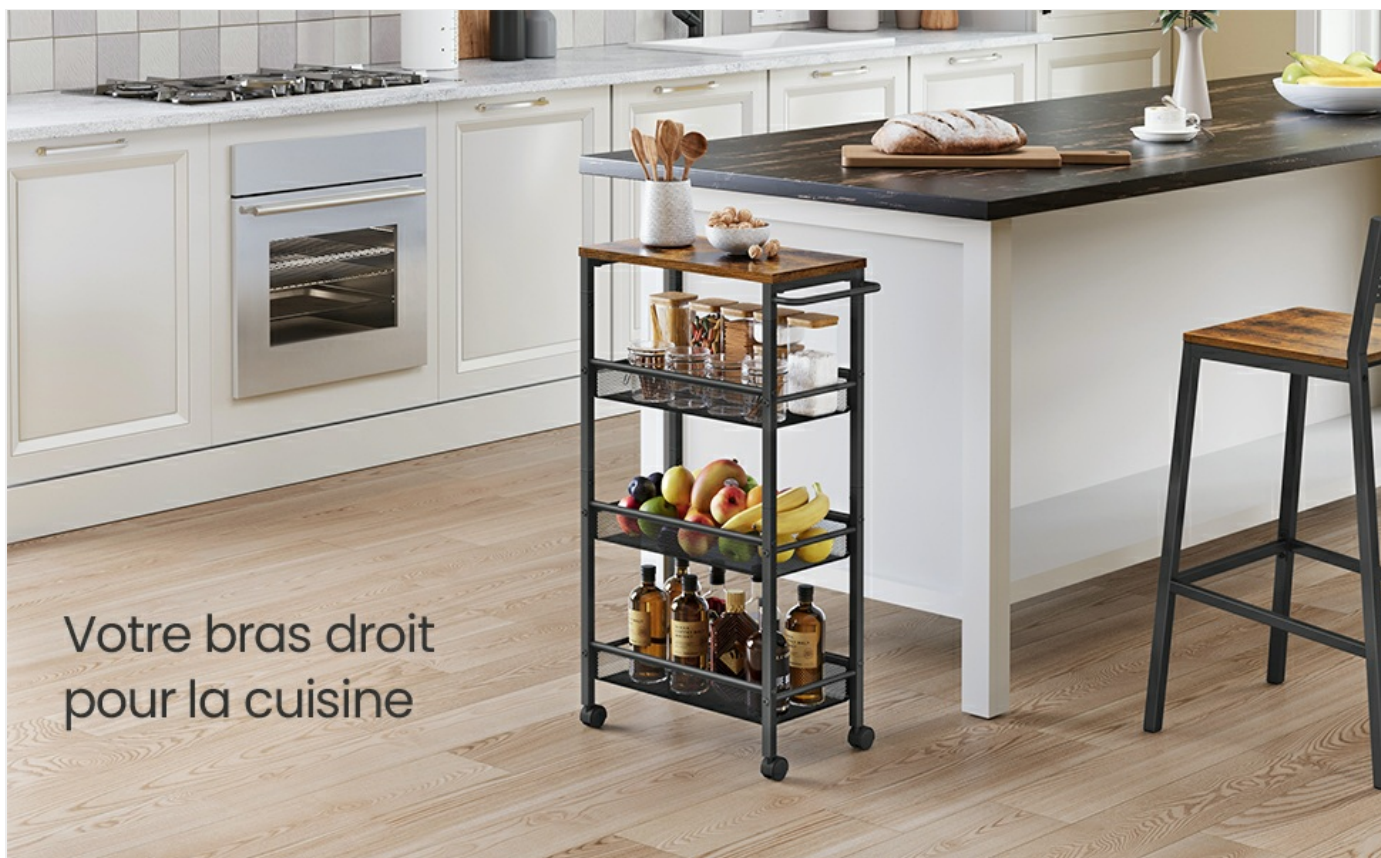
Figure 7: The cart serving as a convenient mobile storage unit in a kitchen environment.