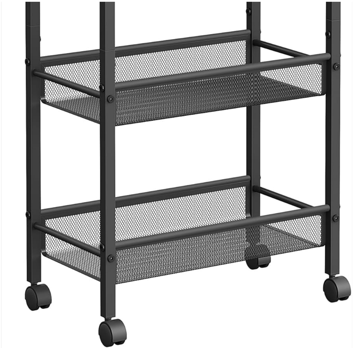
Figure 1: VASAGLE 4-Tier Slim Kitchen Cart (Rustic Brown and Black)