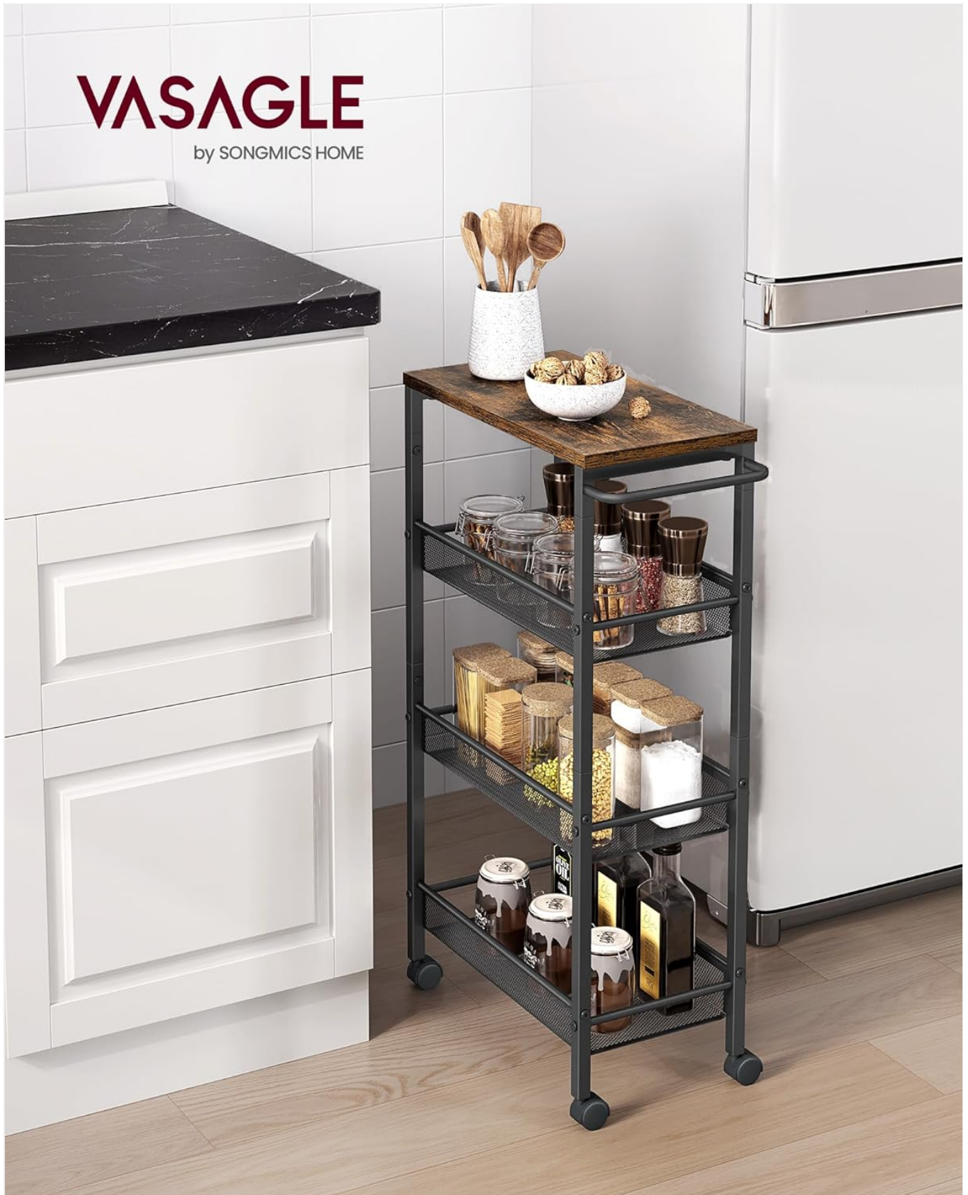
Figure 4: The cart positioned in a kitchen, demonstrating its utility for storing various kitchen items.