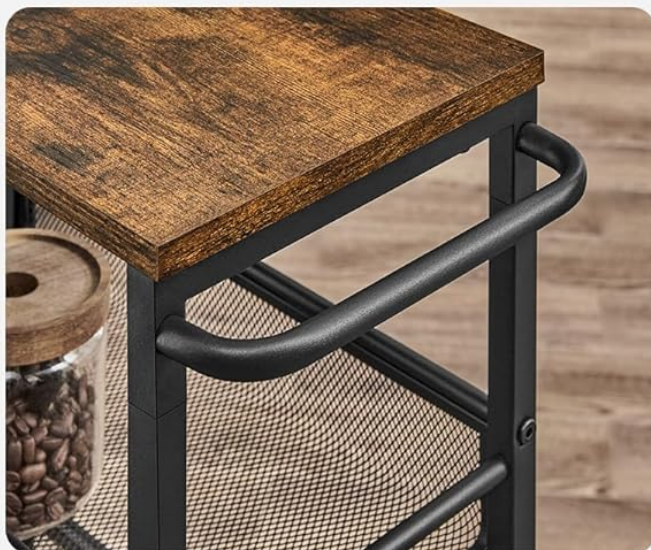
Poignée métallique robuste