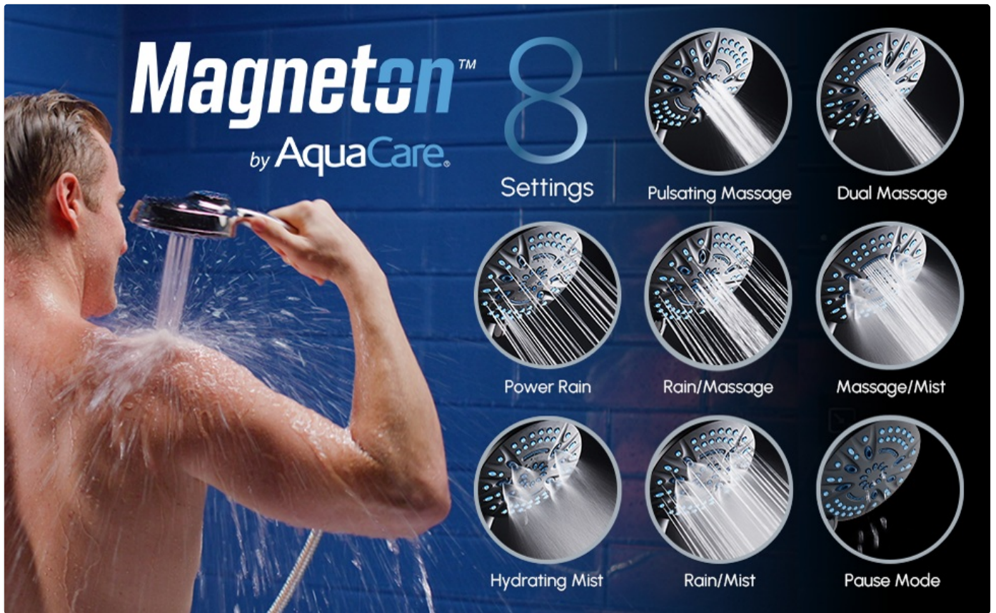
Figure 5: The 8 luxury flow settings provide a customizable showering experience.