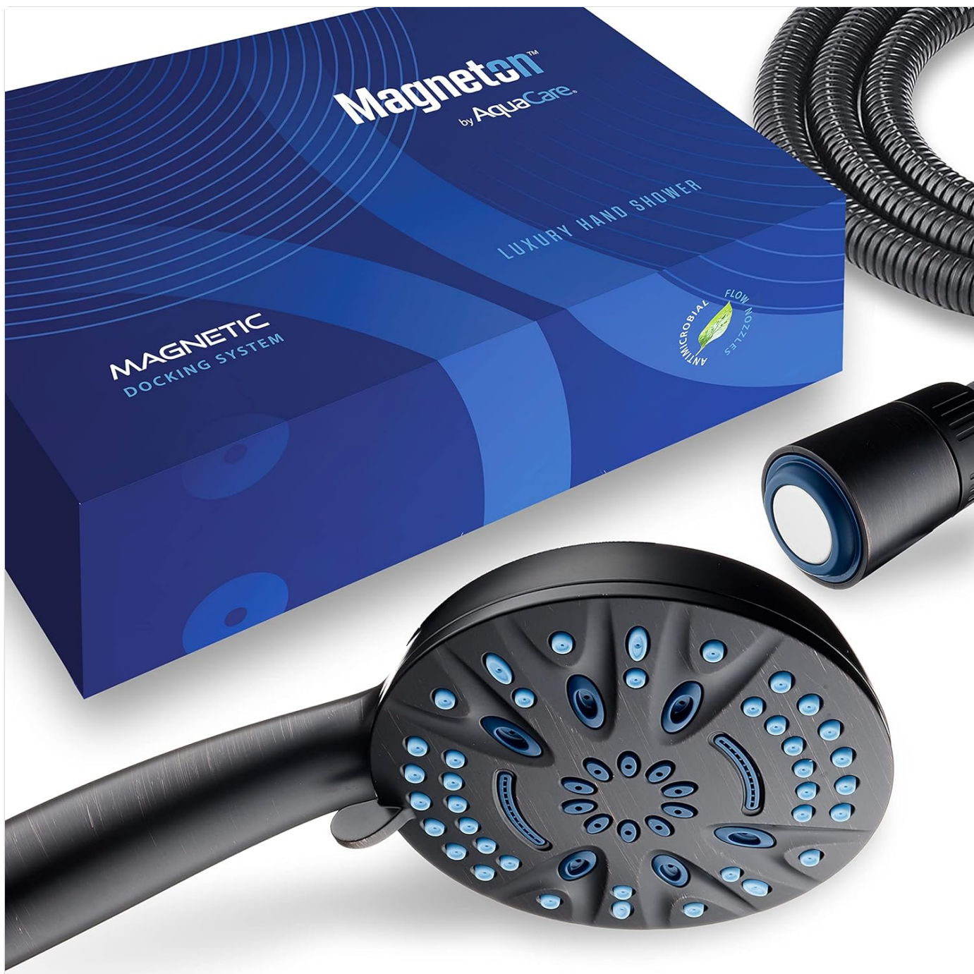
Figure 1: All components included in the AquaCare Magneton package.