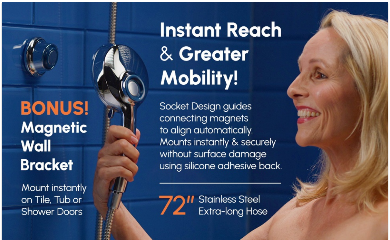
Figure 3: The magnetic wall bracket provides instant reach and greater mobility with the 72-inch stainless steel hose.