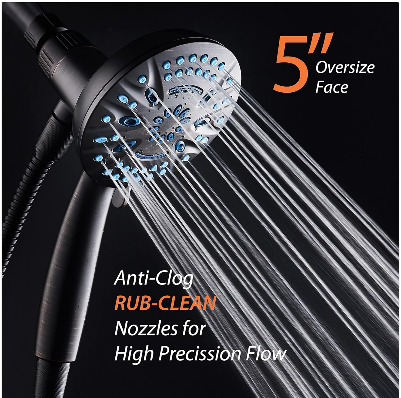
Figure 6: The 5-inch oversized face provides wide coverage and features anti-clog nozzles.