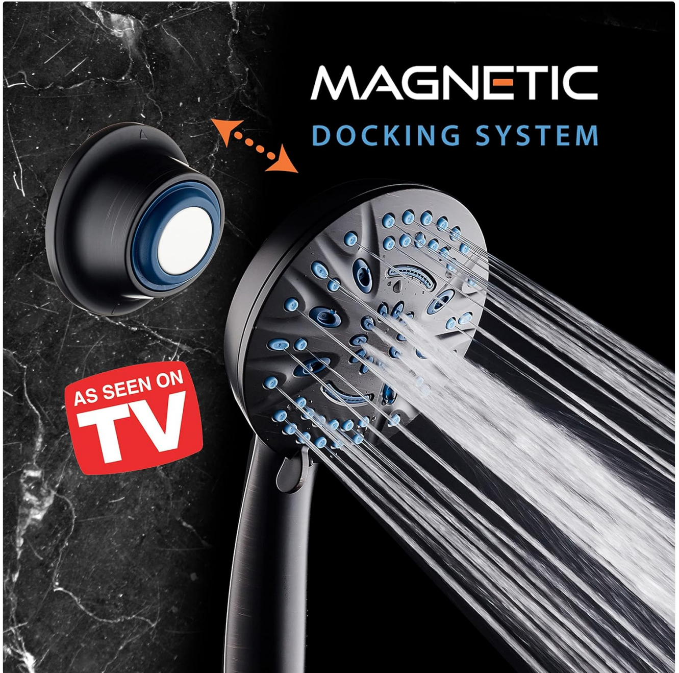
Figure 2: The magnetic docking system allows for easy and secure attachment of the handheld shower head.