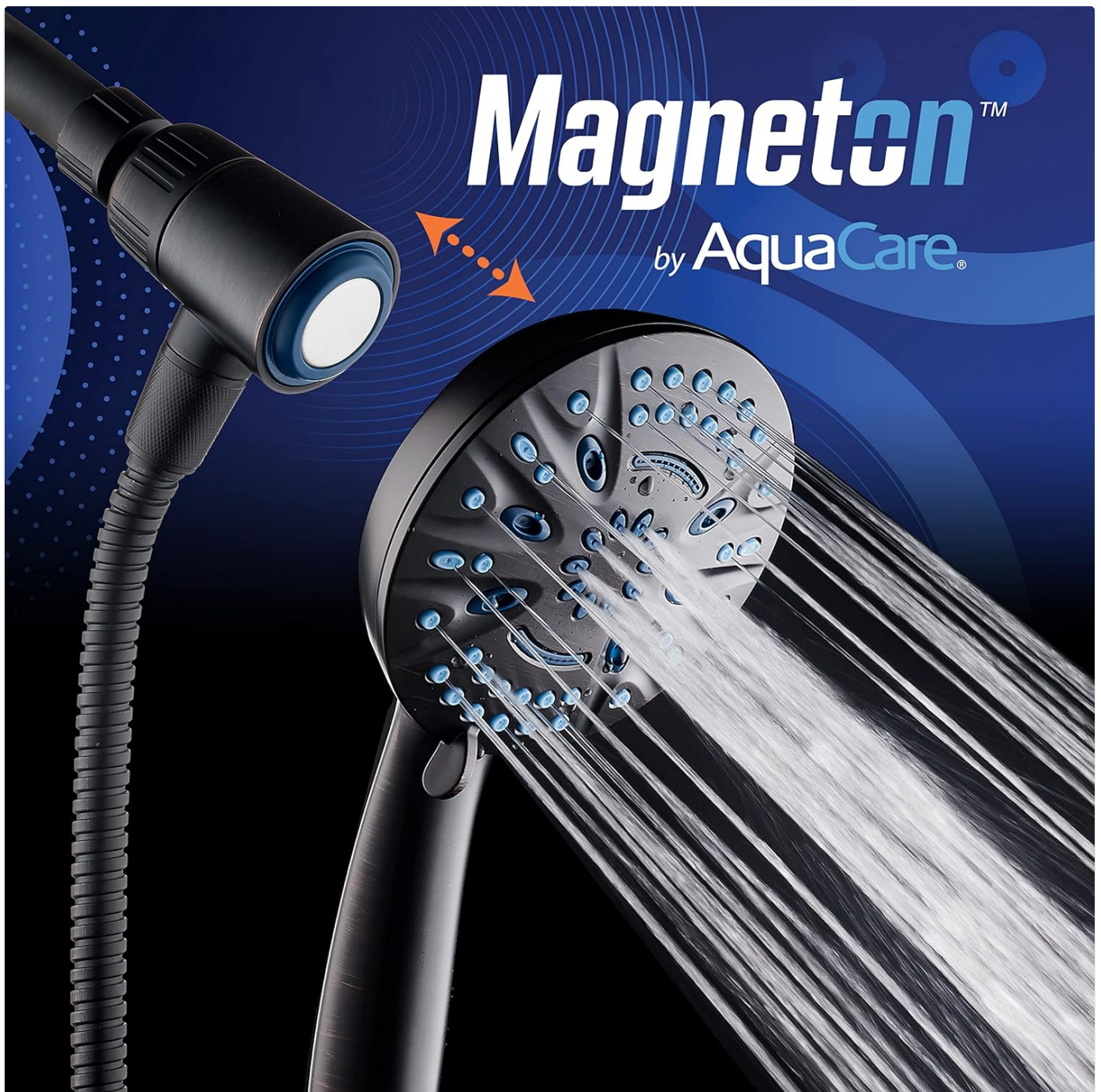
Figure 4: The Magnetan magnetic docking system ensures precise and secure attachment.