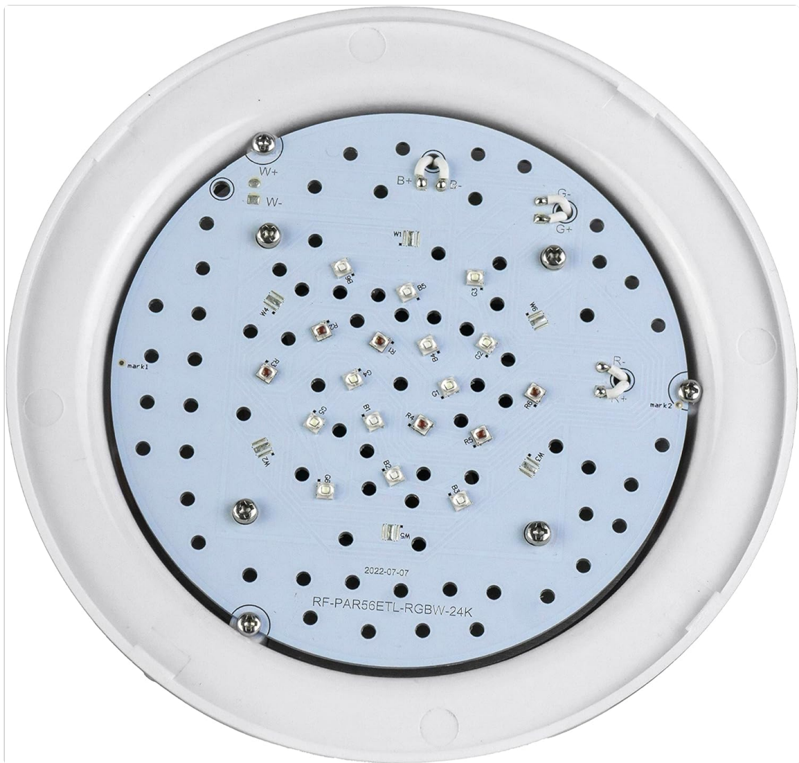
Image: Top view of the Pureline LED pool bulb, highlighting the LED array.