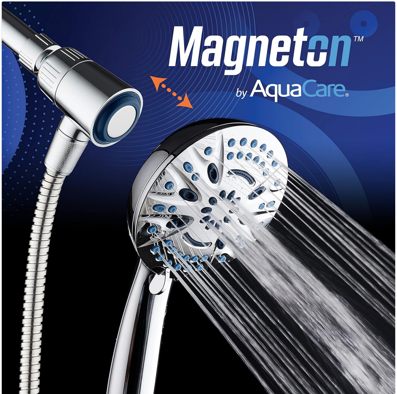
Figure 2: Magnetic Docking System

Screw the angle-adjustable overhead magnetic bracket onto the shower arm by hand until snug. Do not overtighten. Ensure the magnetic docking surface faces downwards.