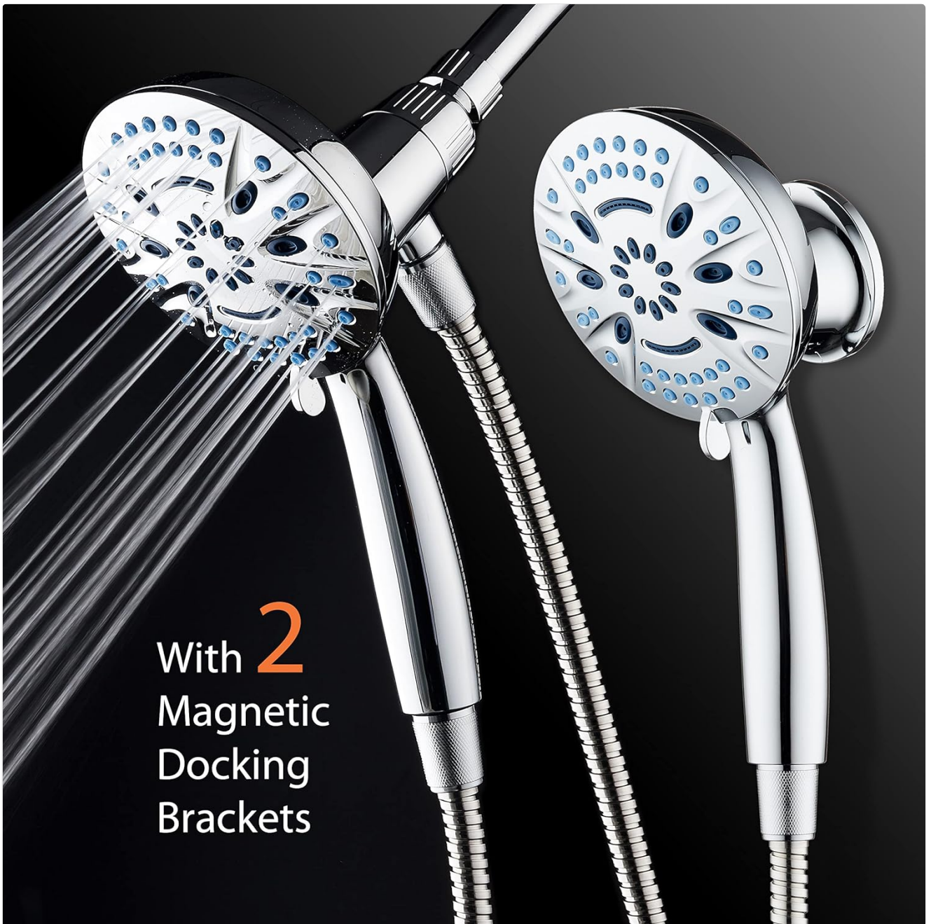
Figure 3: Two Magnetic Brackets for Versatile Use