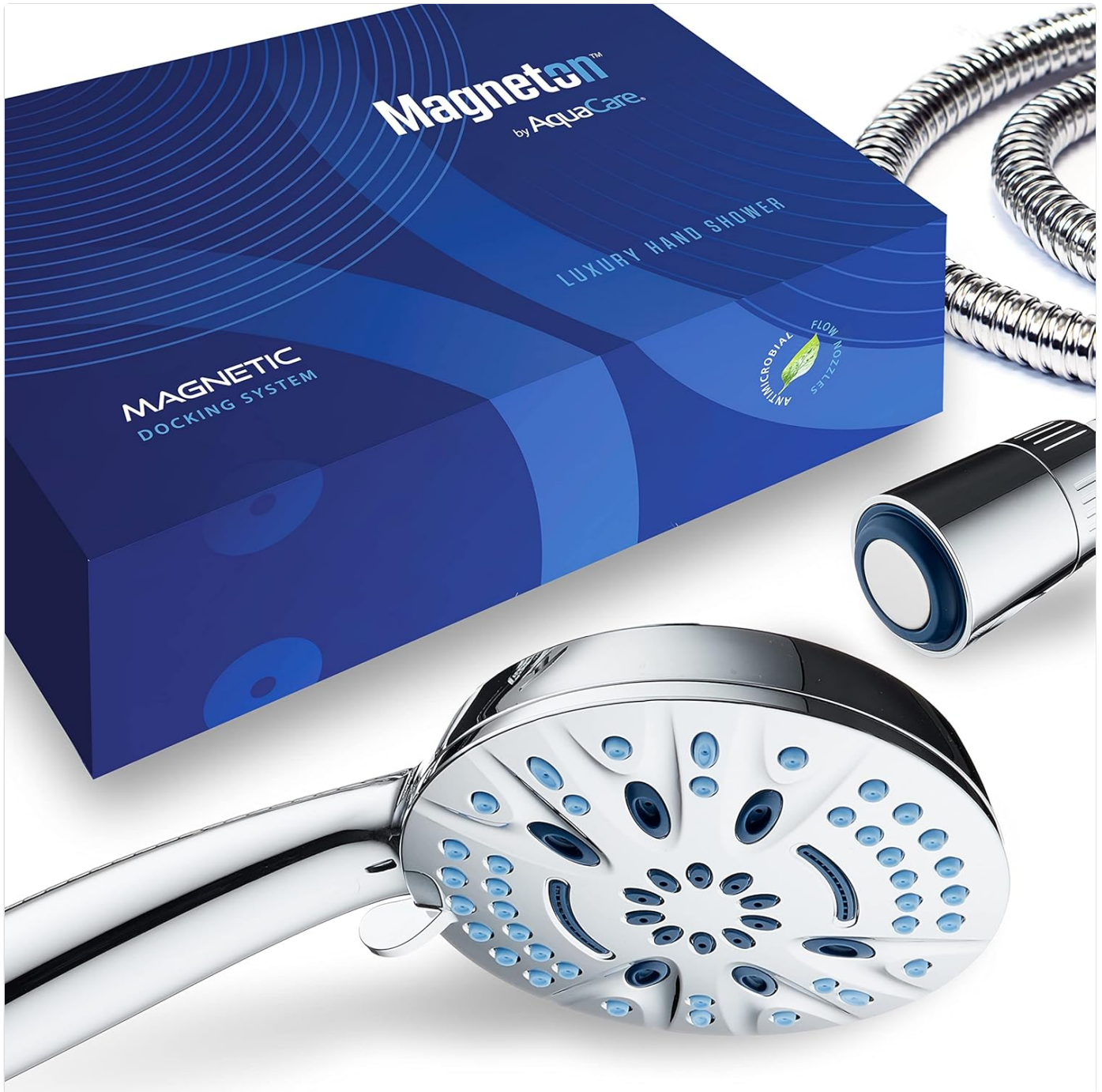
Figure 1: Magneton Shower System Components