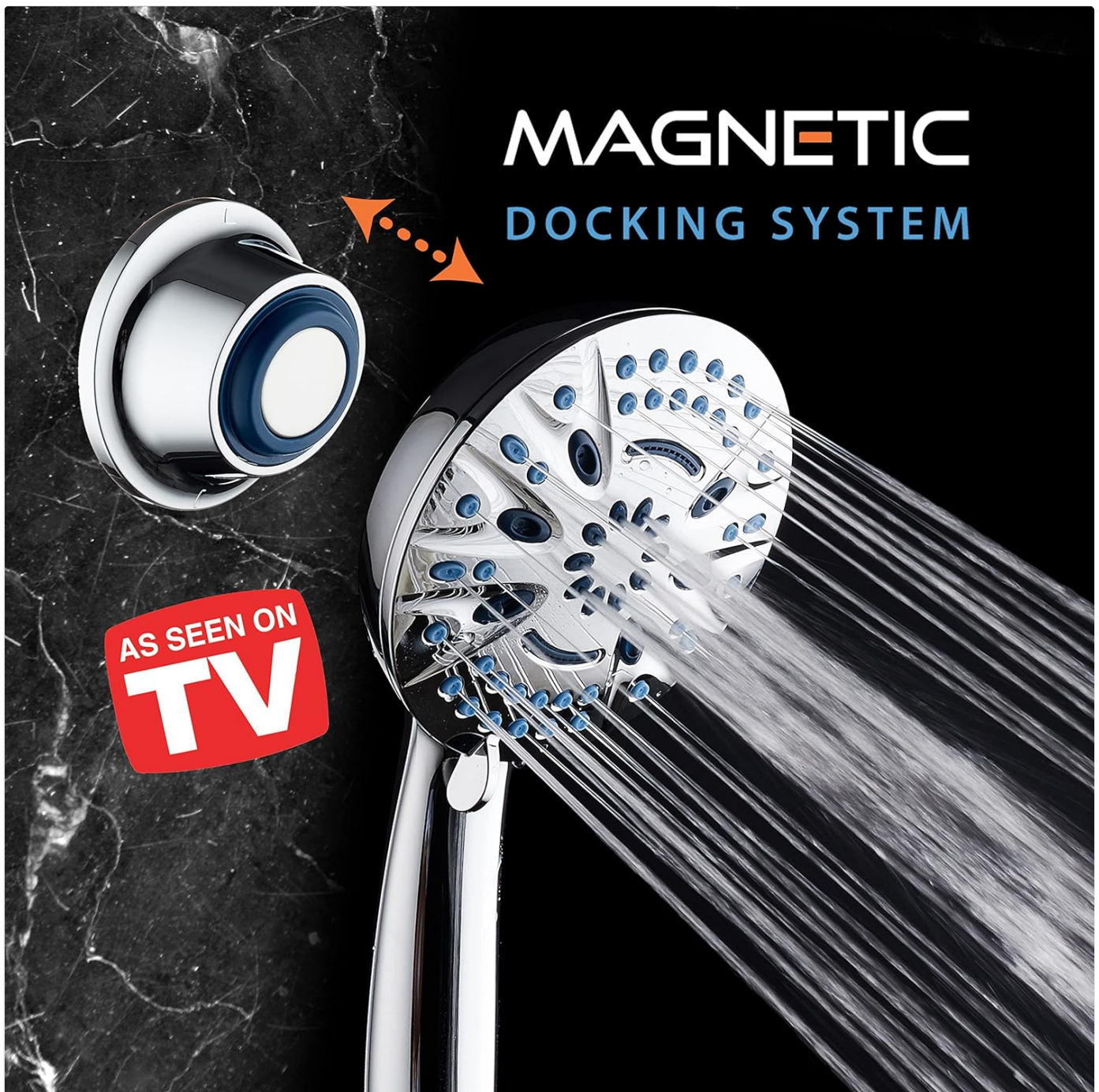
Figure 4: Close-up of Magnetic Docking