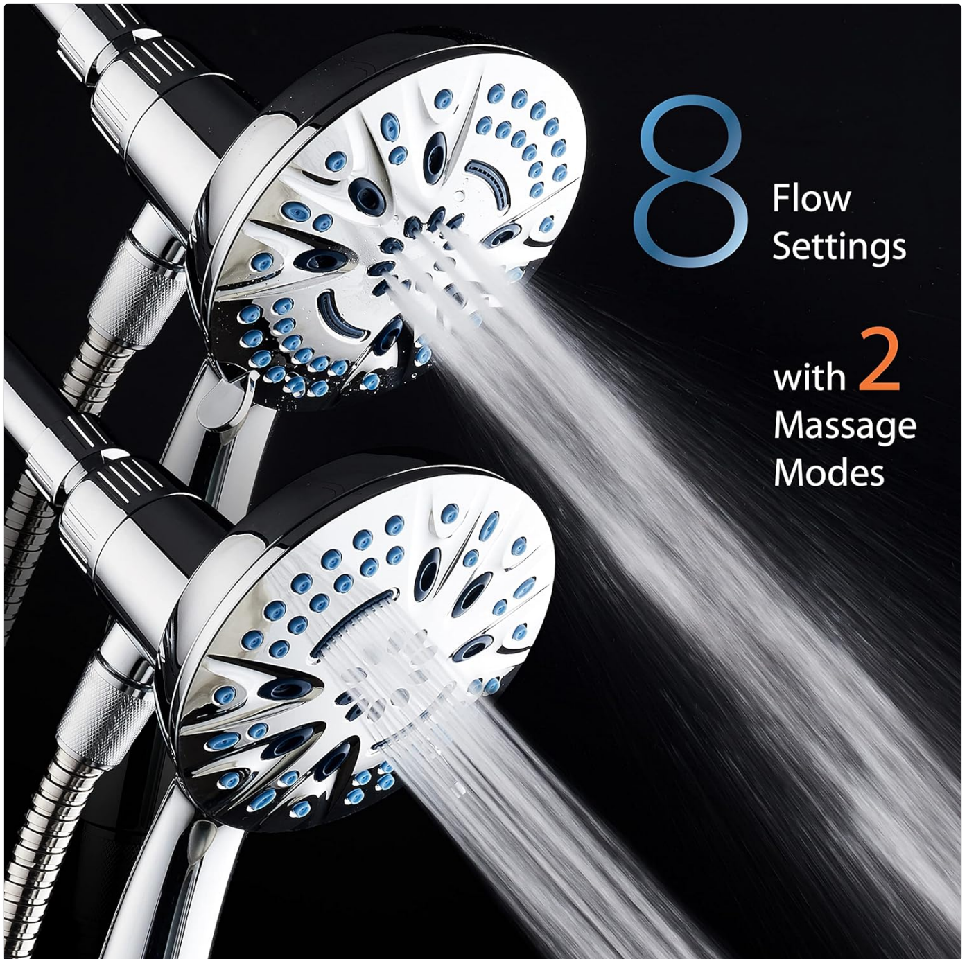
Figure 5: 8 Luxury Flow Settings