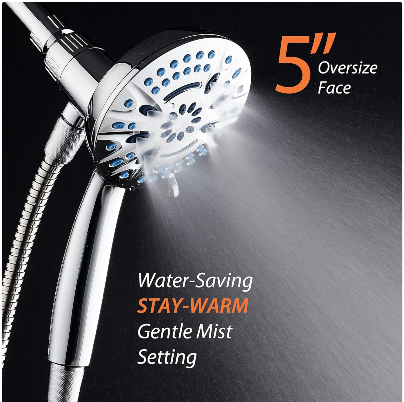
Figure 7: Water-Saving Stay-Warm Gentle Mist Setting