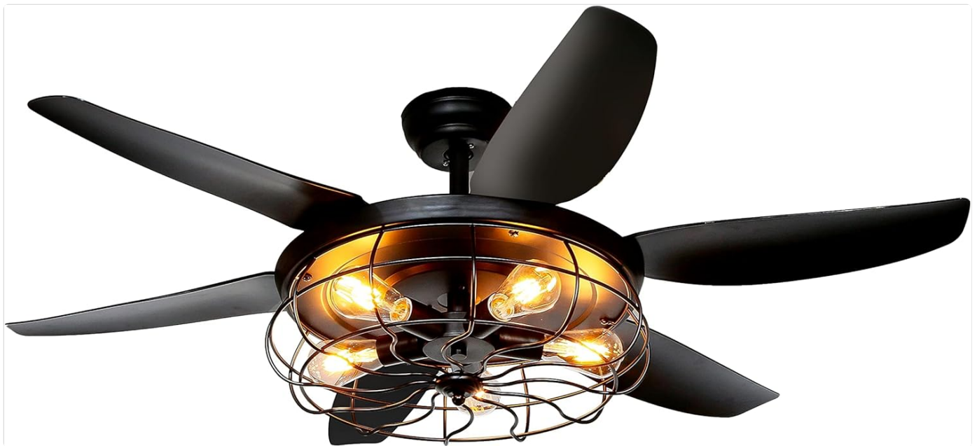
Figure 1: Ohniyou 52-inch Farmhouse Ceiling Fan with Lights and Remote.

The Ohniyou 52-inch Farmhouse Ceiling Fan is designed to provide optimal airflow and lighting for various indoor and outdoor spaces. Featuring a rustic design with a caged light fixture, it includes 6 blades and 5 E26 light bases (bulbs not included). Its reversible DC motor ensures efficient air circulation for both summer cooling and winter warmth. The fan operates quietly with a noise level of \leq 40\text{dB} and includes a convenient timer function for energy saving and peaceful sleep. Suitable for medium to large rooms, it can be installed on flat ceilings or those with a slant up to 15 degrees.