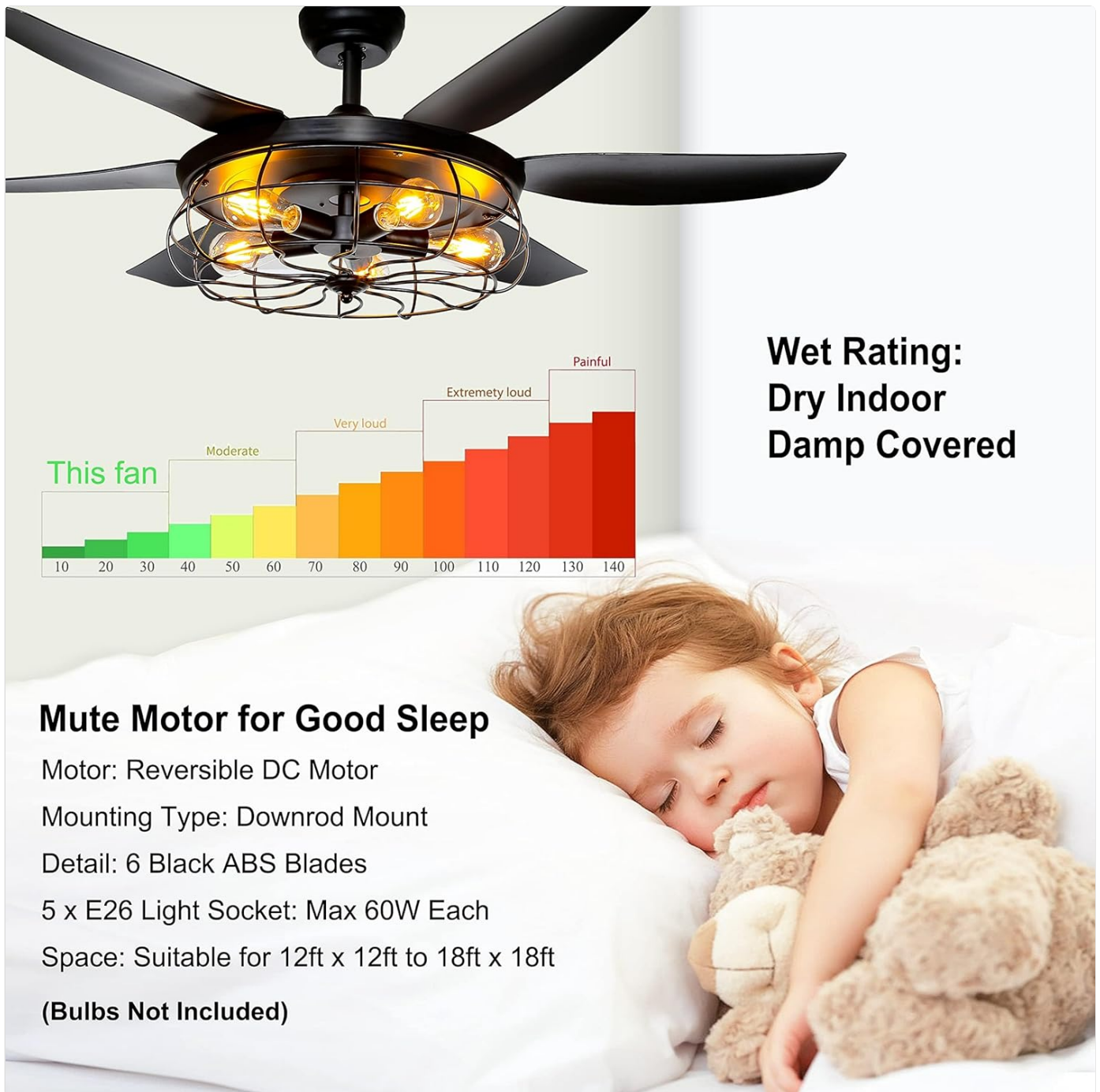
Figure 6: Key features including mute motor for quiet operation and wet rating suitability.