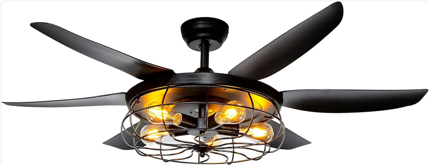
Figure 4: Close-up view of the light sockets and fan base for maintenance reference.