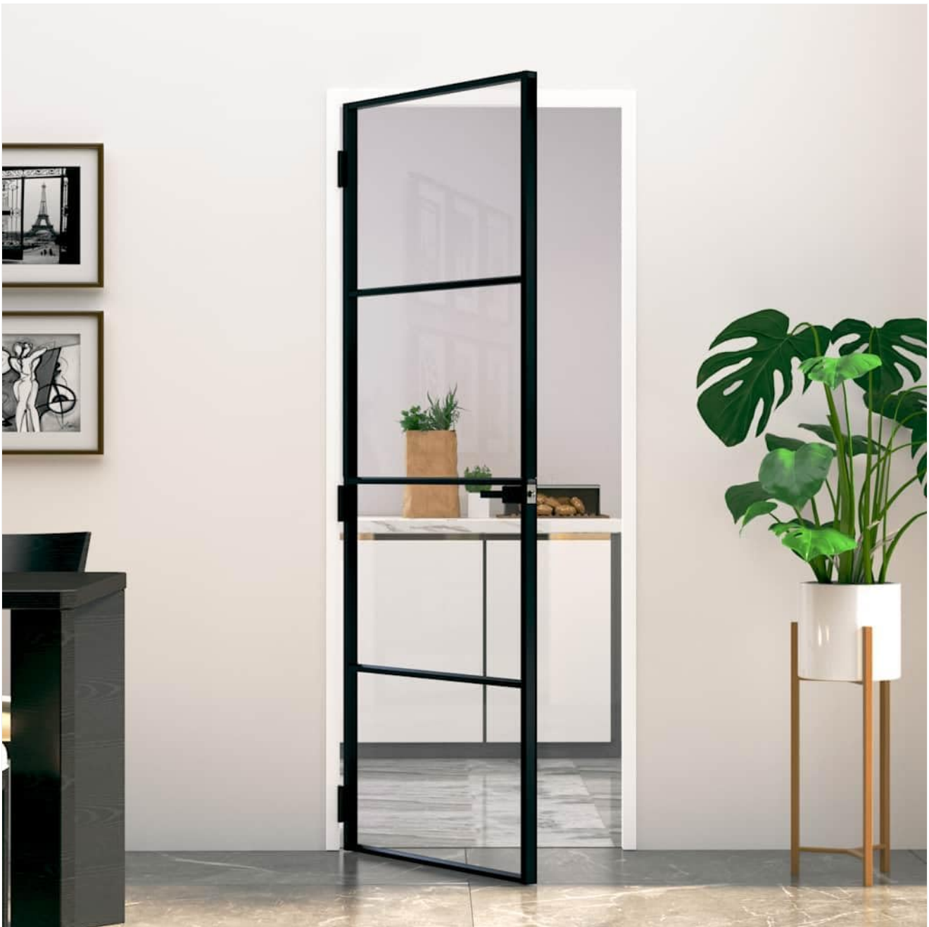
Image 1.1: The vidaXL Interior Door installed, showcasing its design and light-enhancing properties.