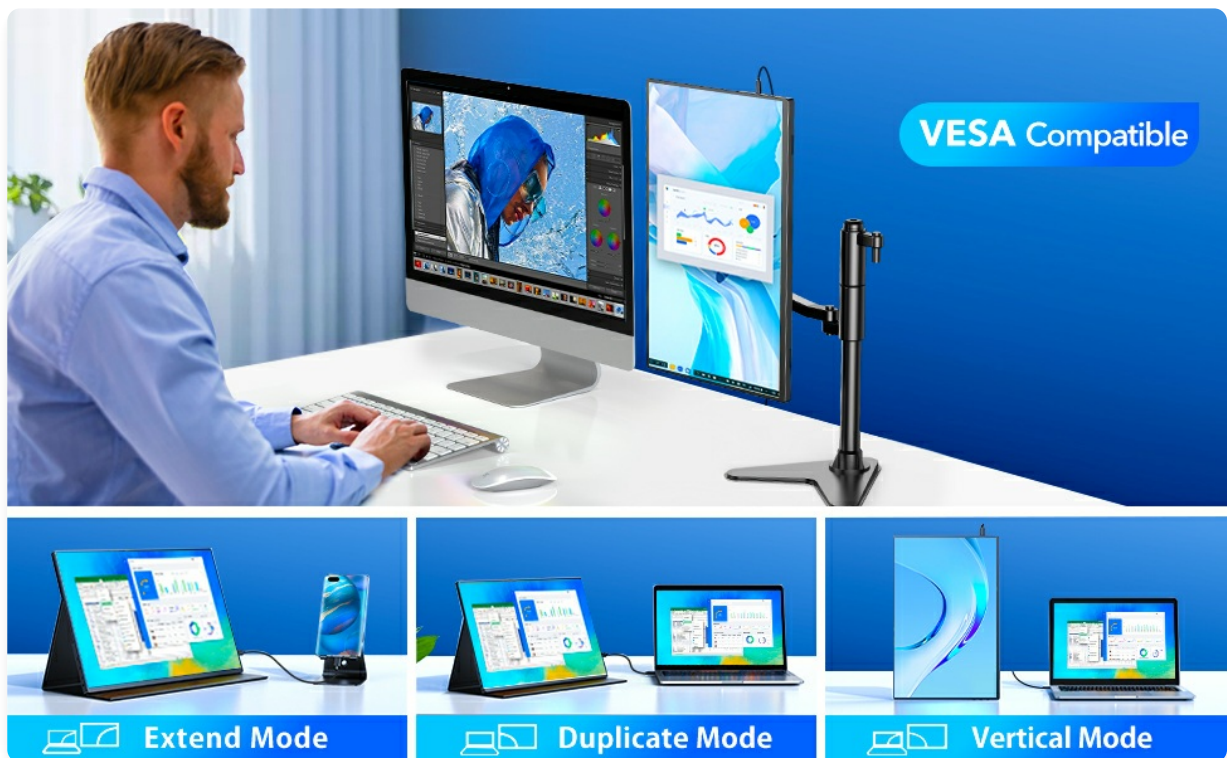
Image: Illustrations of various display modes: Extend Mode (dual monitor setup), Duplicate Mode (mirroring display), and Vertical Mode (portrait orientation for coding or document viewing).