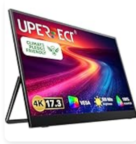
Image: The smart cover being used to protect the monitor, emphasizing its dual function as a protective case and a stand.