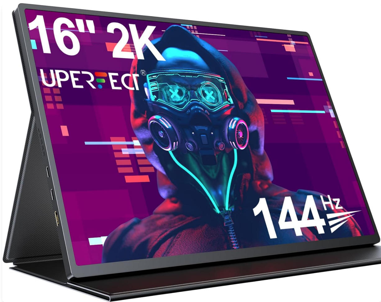
Image: The UPERFECT 16-inch 2K 144Hz Portable Monitor, showcasing its sleek design and vibrant display.