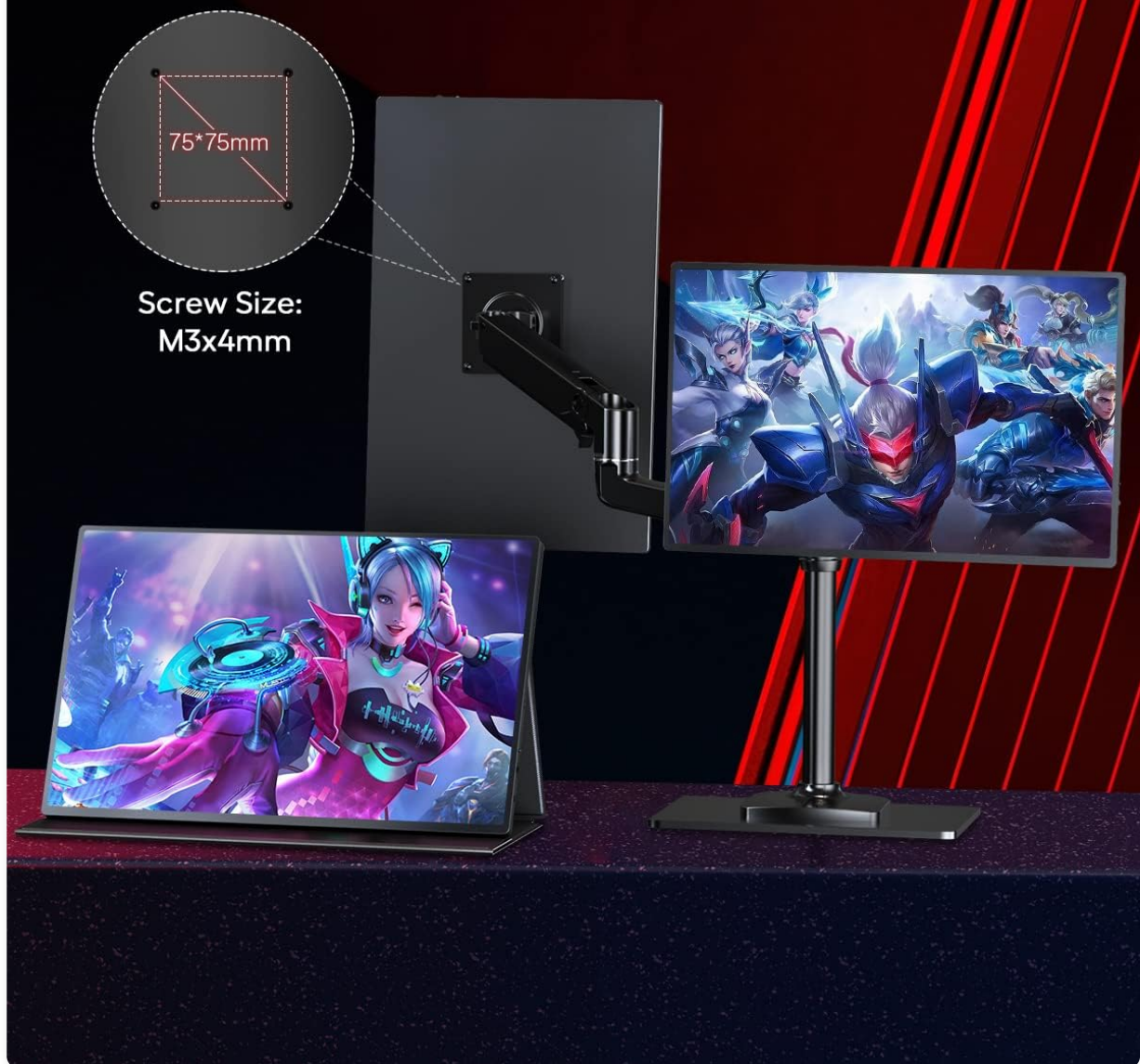
Image: The monitor shown with its smart cover acting as a stand and also mounted on a VESA arm, demonstrating its versatility.

for portrait and landscape mode, meet all your needs