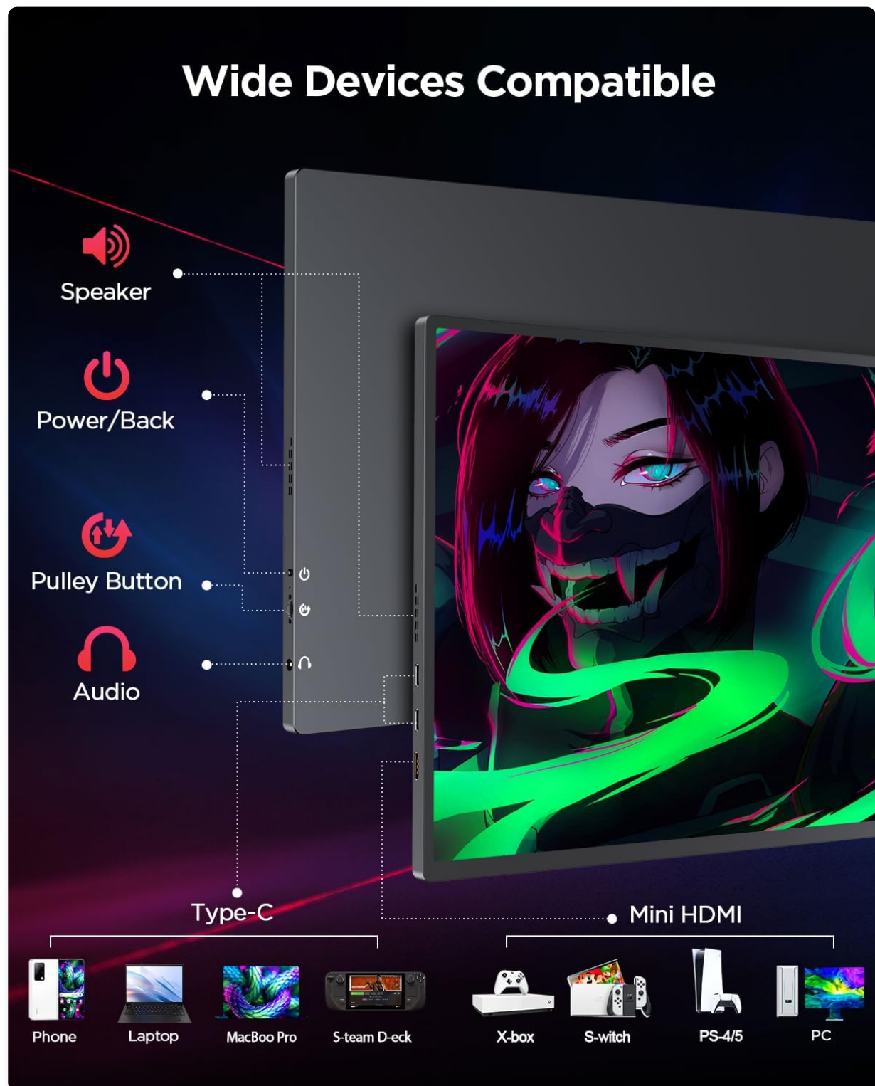
Image: Diagram illustrating the various ports and buttons on the UPERFECT portable monitor, including Speaker, Power/Back button, Pulley Button (OSD control), Audio jack, Type-C ports, and Mini HDMI port.

Familiarize yourself with the various components and ports of your UPERFECT portable monitor.