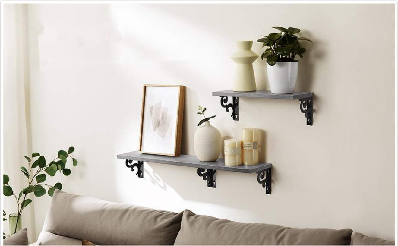
Image: The floating shelves installed in a living room, demonstrating a typical setup.