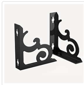
Image: The decorative black metal brackets.