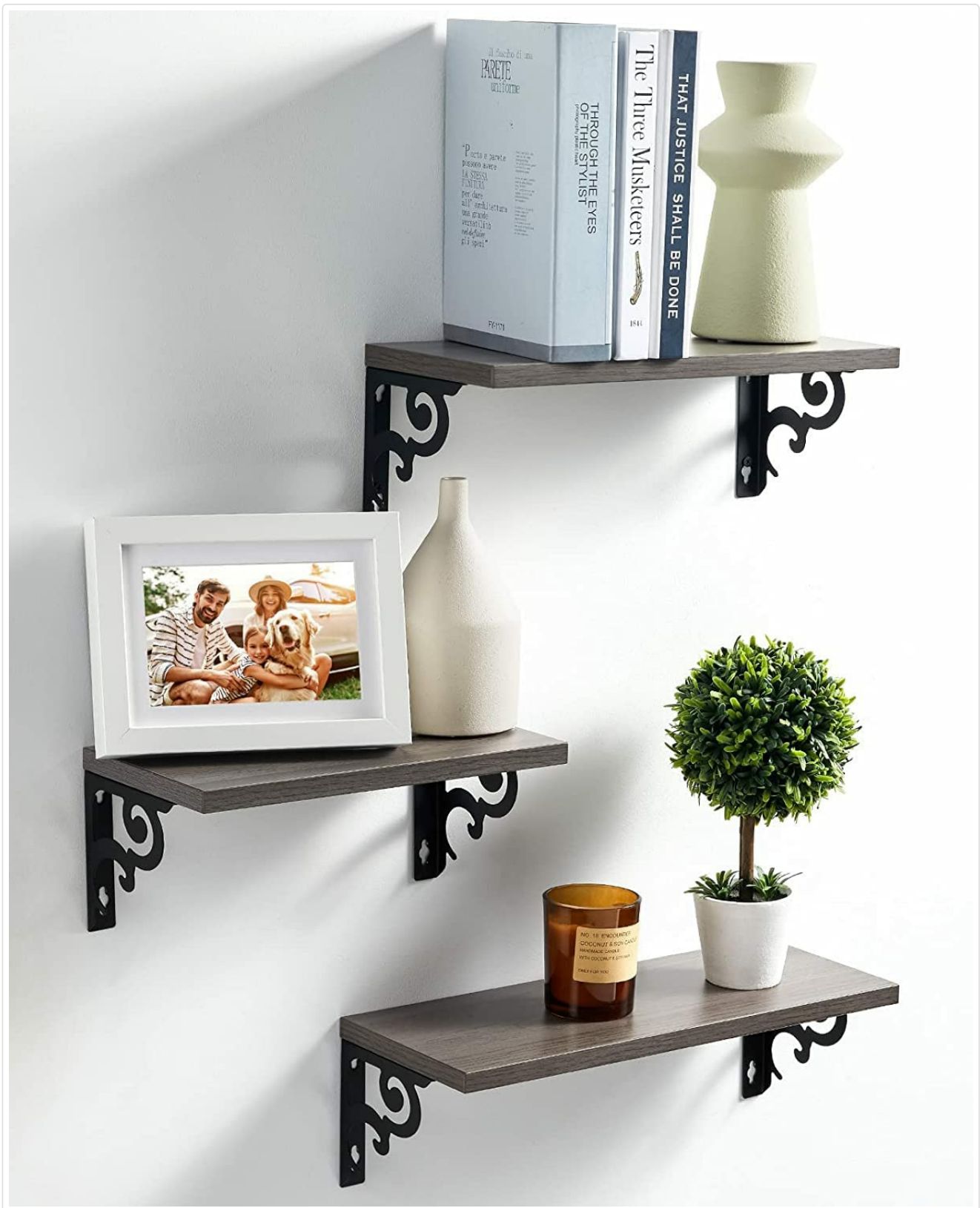
Image: Overview of the AMADA HOMEFURNISHING Floating Shelves installed in a bathroom, showcasing their decorative and functional use.