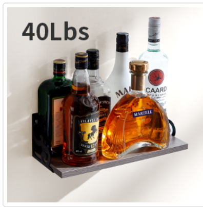
Image: A single shelf demonstrating its capacity to hold up to 40 lbs with various bottles.