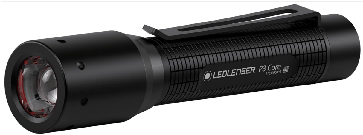
Figure 1: Ledlenser P3 Core Flashlight. This image shows the compact design of the flashlight with its textured body and pocket clip.

Its durable aluminum construction, convenient end cap switch, and integrated pocket clip make it a reliable and user-friendly device.