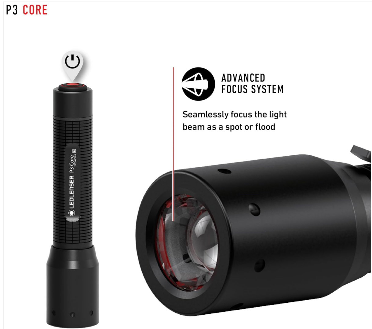
Figure 3: Advanced Focus System in action. This image highlights the mechanism for seamlessly focusing the light beam from spot to flood.

The Ledlenser P3 Core features an Advanced Focus System, allowing you to quickly switch between a focused spot beam for long-distance illumination and a wide floodlight for close-range area lighting. To adjust the focus, simply slide the head of the flashlight forward or backward with one hand.