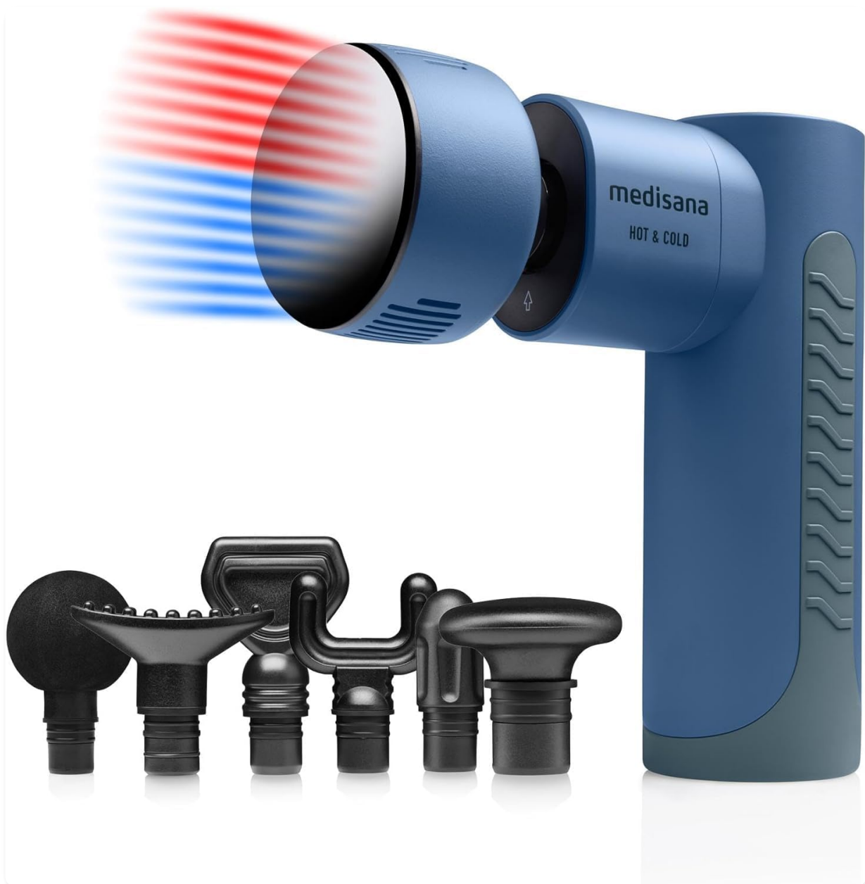
Figure 1: Medisana MG 600 Massage Gun with its seven interchangeable massage attachments. The image highlights the hot and cold function capabilities.