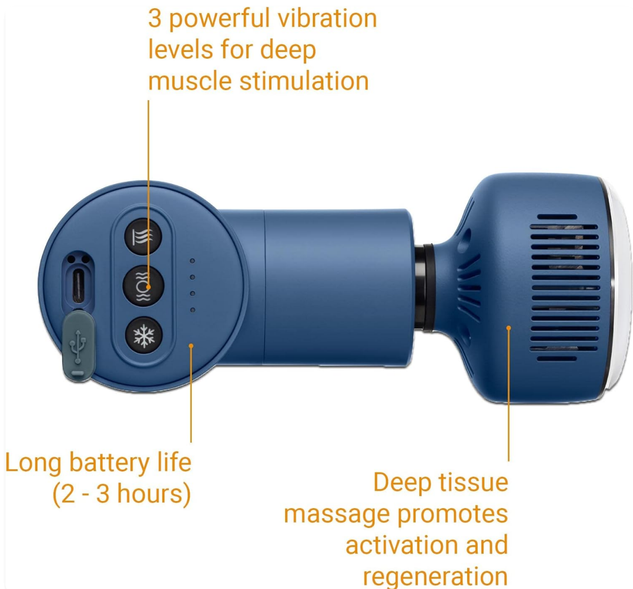
Figure 2: Detailed view of the control panel, indicating the power button, vibration level indicators, and hot/cold function buttons.

The Medisana MG 600 features three vibration levels and hot & cold Peltier technology for targeted muscle relief.