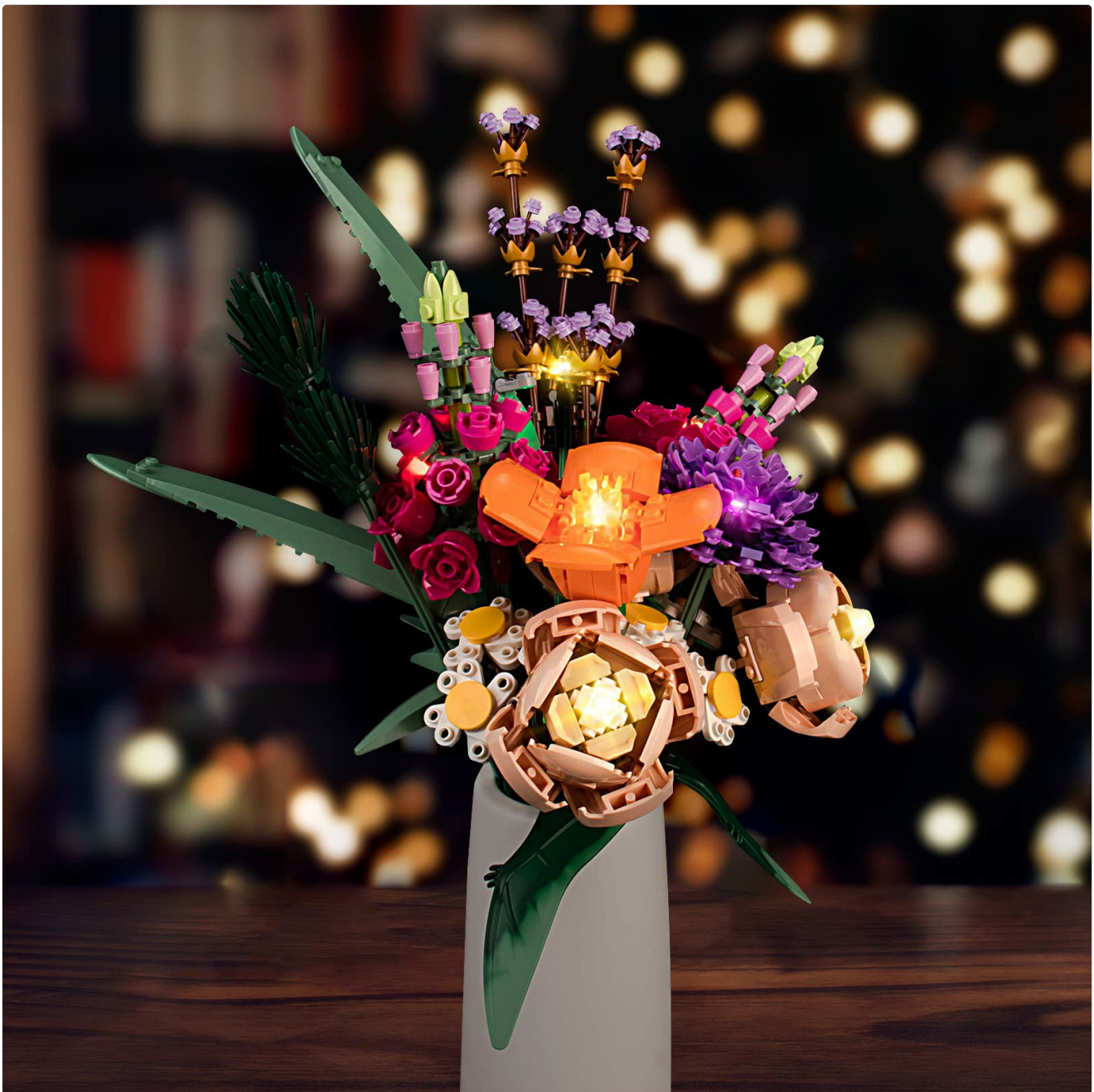
Image: The LEGO 10280 Botanical Flower Bouquet illuminated by the VONADO LED Light Kit, showcasing various colorful lights within the brick-built flowers.