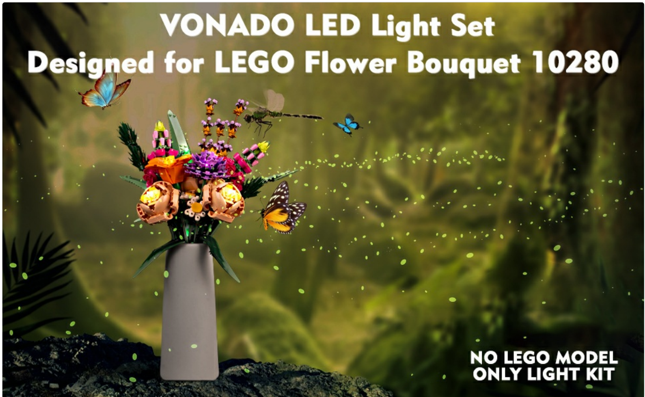
Image: The VONADO LED Light Set integrated into the LEGO 10280 Flower Bouquet, highlighting the vibrant illumination of the botanical elements. Note: LEGO model not included.