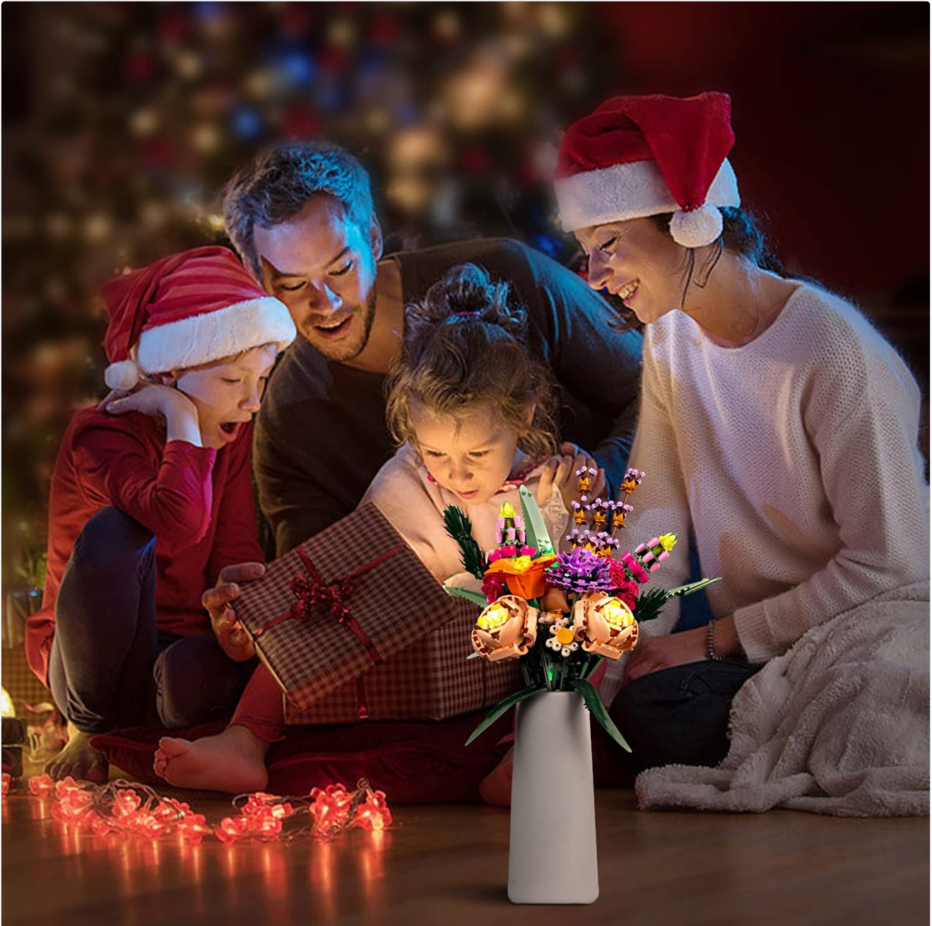
Image: The illuminated LEGO 10280 Flower Bouquet displayed as a decorative item, demonstrating the effect of the LED lights in a home setting.