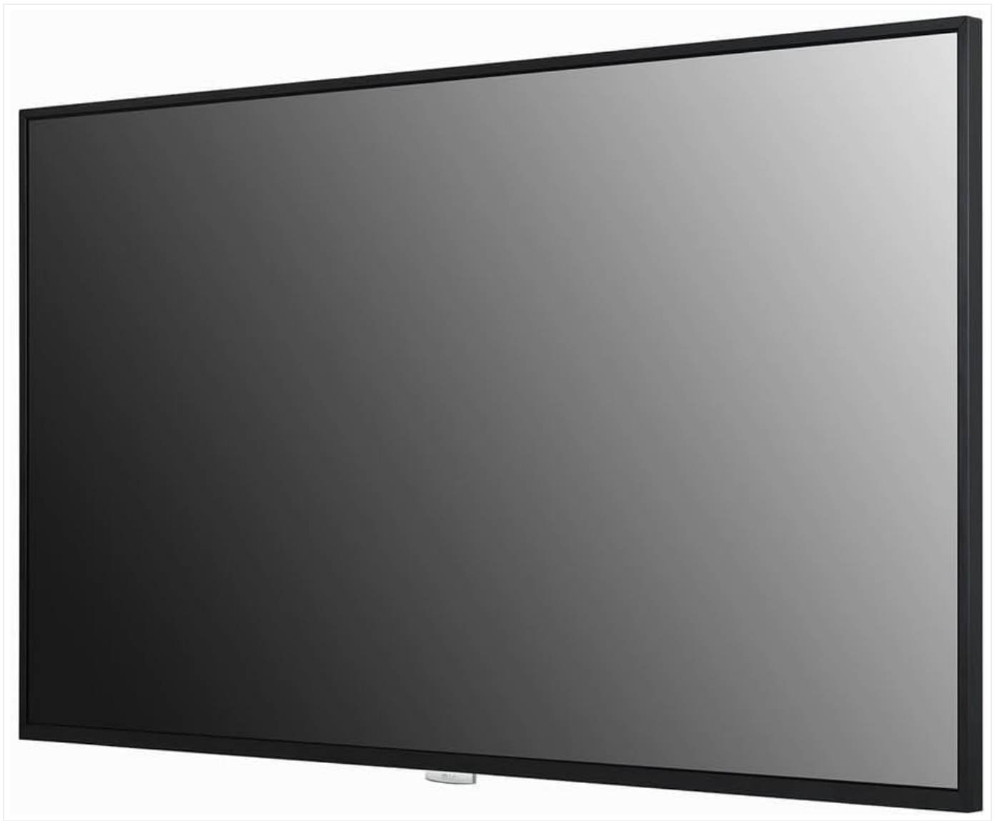
Figure 4.2: Side view of the LG 98UH5J-H display. This image illustrates the slim profile of the display when viewed from an angle, emphasizing its modern design.