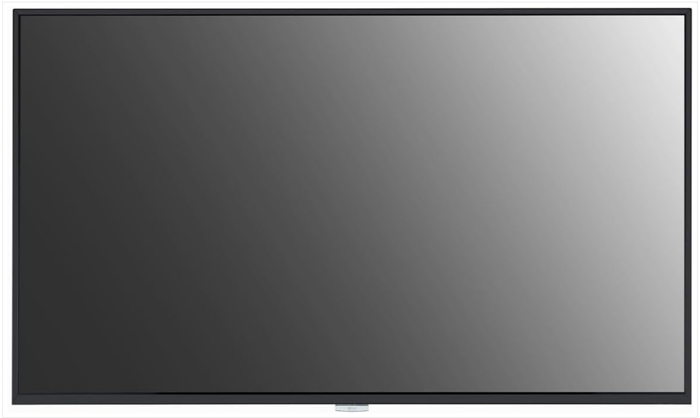
Figure 4.1: Front view of the LG 98UH5J-H display. This image shows the large, black-framed screen from a direct frontal perspective, highlighting its expansive display area.

Carefully remove the display from its packaging. Place the display on a stable, level surface or mount it securely using a compatible VESA mount (sold separately). Ensure adequate space around the display for ventilation.