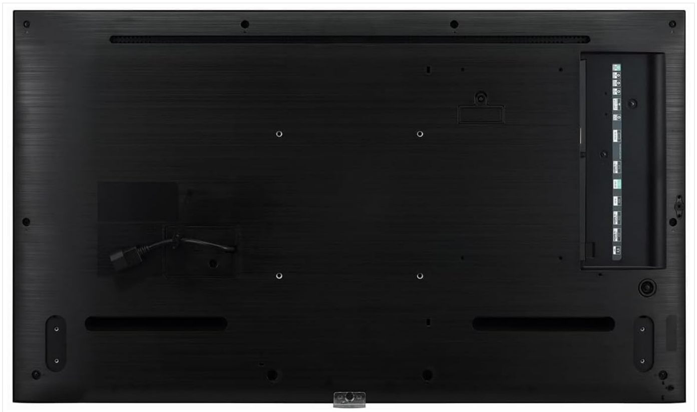
Figure 4.3: Rear view of the LG 98UH5J-H display. This image displays the back panel, highlighting the arrangement of various input and output ports on the right side.