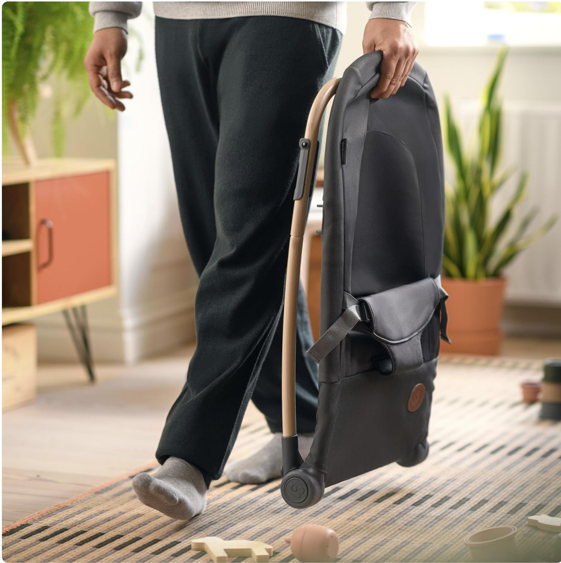
Figure 5: A person easily carrying the Maxi-Cosi Loa bouncer after it has been folded for transport.