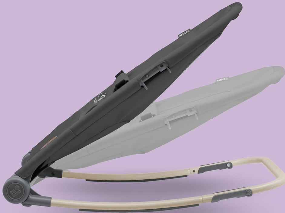
Figure 3: Illustration of the two available recline positions for the bouncer.

Adapté dès la naissance, 2 positions d'inclinaison