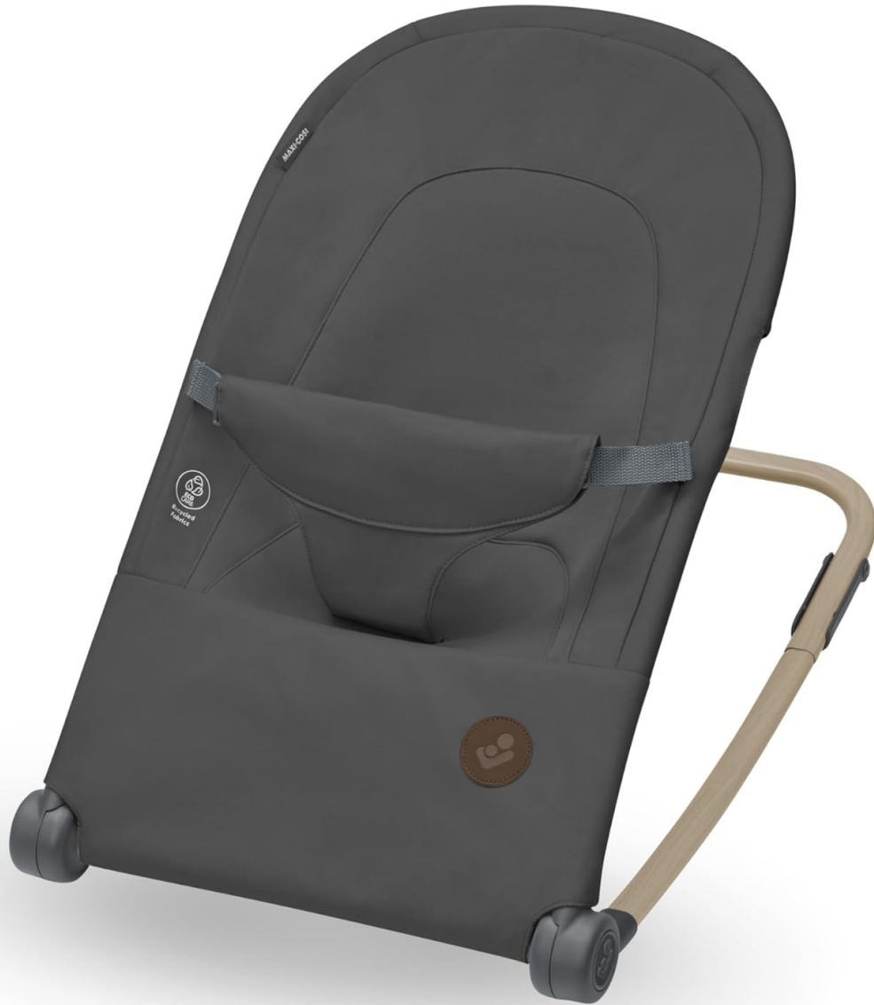
Figure 1: Maxi-Cosi Loa Baby Bouncer, fully assembled.