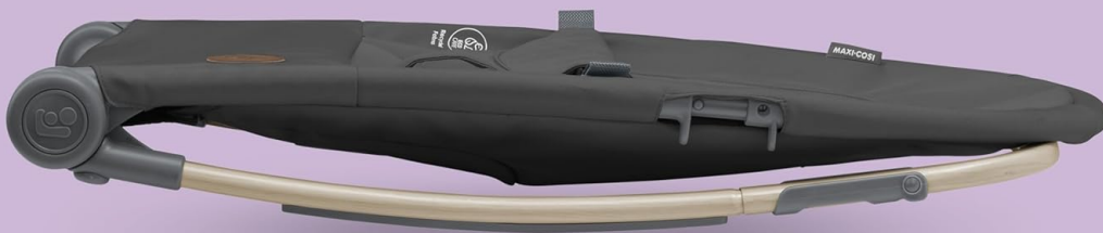
Figure 2: The bouncer in its ultra-compact folded state, highlighting its portability.