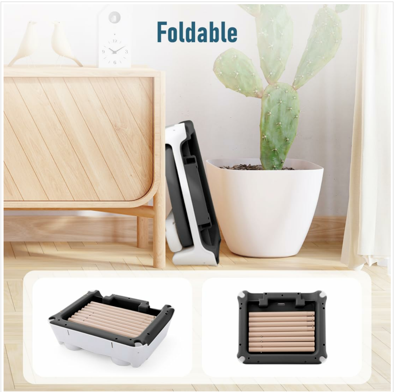
Image: The high chair folded into a compact form for storage, with additional views showing the top and bottom of the folded unit.