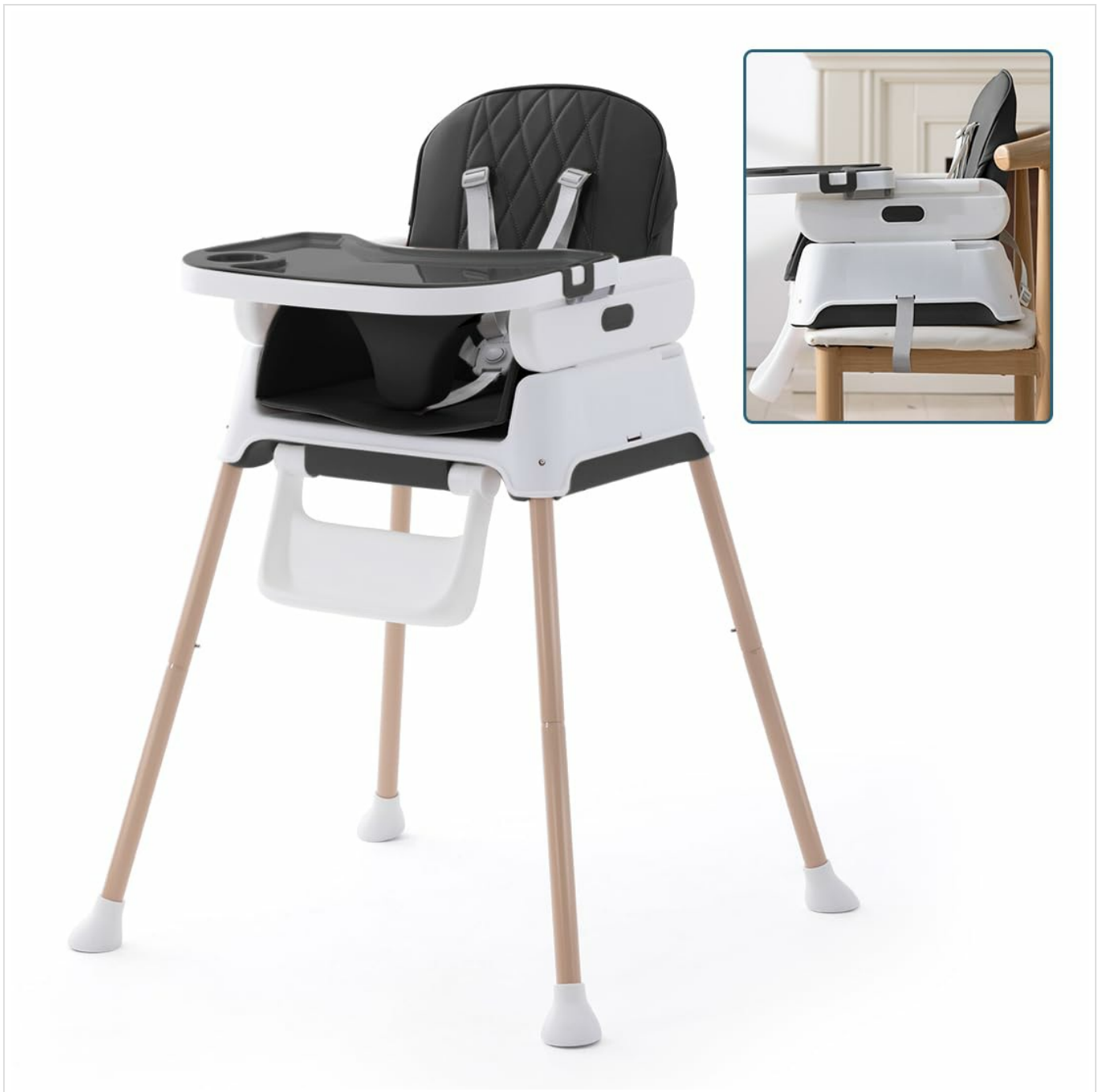
Image: The high chair in its full configuration, with an inset image demonstrating how the seat unit can be used as a booster seat on a standard adult chair.