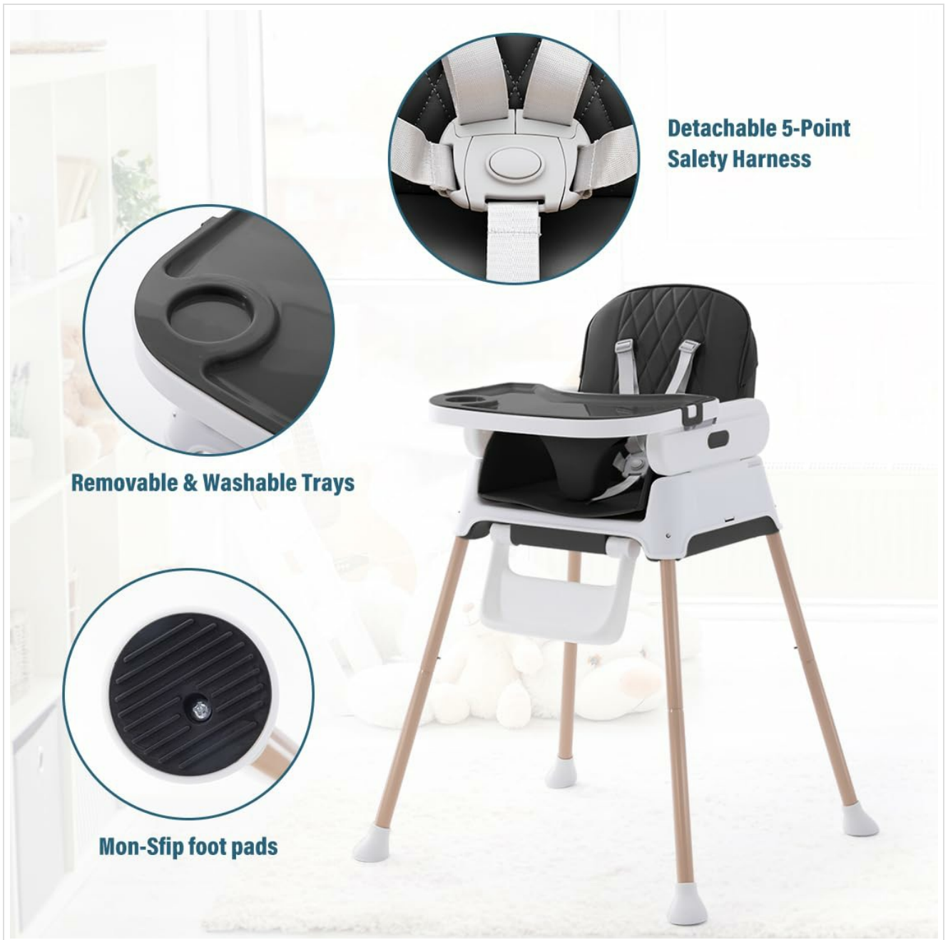
Image: Close-up views of the detachable 5-point safety harness, the removable and washable trays, and the non-slip foot pads, illustrating key features.