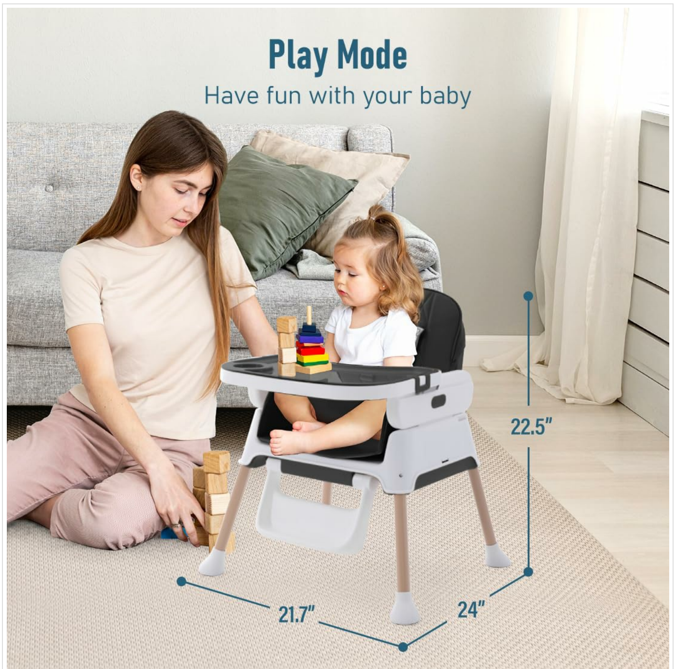
Image: A child engaged in play while seated in the low chair configuration, illustrating the "Play Mode" functionality.