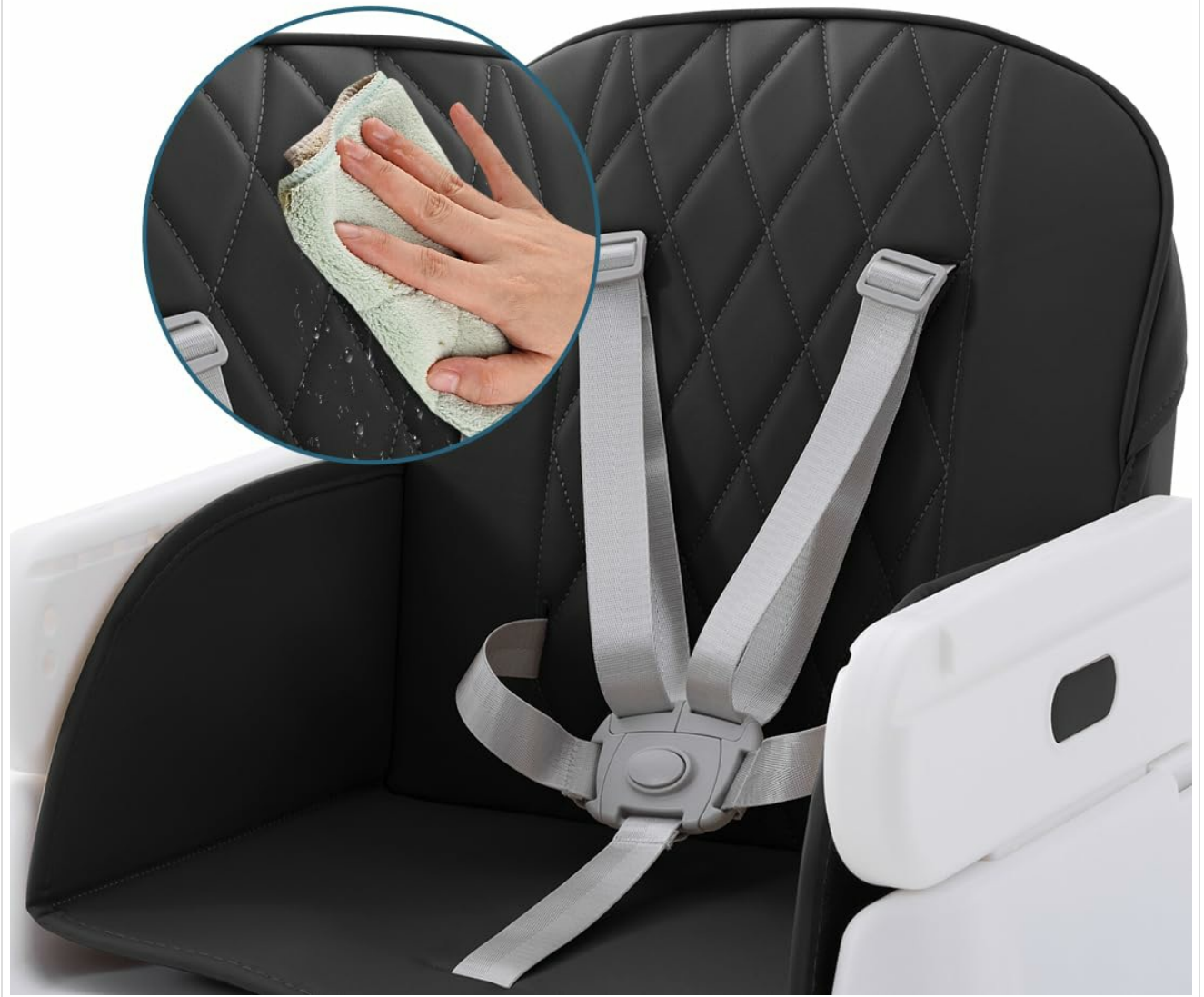
Image: A hand wiping the seat of the high chair, demonstrating its waterproof and easy-to-clean material.