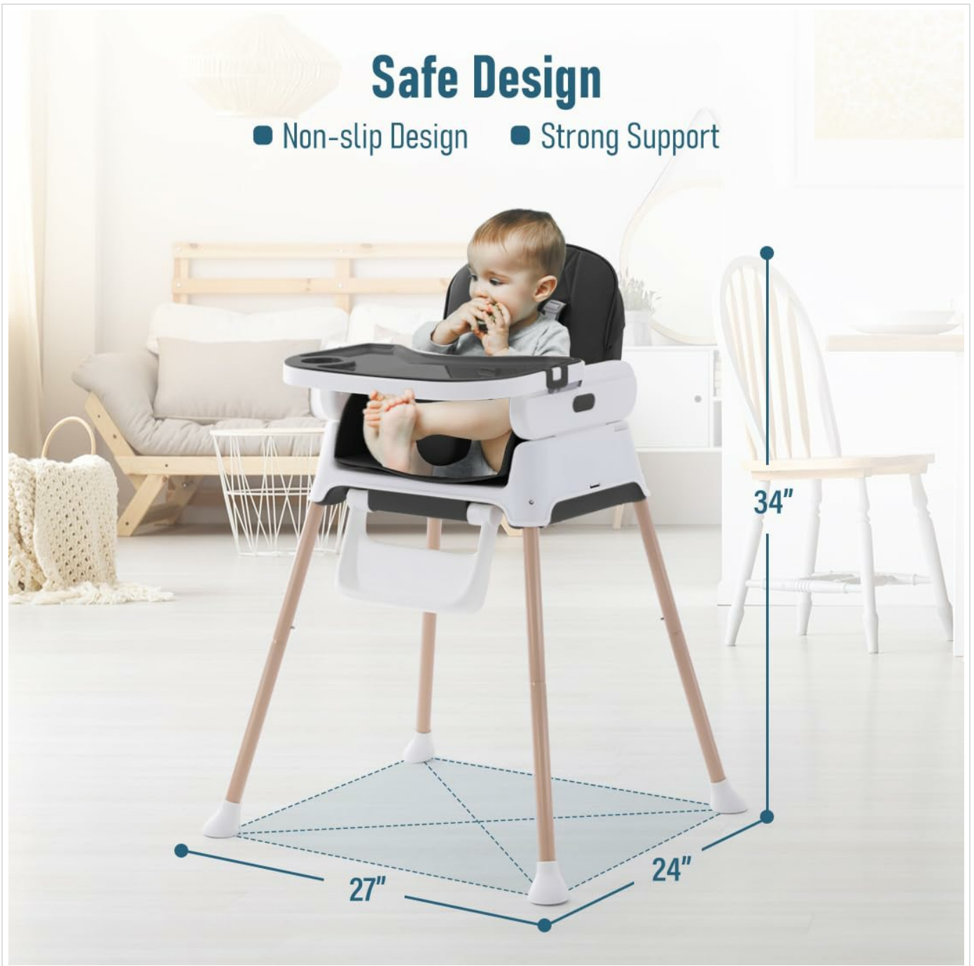
Image: A baby seated in the high chair, demonstrating its stable and safe design, with dimensions indicated for reference.