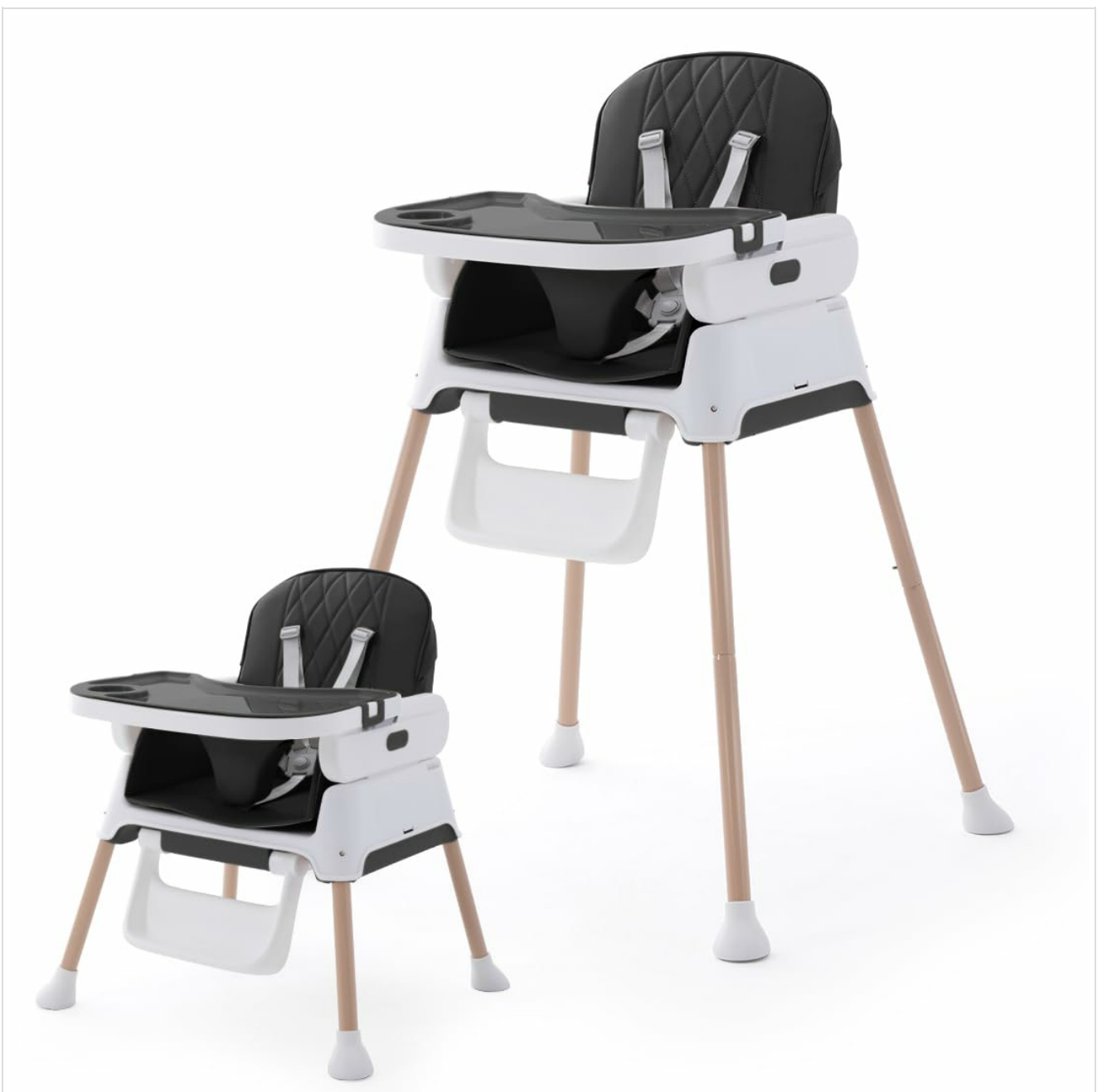
Image: The high chair assembled in both its full height and low chair configurations, demonstrating its versatility.