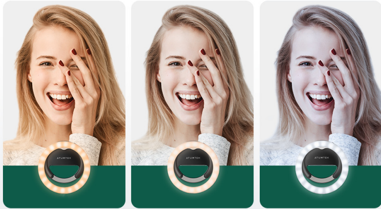
Image: Visual representation of the adjustable color balance, showing warm, neutral, and cool light settings.