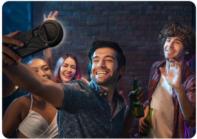
Image: A group of people taking a selfie with the ATUMTEK ring light attached to a smartphone.

Compatible with all Apple iPhones and Android smartphones