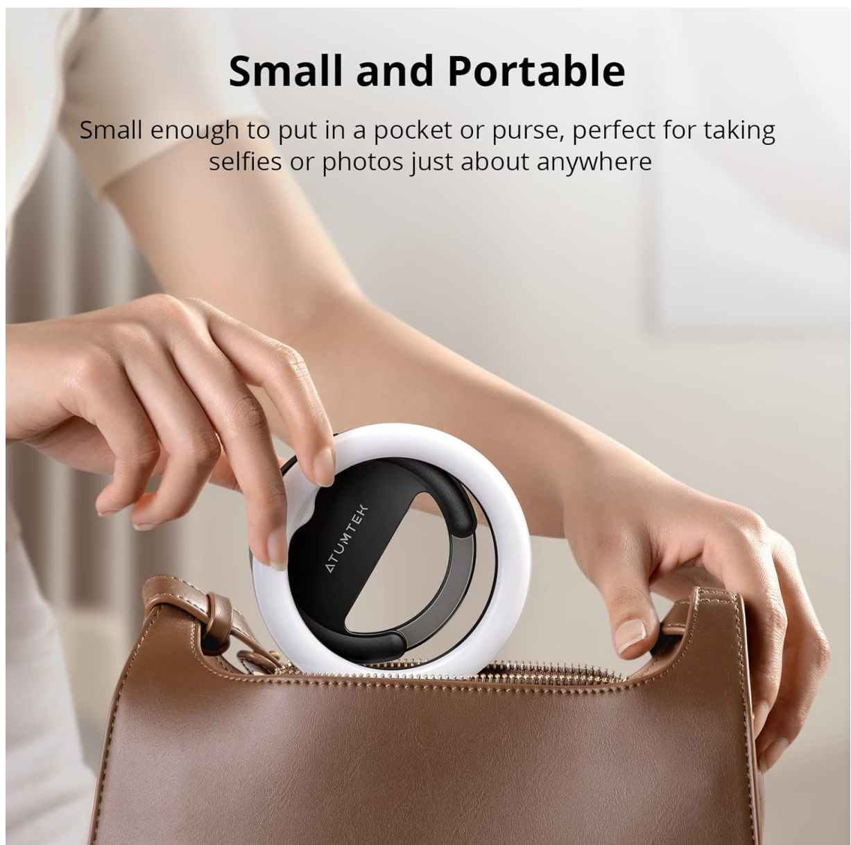
Image: The compact ATUMTEK ring light being placed into a small handbag, highlighting its portability.

With its small 4-inch diameter and lightweight design (130g), the ring light is highly portable, fitting easily into a pocket or purse, making it perfect for travel.