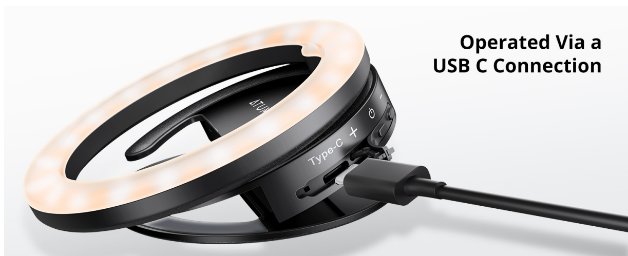
Image: Close-up view of the USB-C charging port on the side of the ring light.

Equipped with a built-in lithium-ion battery, the ring light is rechargeable via a USB-C cable. This ensures portability and convenience for on-the-go use, with an average battery life of 1.5 hours.