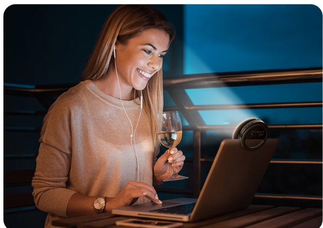
Image: A woman using the ATUMTEK ring light clipped to her laptop during a video call.

Compatible with iPad and Android tablets, MacBook, Chromebook, and iMac