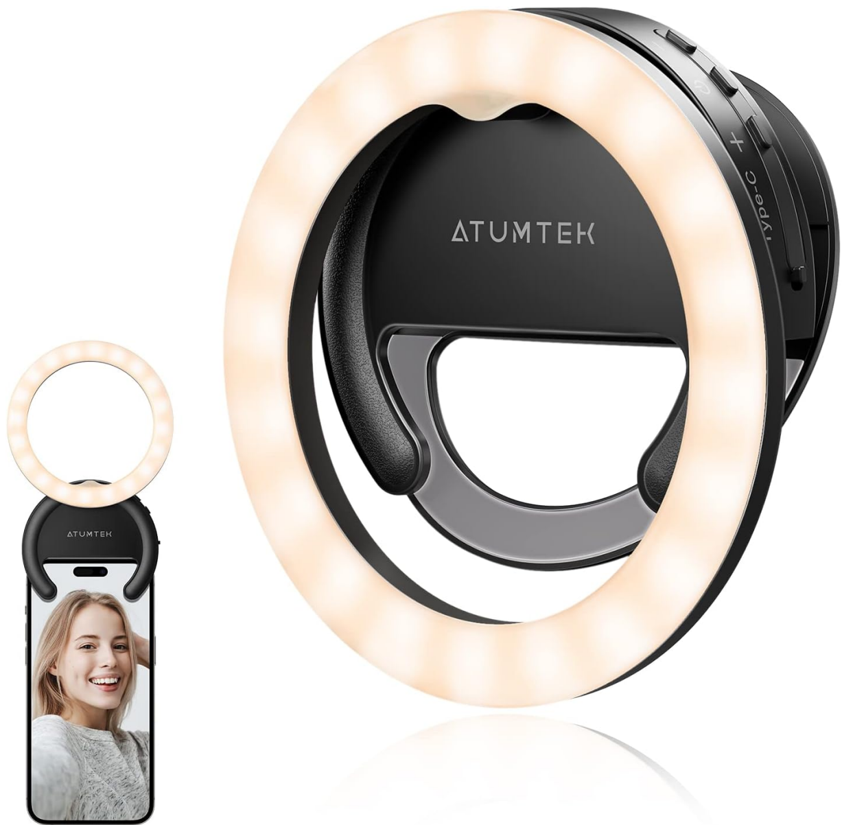
Image: The ATUMTEK 4-inch Rotatable Selfie Ring Light, showing its compact design and illuminated ring.