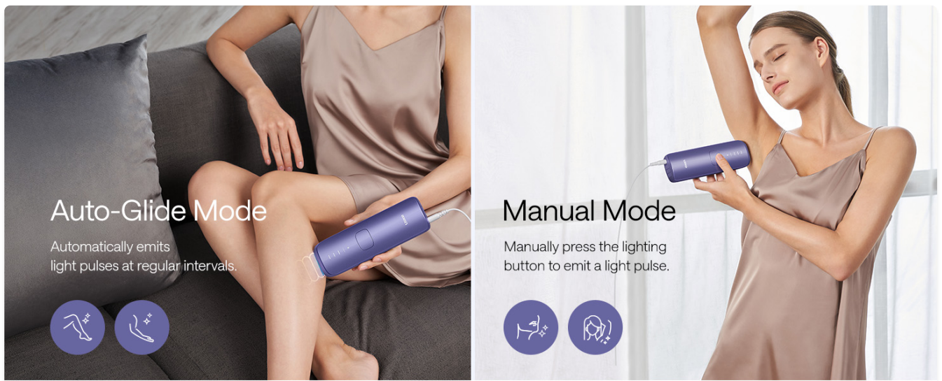
Customized modes for different body areas.