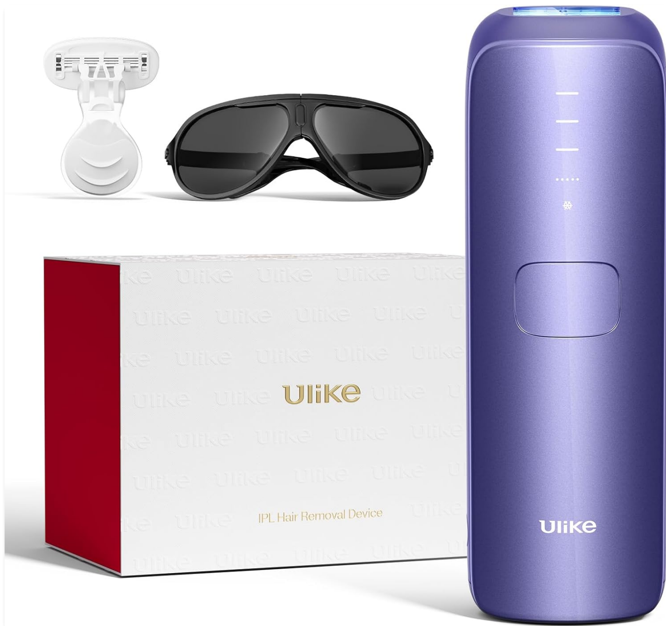
Image: Ulike Air 3 IPL Device, razor, and protective goggles.