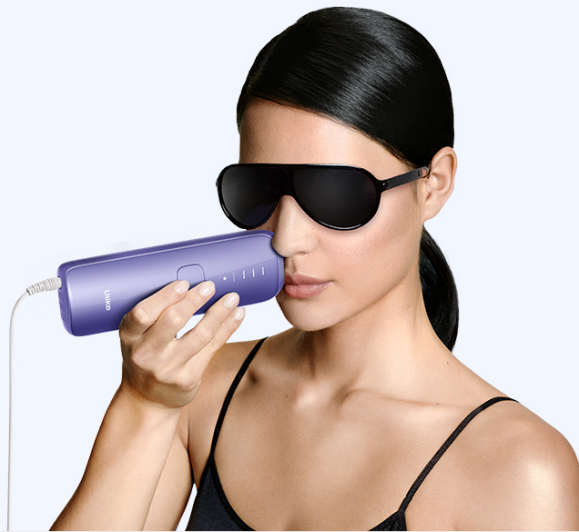
Image: Recommended treatment frequency for optimal results.

Put the light window vertically to your skin, and press treatment button to start hair removal.