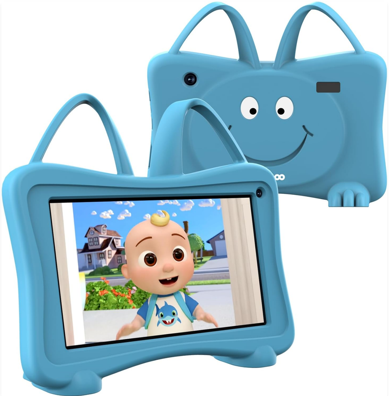
Image: The Trayoo Kids Tablet 7 in its blue protective case, showing both front and back views. The case features handles and feet for easy handling and standing.