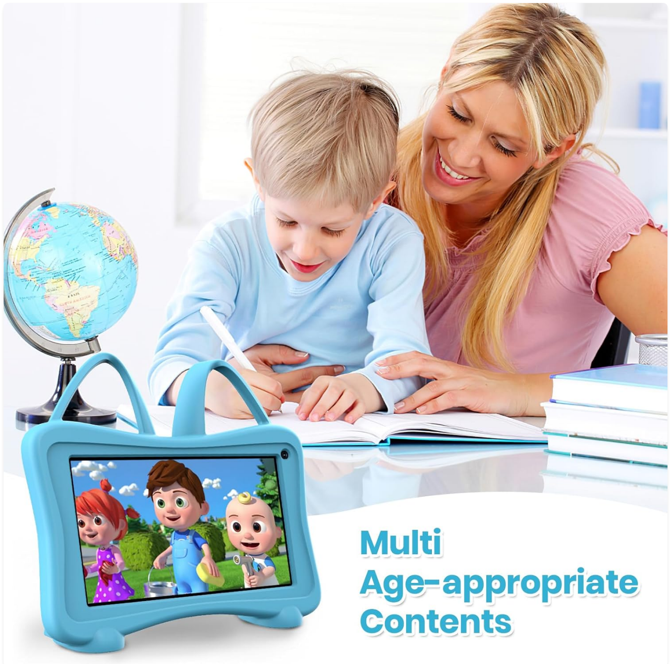
Image: A child happily using the Trayoo Kids Tablet 7, which displays various educational and entertainment content suitable for multiple age groups.