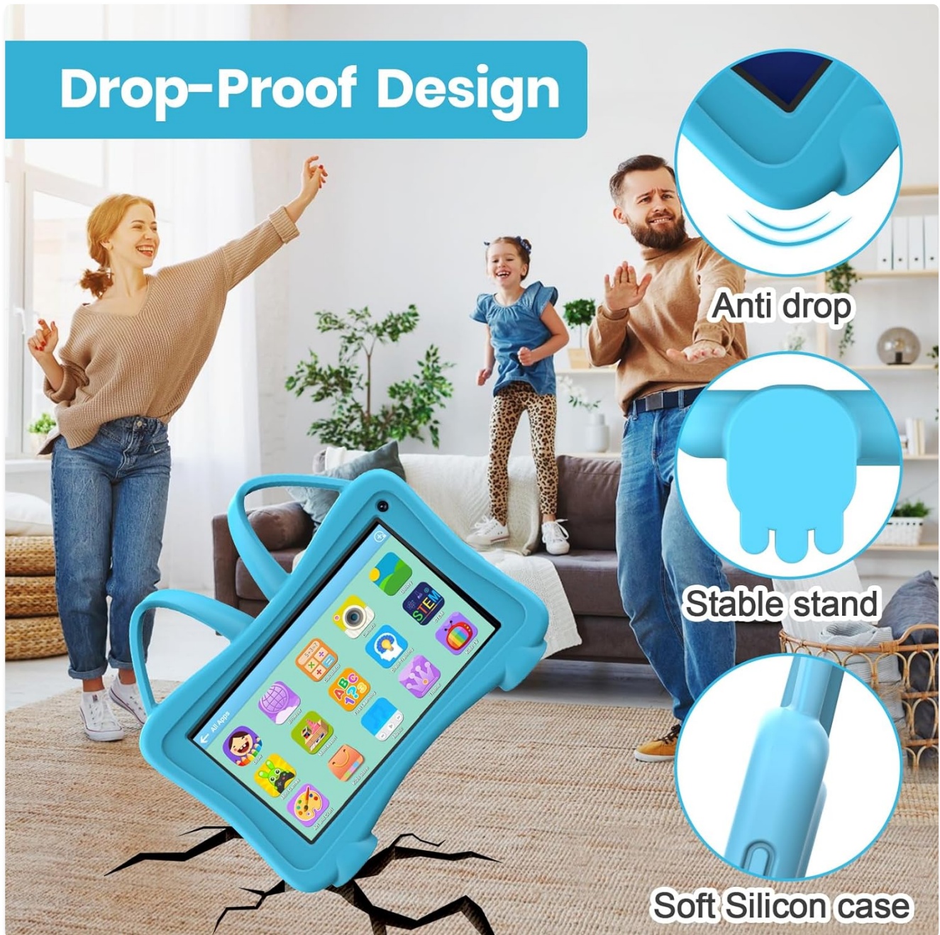
Image: A visual representation of the tablet's drop-proof design, emphasizing its anti-drop features, stable stand, and soft silicone case, with a child in the background appearing to drop the tablet without damage.

The tablet comes with a durable kids-proof silicone case designed to protect it from bumps and drops. Keep the case on the tablet during use to maximize protection.