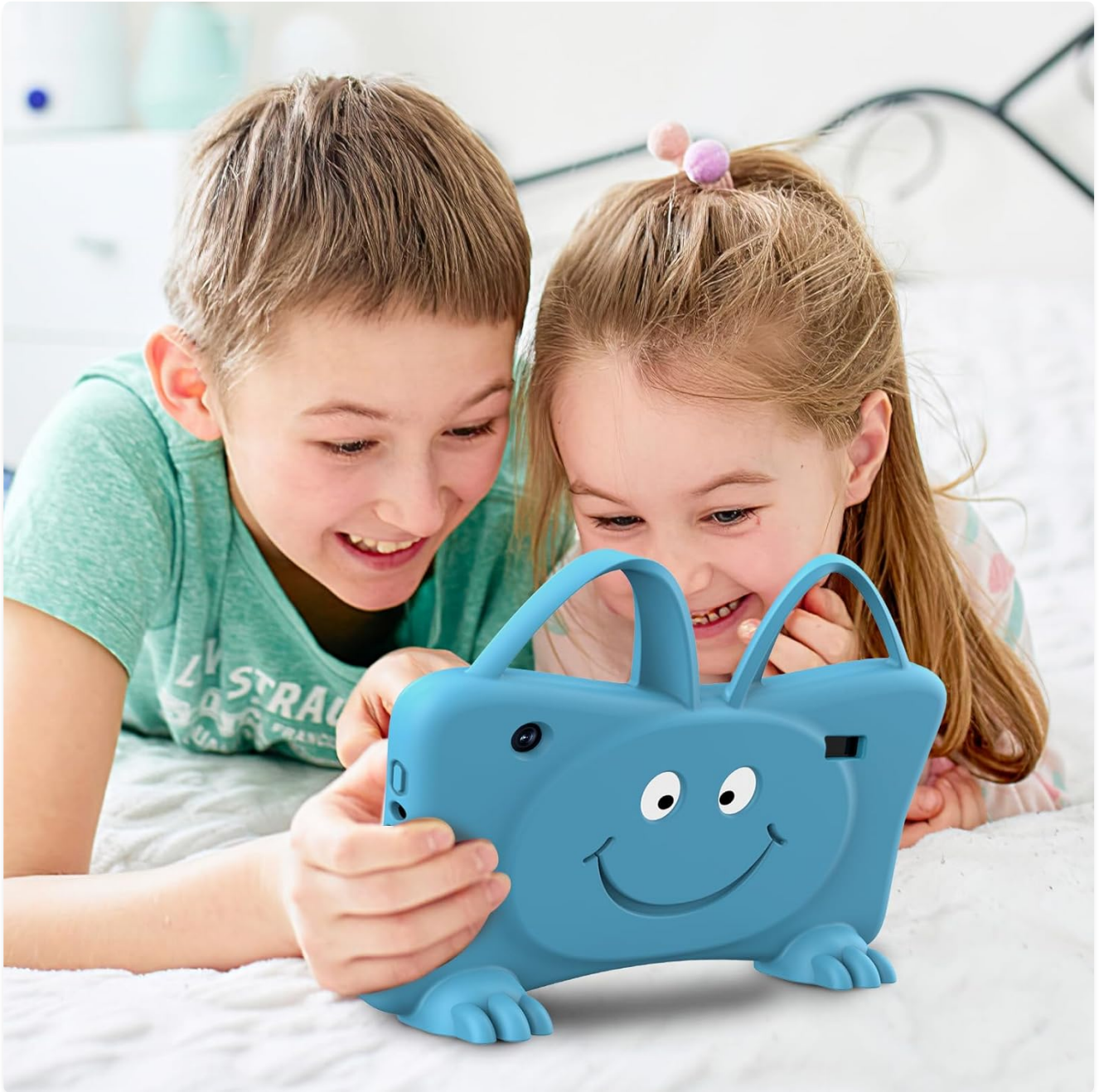
Image: Two children are shown lying on a bed, looking at the back of the blue Trayoo Kids Tablet 7. The tablet's rear camera is visible, suggesting they might be taking photos or videos.