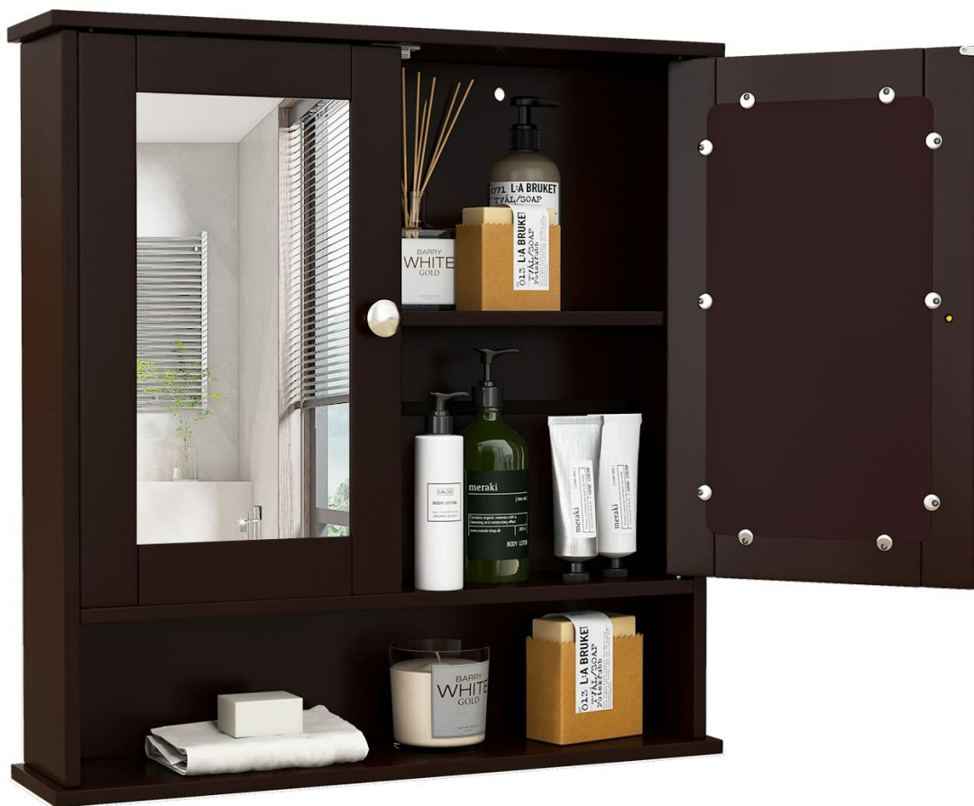
Image: The cabinet with one door open, displaying the adjustable shelf and various items stored within, demonstrating its practical use.