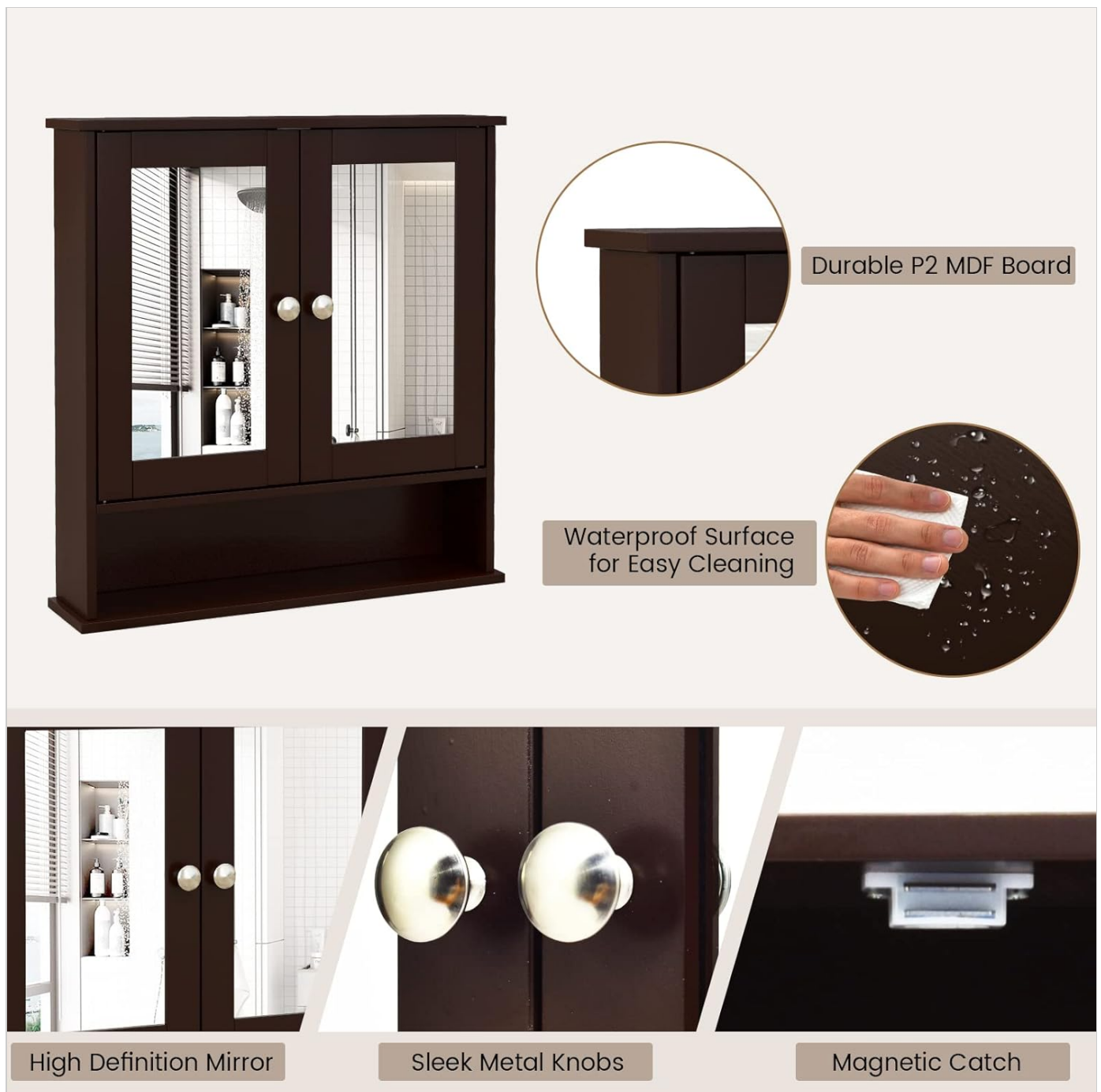
Image: A visual representation of the cabinet's waterproof surface being wiped clean, highlighting its easy maintenance.