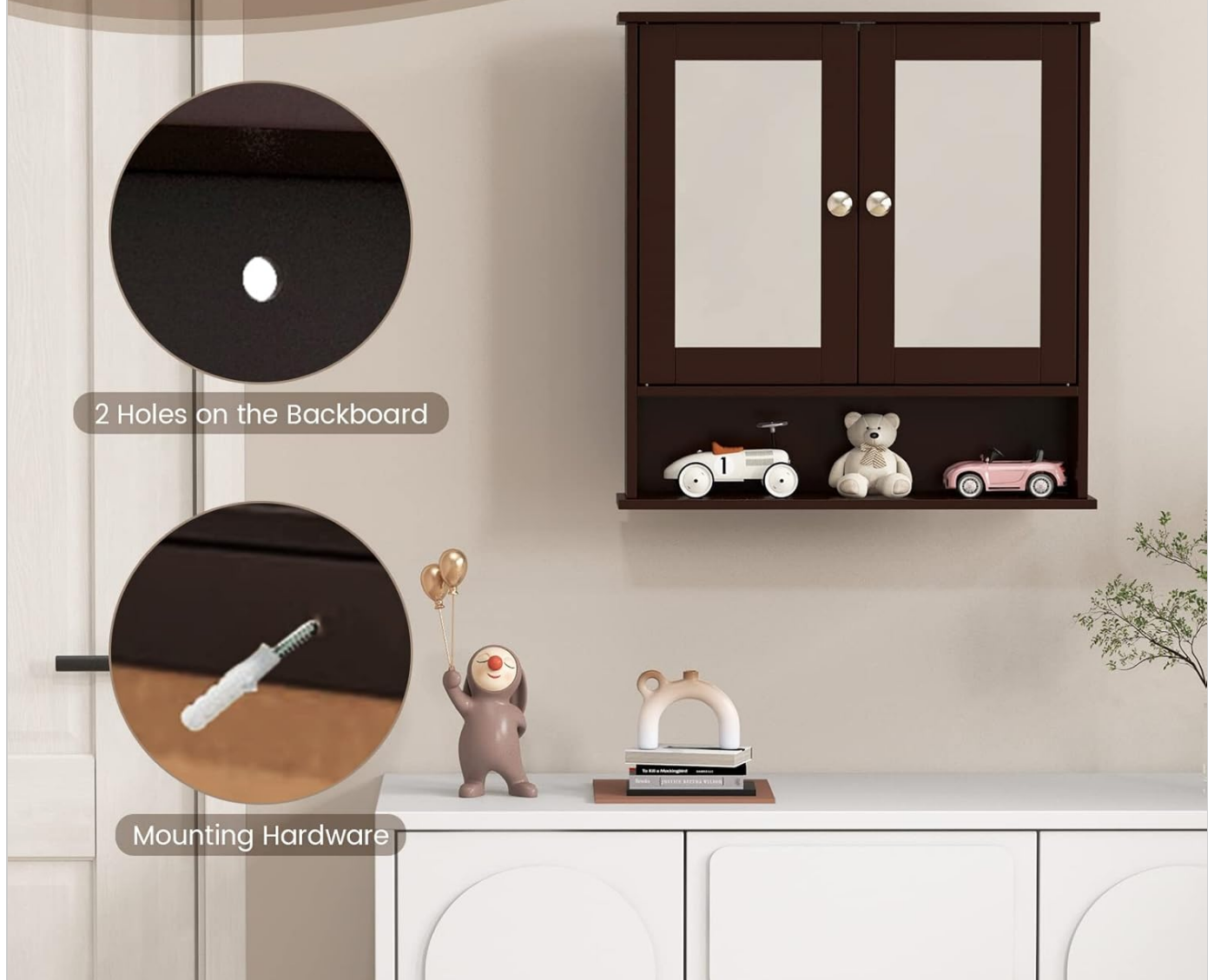
Image: This image highlights the two pre-drilled holes on the cabinet's backboard for wall mounting and demonstrates the type of mounting hardware (wall anchor) used for secure installation.