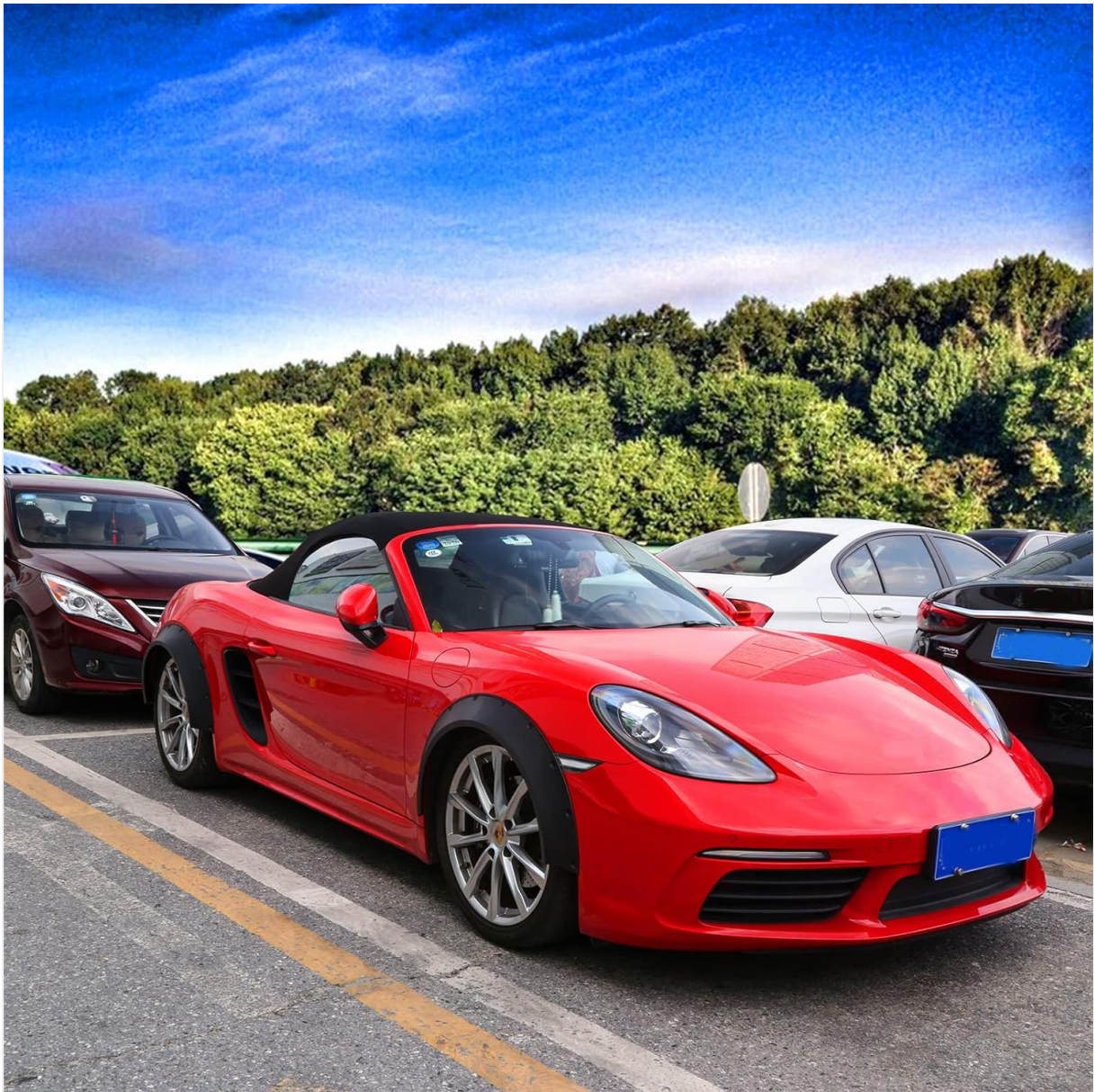
Example of DREAMIZER fender flares installed on a red sports car, showcasing the enhanced aesthetic.