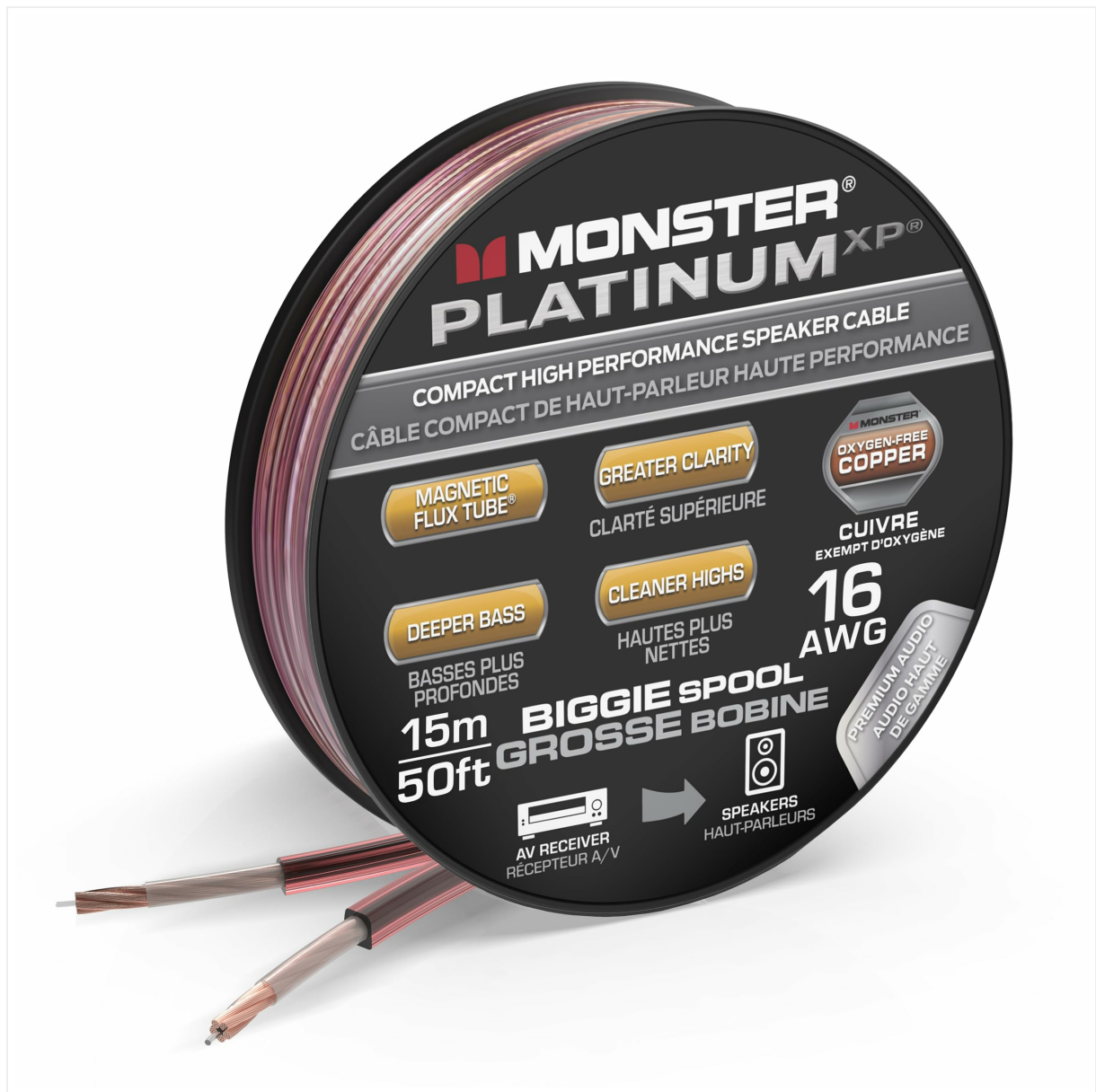
Image 1.1: The Monster Platinum XP 16 AWG Speaker Wire on a 50ft spool.