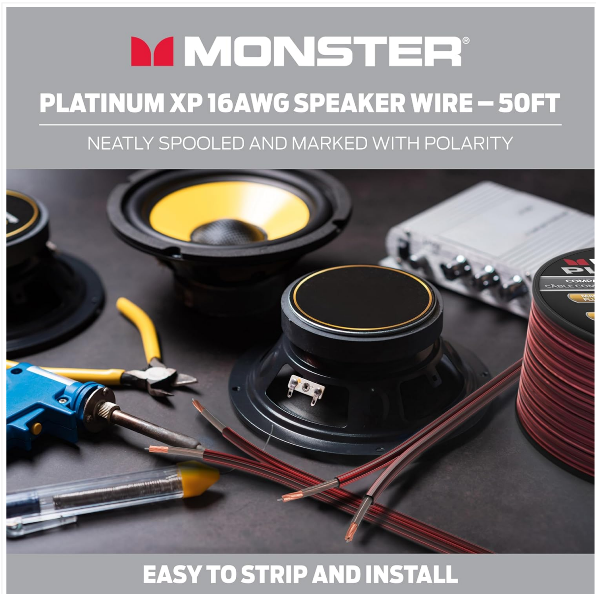
Image 2.1: Preparing the speaker wire by stripping the insulation and twisting the copper strands.