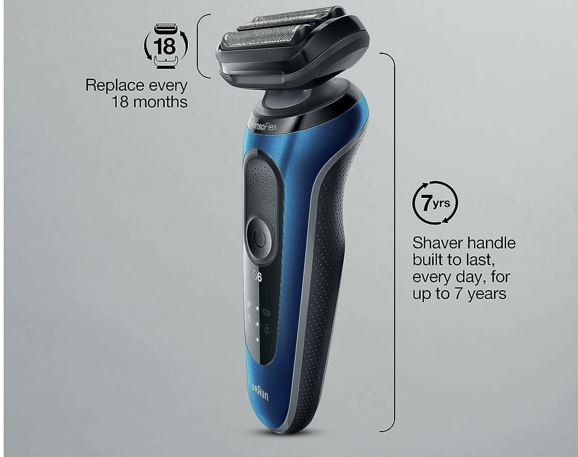
Image 5.2: Flexible blades adapt to facial contours for a close shave.