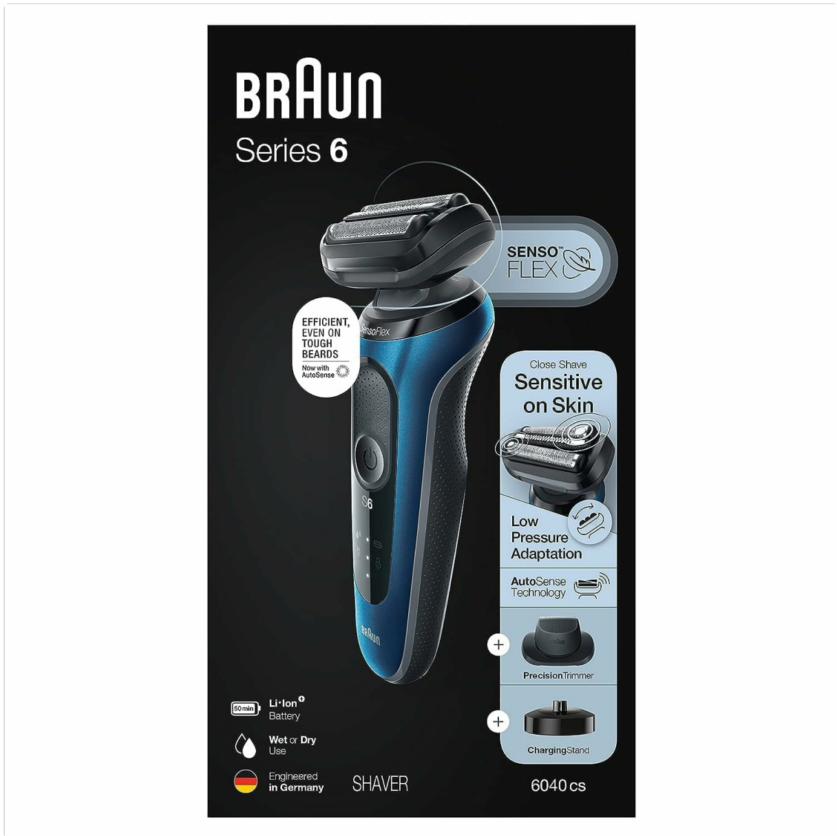
Image 1.1: Braun Series 6 6040cs Electric Shaver and included accessories.