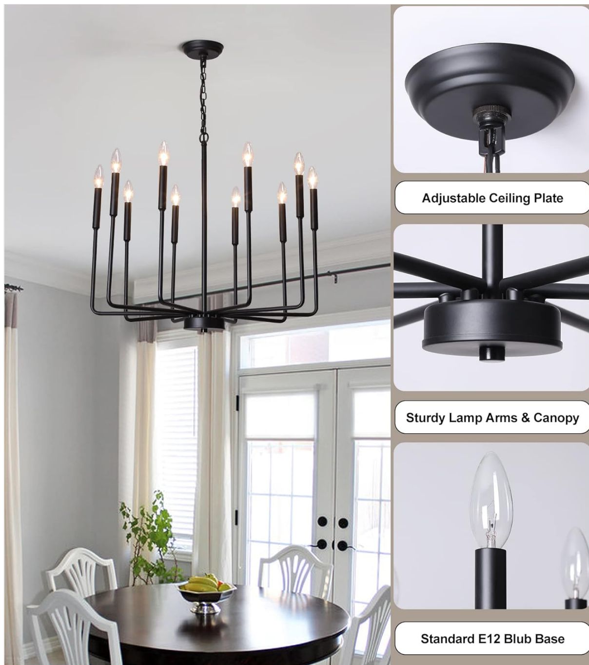
Image 6.1: Chandelier with lights off and on, illustrating compatible E12 bulb types.

connect the fixture to a compatible dimmer switch (not included).